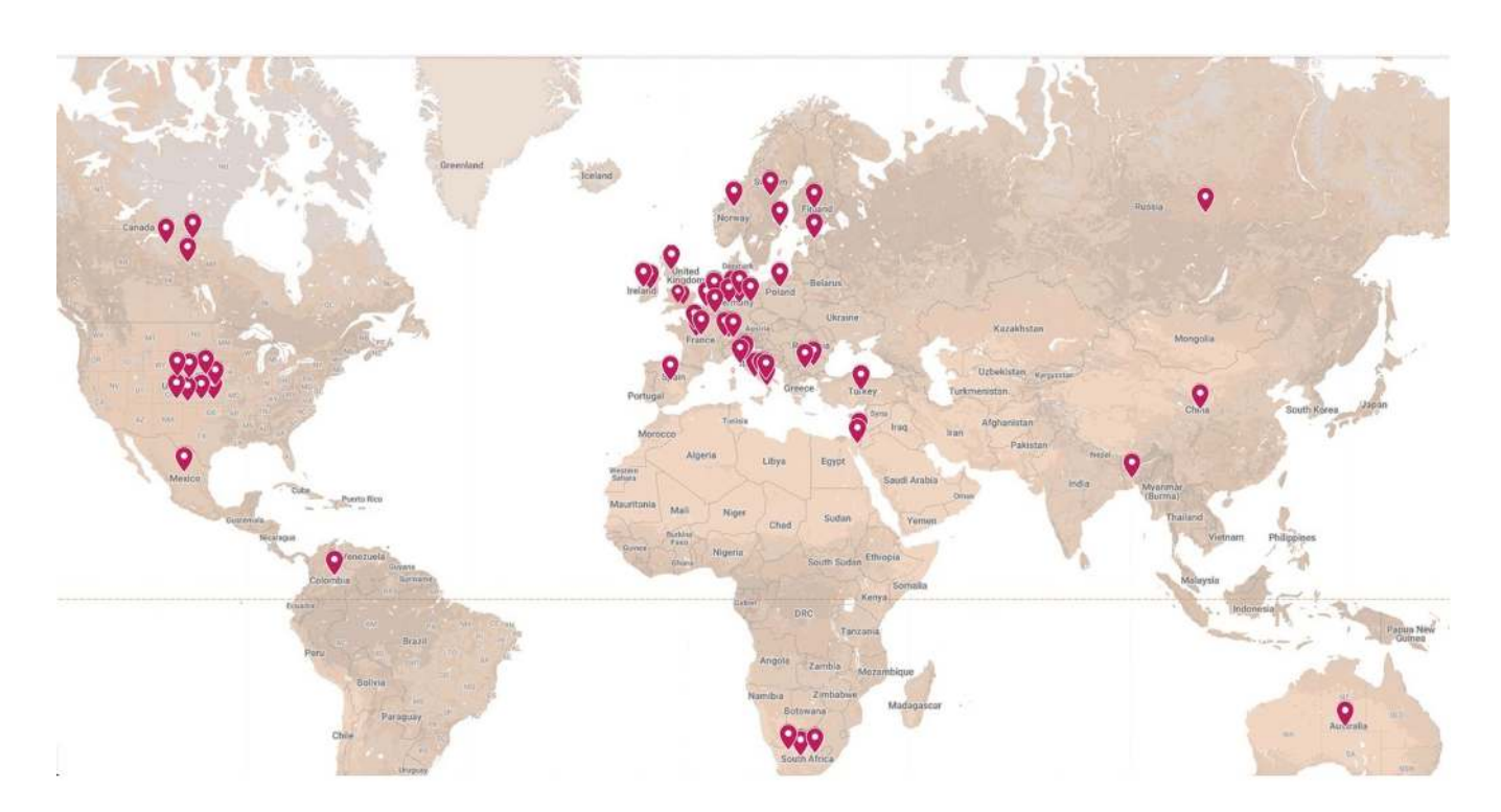
FIGURE 2 Geographical distribution of all responses, including the initial survey and the broader audience of the porphyria community, which included 63 responses from 26 countries. Each response was from either an individual expert or a collaborating group of experts.