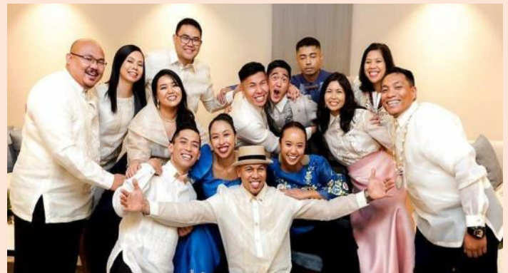
Fourteen 2019 FYLPRO delegates pose in traditional Filipiniana dresses and barongs in celebration of completing their Immersion Program during the Closing Ceremonies.