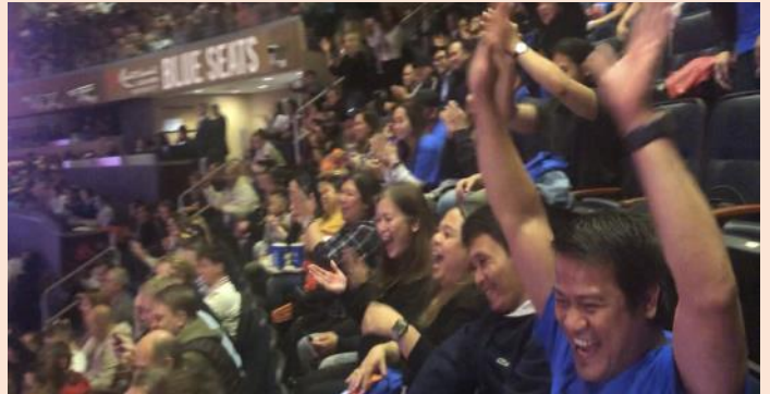
Filipinos in uproar as New York Knicks won 105-98 against Chicago Bulls during Filipino Night at MSG.

Fifteen Fil-Am kids get to stand on the court in front of NY Knicks players during the National Anthem, which was sang by Fil-Am TOFA artists. Two junior basketball teams from Sipag NY and Rise Hoops were given the opportunity to play at the center court during halftime. Members of other Fil-Am organizations participated in the pre-game shoot around and post-game free throw. Some groups were given the chance to have their post-game on-court photo. (Continue to page 6)