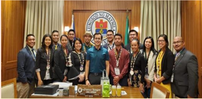
FYLPRO Delegates pose with Mayor "Isko" Moreno (center) after a courtesy call in his office at City Hall of Manila.