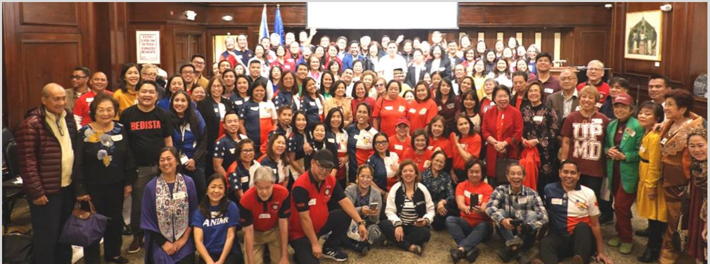
Alumni of Philippine colleges and universities during the 8 th HSK.

The 8 th edition of the Homecoming sa Konsulado was successfully held on 26 October 2019 at the Philippine Center New York, with more than 160 alumni in attendance representing 23 Philippine colleges, universities and alumni associations.