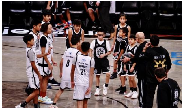
Halftime game between FABLI, JSAG, NJ Ballers and FALCON young Fil-Am