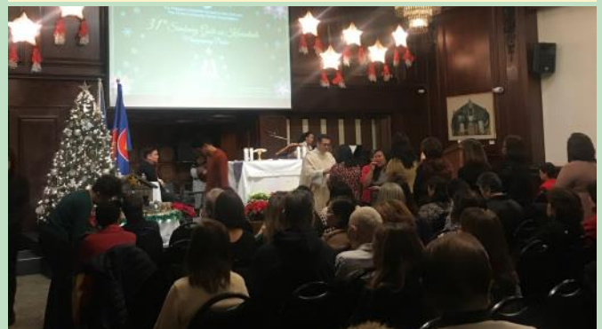
Celebration of the first night of Simbang Gabi sa Konsulado.