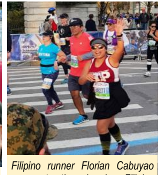
Filipino runner Florian Cabuyao waves to the cheering Filipino crowd.