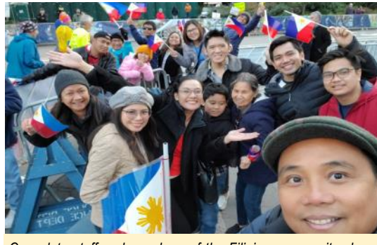
Consulate staff and members of the Filipino community cheer on the runners as they approach the final 3 mile stretch.