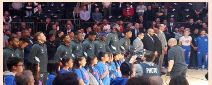
Fil-Am kids stand in front of NY Knicks players during the National Anthem.

(Continued from page 4... "Filipino American Journey")