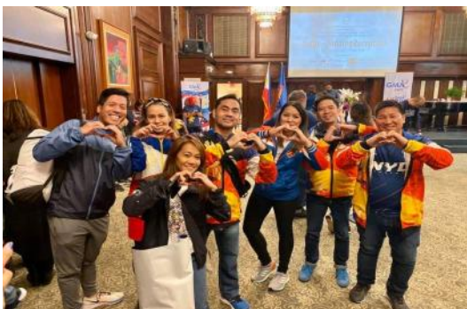
All smiles for the camera during the carbo-loading event.