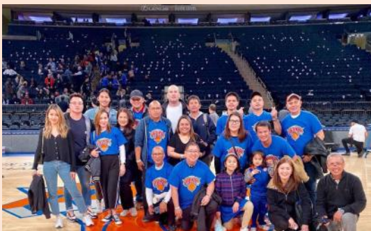
Philippine Consulate NY staff and family post-game photo op.