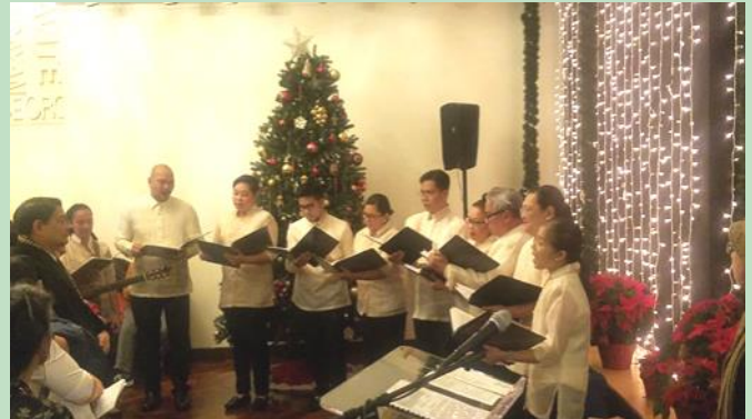
Choir singing "Joy to the World" during the lighting of the first parol.

The display ran until 6 January 2020 when the holiday season officially ends in the Philippines with the celebration of the Feast of the Three Kings.