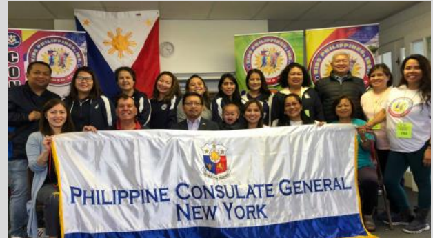
The Consular Outreach Team with KIDS Philippines, Inc., the local partners at Groton, Connecticut