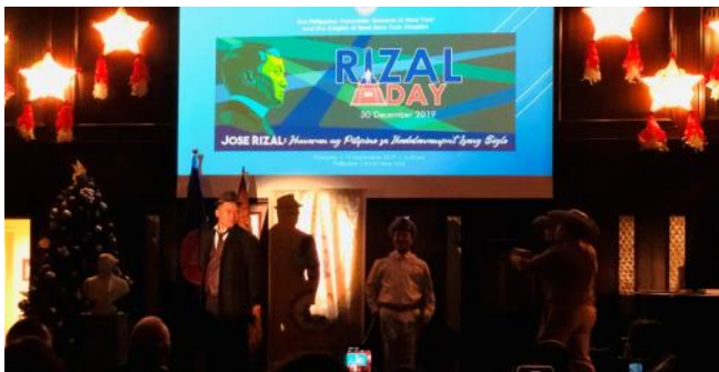
Tableau of Rizal's execution.