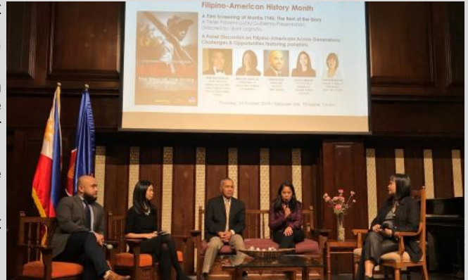
Panelists during the discussion on Filipino-Americans Across Generations.