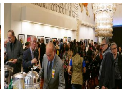
Art enthusiasts attended the opening of the exhibit.