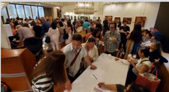
Reception at the Philippine Center Lobby before the start of the film screening.

The Philippine Center New York's Kalayaan Hall was jam-packed on Thursday, 8 August 2019, turning the night into a standing room only event as more than 170 film-goers came for the screening of the 12 short films featured during the 2 nd night of the Philippine Consulate General New York's Sinehan sa Summer 2019.