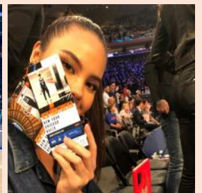
Ms. Universe Catriona Gray joins the Fil-Am community during Filipino Night with the Knicks.