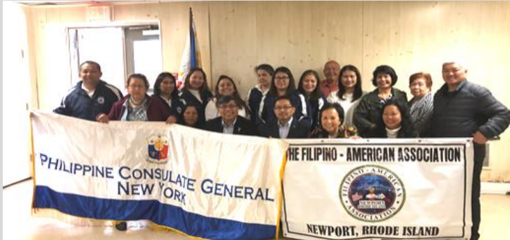
The Consular Outreach Team with the local partners, the Filipino-American Association of Newport, Rhode Island.