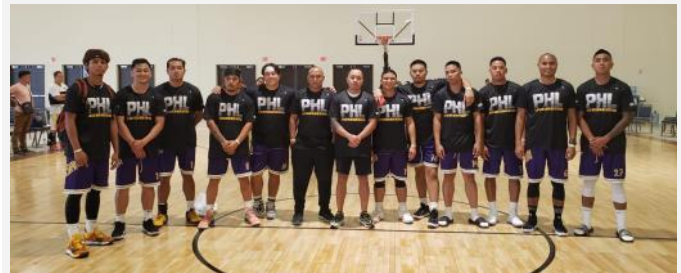
PHL Basketball Team participated in NABA 2019

Philippine Consulate staff, friends and family members dubbed as PHL Basketball team participated in the 32 nd NABA Tournament under the Albany Filipino American Basketball League (AFABL) team banner.