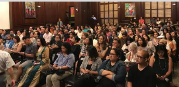
Kalayaan Hall jam-packed during the 2 nd night of Sinehan sa Summer 2019.

The short films received overwhelming positive reviews from the audience which is a mix Filipino, Filipino-Americans, and mainstream Americans. One described some of the films as "thought-provoking" while Lola , Mansyon , and "P" elicited good laughter from the audience.