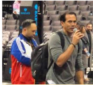
Filipino American Miami Heat Coach Eric Spoelstra greeted fans and supporter of the Filipino Heritage Night