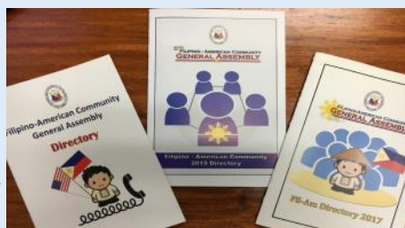
Samples of the three editions of the US Northeast Filipino-American Community Directories published in 2016, 2017 & 2019.

The Fil-Am Community directory was printed in partnership with Synergy Production & Marketing, Inc with the support of GMA Pinoy TV, Philippine Airlines-New York, and Fiesta in America.