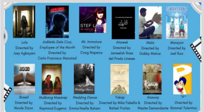
Lineup of short films screened during the 2 nd night of Sinehan sa Summer 2019 at the Philippine Center New York