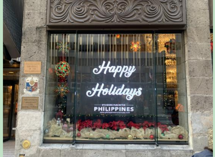
The windows of the Philippine Center in New York are adorned with traditional parol and Christmas decor.