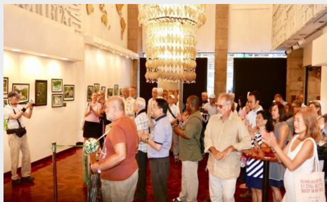
Guests admire the 24 (twenty-four) photographs of the “Bucket List Trek” exhibit.