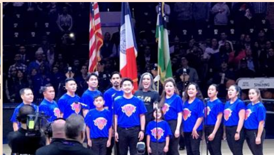
TOFA artists sing the National Anthem during the Filipino Night with the Knicks.