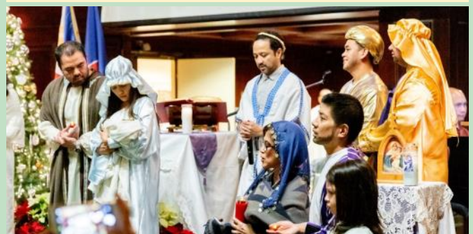
Volunteers from our Filipino community reenact the "Panunuluyan."