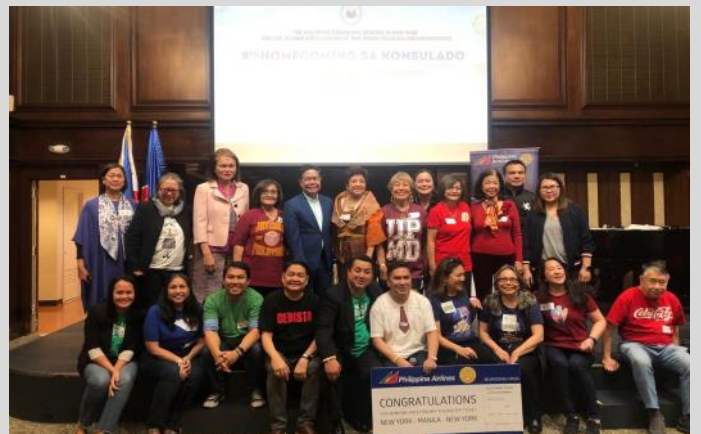
Members of the 2019 HSK planning committee

(Continued from page 2.. Homecoming sa Konsulado)