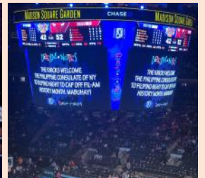
Messages & greetings to NYPCG and other Fil-Am organizations displayed on Garden Vision during halftime.