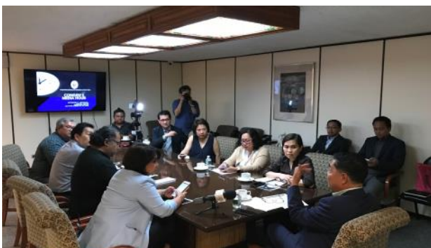
Members of the FAPCNY listen attentively as Consul General answers their questions.