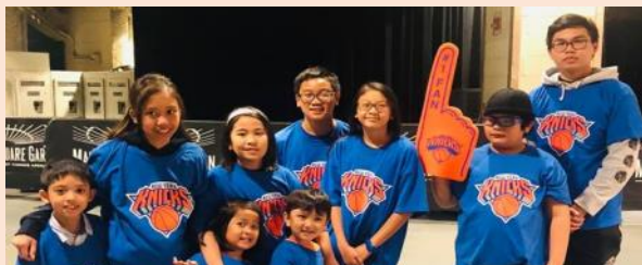
Fil-Am Kids await their turn to enter the court for their Anthem experience with the players from the NY Knicks.