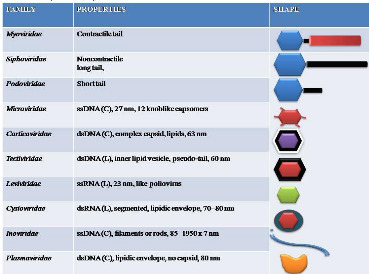
Table 1: Taxonomy of Bacteriophages