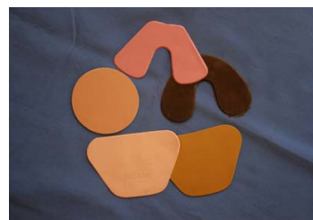
Shellac based dental plates

Dental base plates are used to replace missing teeth just like a false teeth. The plates are used as an intermediate in prosthesis. After checking in the patient's mouth and possible corrections, the base plates are replaced with synthetic resins. The base plates are plastic compositions comprising of shellac, fillers and colouring