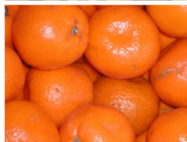
Coated kinnow fruits

Around 40 litres Lac-based fruit formulation for kinnow has been evaluated in more than ten kinnow waxing and grading plants at Abohar and approximately 83 tons of kinnow fruits were coated with above formulation. The kinnow traders in Punjab felt that its application produced better results in respect of gloss, spread area and firmness to the fruits as compared to commercial waxes.