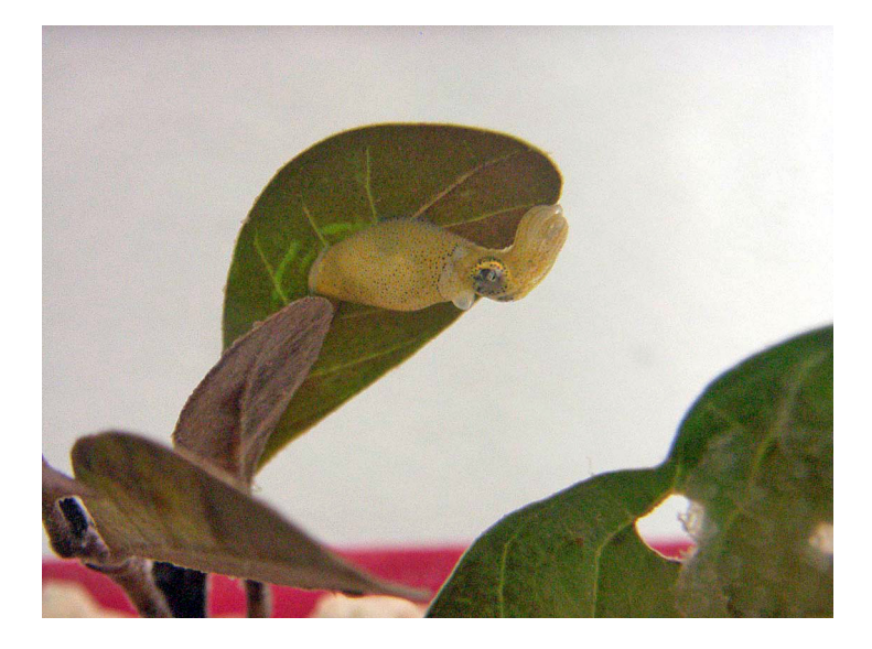
Fig. 1. – Idiosepius biserialis from the Andaman Sea, Thailand. The animal sticks to the leaf of an aquarium plant using its dorsal attachment organ; the peculiar position of the arms is exactly as described by Sasaki (1921).

Boletzky 2003). The small adult size (10-18 mm total length), the attachment behavior of adults of Idiosepius , and direct development raise questions about the ecology of the species. In particular capacity for dispersal during the lifetime, mobility during the post-hatching planktonic phase, patterns of distribution and the related consequences of biological and ecological constraints, and reproductive strategies allowing continuous growth and enhanced reproductive output. Thus, the Idiosepiidae have a diversity of traits that are interesting from a variety of evolutionary perspectives. While there has been a long history of the use of cephalopod systems being used as models to inform function and evolution of vertebrate systems e.g.,