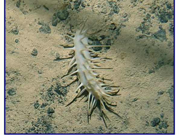
Fig. 9. Deep-water Elipiidae species holothurian, related to the Scotoplanes species common in the Ross Sea.