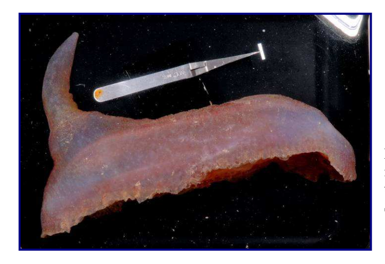
Fig. 11. Phsychropotes species. displaying its characteristic dorsal spike. Caught by the beam trawl at 3300m depth (Photo: Stefano Schiaparelli).

These are deep sea animals found over a wide latitudinal range, rather than the exclusively Antarctic fauna we have seen up to now. Even those that look like the familiar Scotoplanes sp. 'sea pigs' of the Ross Sea, are actually from a different family (Elipiidae), which is widespread in the deep sea below 2000m. These deep-water holothurians often have bizarre protuberances, such as the dorsal spike on the Phsychropotes sp. specimen (Fig. 11). We can only guess at the purpose of these appendages at this stage.