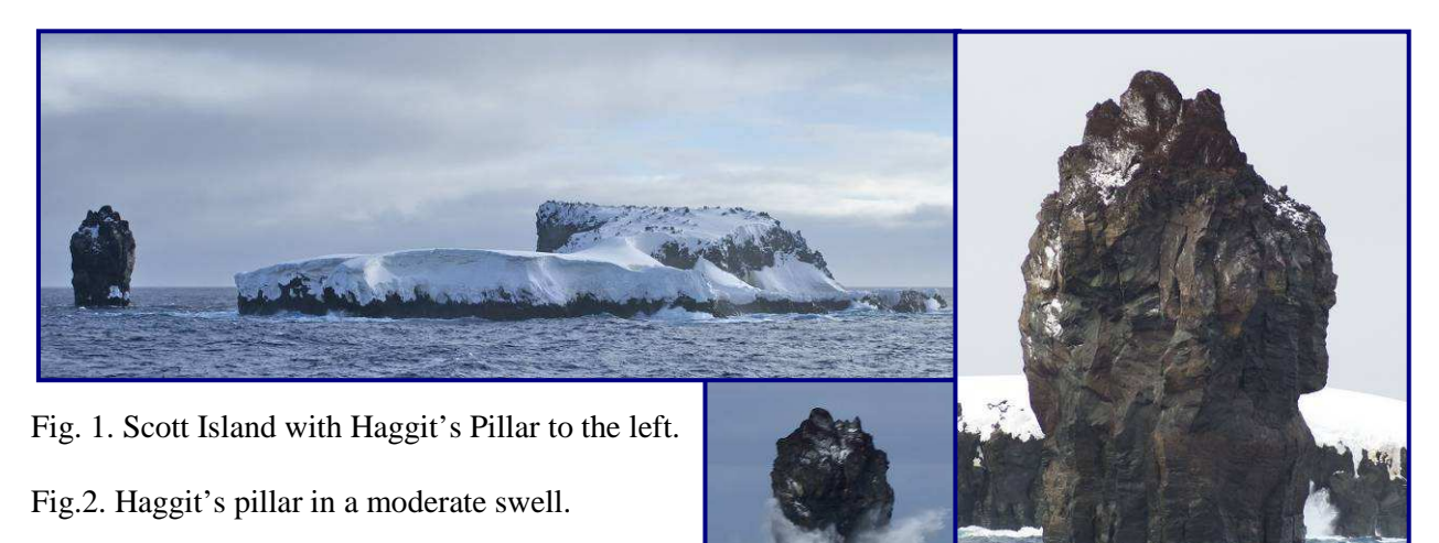
Fig.3. Haggit's Pillar with Scott Island in the background.

After completion of the first abyssal station in the northern part of our survey – at a depth of 3500m – we moved on to our last seamount station next to Scott Island. Scott Island is very small (400m by 200m) and isolated, lying about 310 nautical miles northeast from Cape Adare. Its companion – Haggit's Pillar – is an impressive 62m high volcanic stack sitting 200m northwest of the island. We are sampling in this area to compare the biodiversity with that of the Balleny Islands some 500 nautical miles to the west that have been sampled in earlier expeditions by Tangaroa . Scott Island was first discovered in December 1902 by Lieutenant Colbeck on the vessel Morning while heading south to supply Scott's 1901-04 expedition on HMS Discovery .