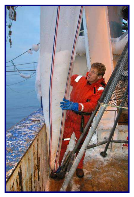
Fig. 7 (right). Salp from the neuston net

Neuston is the name for zooplankton that live in the top few centimetres of the ocean. To sample these organisms we have a specialised net which is towed, right on the surface at about 1.5 knots, from the side of the ship. We've had limited opportunities to deploy the neuston net during the voyage because of the sea and ice conditions we've encountered. In rough seas, the net bounces from wave top to wave top and does not sample the neuston effectively. When the sea is cold (as it has been), newly forming grease ice fills the net, sometimes creating a giant seawater slushy! (Fig. 6). When we have succeeded in sampling, the dominant organisms have been salps (planktonic relatives of sea squirts; Fig. 7 & 8) and amphipods, (small crustaceans that are related to sandhoppers).