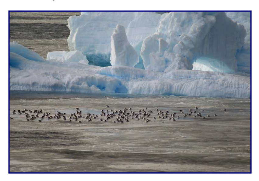
Fig. 4. Old eroded berg surrounded by new plate ice with a flock of Antarctic Petrels resting on the ice.