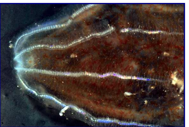
Fig. 8. Ctenophore collected in the southern Ross Sea.