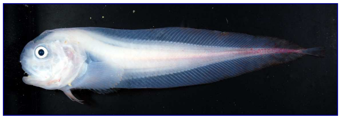
Fig. 12 One of the five varieties of snailfish collected to date.

The Liparidae (snailfishes) is a very unusual and taxonomically challenging family of fishes. The different species are difficult to distinguish, and accurate identification generally requires sophisticated techniques such as X-ray counts of numbers of vertebrae and fin rays. However, by careful examination of the specimens, and comparing the high quality colour photographs, it is clear that we have already caught at least five different species from the shelf and slope of the Ross Sea. Most species of snailfishes are relatively small with a length of 15–20 cm, but we have caught several specimens of Paraliparis sp. of almost double the length at 30–35 cm. Two days ago we completed our deepest bottom trawl to date at almost 2000 m depth and caught eleven specimens representing at least three different species – a veritable snailfish heaven!