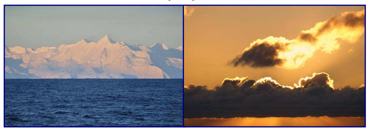
Fig.1. View of Mt Herschel 45nm away.

We finished our time on the inside of the ice barrier with a perfect Antarctic day – clear and sunny skies with great views of the distant Admiralty Ranges of Northern Victoria Land, including Mt Herschel (3335 m), Mt Sabine (3714 m) and Mt Minto (4163 m), along with great sunrises and sunsets.