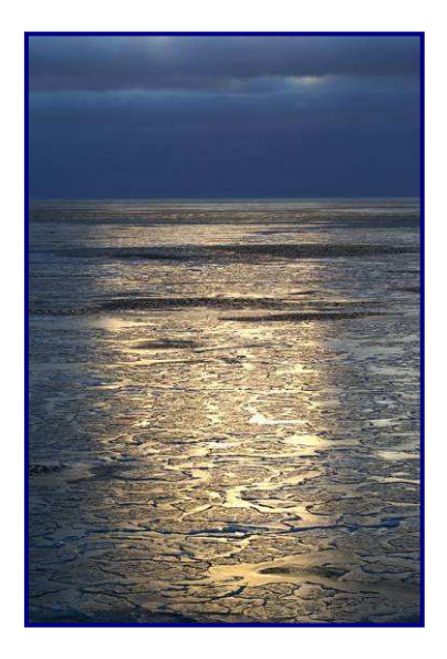
Fig 3. Newly forming ice

It is now time to leave the inner Ross Sea. The workable area is reducing as the end of the summer season arrives and the freeze starts. Water temperatures are down to -1.85°C and new ice is becoming common. We are now starting our steam northwards through the 120 mile wide ice barrier heading towards open water where we will continue our sampling programme on the Antarctic seamounts and the abyssal plain (3000-3500 m) in the outer reaches of the Ross Sea region.