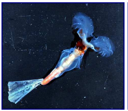
Fig.7. Pteropod collected in the northern Ross Sea