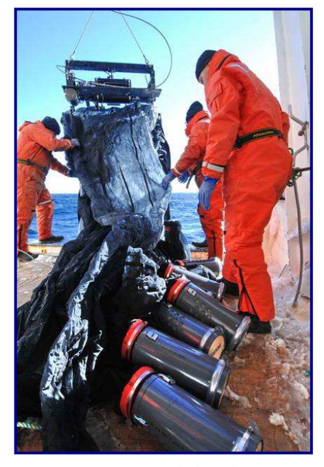
Fig. 5. MOCNESS system being deployed in the northern Ross Sea.

At the stations above the slope in the Ross Sea, we have found that the zooplankton populations are dominated by salps (planktonic relatives of sea squirts) in the surface waters and at deeper depths by crustaceans. We have collected several interesting types of zooplankton, including pteropod (Fig. 7) and ctenophore species many of us have not seen before (Fig. 8). The pteropods (planktonic snails) have a shell made of carbonate, which makes them particularly susceptible to the predicted decrease in pH (i.e. increasing acidity) in the ocean due to increasing atmospheric CO_2 . We have also caught larval fish and juvenile squid with the MOCNESS.