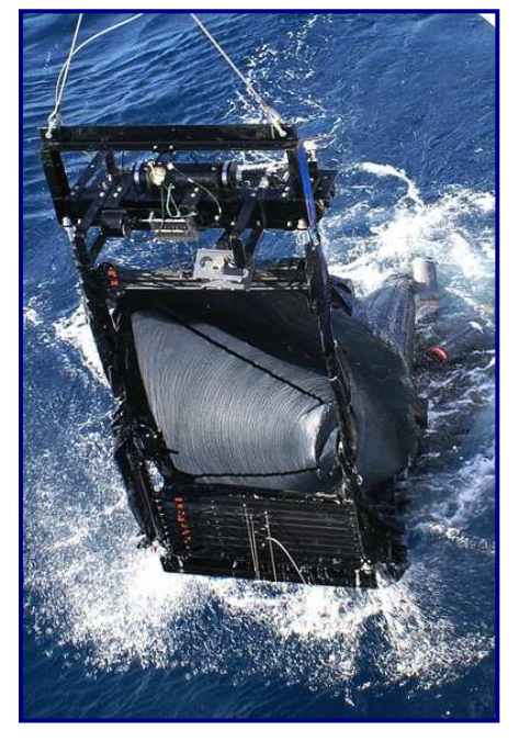
Fig.6. MOCNESS in recovery mode