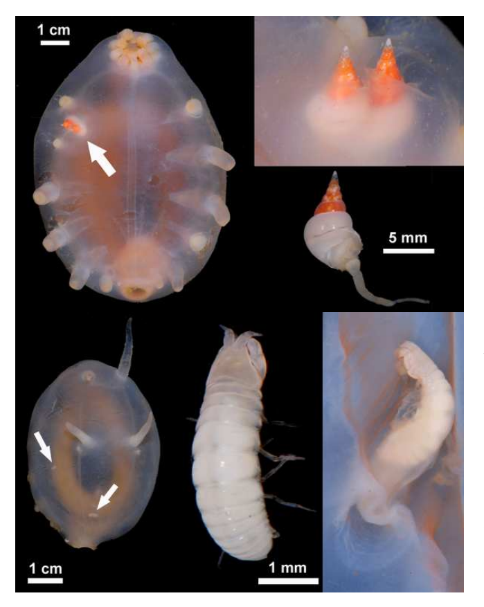
Fig. 9. Parasitic association between Stilapex (snail) and Scotoplanes (holothurian 'sea pig'). The arrow points to a couple of snails deeply embedded in the holothurian skin, on its ventral side. The snails with only half of their shell visible live permanently in this position, under the protection of the host. They feed on body fluids of the holothurian, by using the long and extensible proboscis (bottom right).

We have just discovered two new parasites of the holothurian (a group of echinoderms with soft, cylindrical bodies, including sea cucumbers) known on the Tangaroa as 'sea pigs'. The first parasite is a small mollusc and, in Fig. 9, two of these snails can be seen happily embedded in the body wall of a sea pig. They live permanently in this position, feeding on the body fluids of their host using their long proboscis (bottom right). The second is a tiny crustacean which lives completely inside the sea pig and feeds on its internal tissues (Fig. 10).