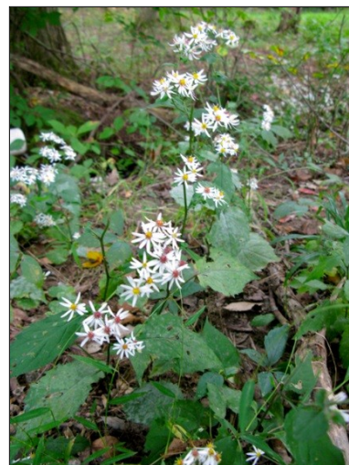
White Wood Aster Eurybia divaricata