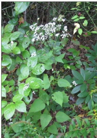
White Snakeroot Ageratina altissima

Garden Phlox, Phlox paniculata : Full to part sun, average moisture. This plant starts blooming in early June and continues through October. It can grow in part shade and can often be found alongside roads and small creeks. Its sweet fragrance attracts many species of butterflies and bees.