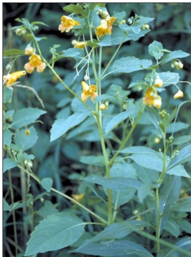
Orange Jewelweed Impatiens capensis

Great Blue Lobelia, Lobelia siphilitica : part sun to part shade, moist soil. A “cousin” of the Cardinal flower, Lobelia cardinalis , it is more common in the mountains but will also grow in moist, part shaded areas in the Piedmont. Hummingbirds will visit this plant several times a day for nectar.