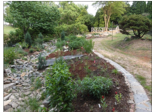
Native Terrace in 5-14