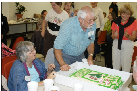
A birthday cake for the esteemed professor was enjoyed at the Fall Trip dinner.

rating collections under the direction of whomever UNC Charlotte's new horticulturist will be; working at the Reedy Creek Herbarium. He expects to consult with homeowners about their yards, helping them to determine what to plant. He will continue to accept speaking engagements, and to promote his book. And he wonders whether he should write another book. We need one about shrubs for the Southeast, he thinks.