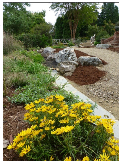
Terrace Pre-Party 9-14