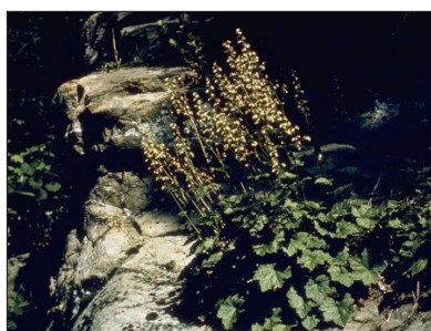
American Alumroot Heuchera americana