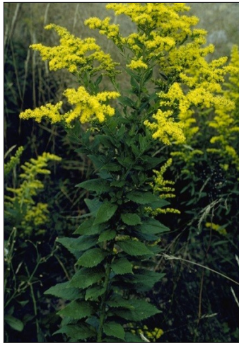
Wrinkle-leaf Goldenrod Solidago rugosa

What can we do to support our native pollinators? At the top of the food chain, we have the means and the knowledge to maintain our helpful insect population. We must continue to add valuable native foraging plants in our gardens and farms, and we must stop the casual use of pesticides. Our