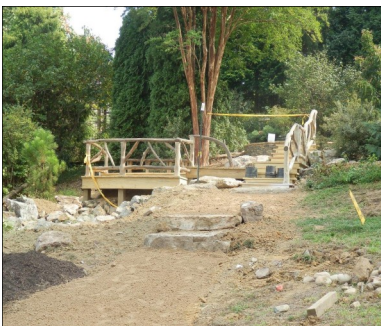
Terrace deck in 9-13

So, we decided to raise some money and move ahead with this new and unique garden design concept. It just had to be good because it was such a great idea, and thus it would win awards in architecture journals and host droves of homeowners wanting to come out and learn about landscaping with natives (or learn about landscaping with anything for that matter). Since we had no money, we wrote a grant application and received some significant money from the Stanley Smith Horticulture Trust in California. Second, I asked the NC Native Plant Society if they would give us $10,000 to help underwrite this ambitious project in return for dedicating my native plants book to them. They (you) did, and I did. And we were greatly encouraged because we now had some financial backing that gave us the confidence to move ahead. We are certainly