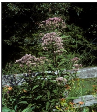
Hollow-stem Joe-Pye Weed Eupatorium fistulosum

native plant societies are critical resources, along with cooperative extension services and university biology departments, for providing education and information to the public on native plant species for each region.