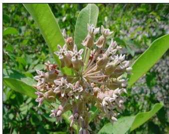
Common Milkweed Asclepias syriaca