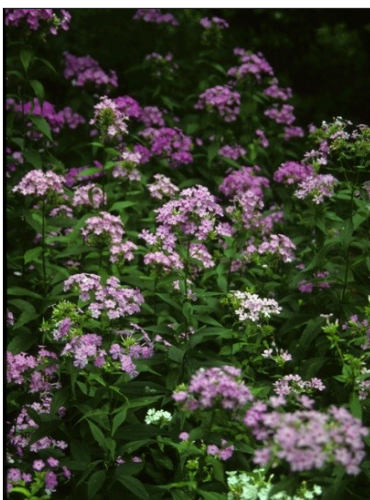
Garden Phlox Phlox paniculata