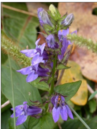
Great Blue Lobelia Lobelia siphilitica

The last few months of the year are the perfect time to plant perennial natives, when seasonal rains soften the ground and the cooler weather allows the ground to retain more moisture to encourage root growth and reduce the shock of transplanting. Let's spread the word to our neighbors and be examples of good stewardship and plant a wide variety of foraging plants for our pollinator heroes!