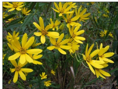
Schweinitz's Sunflower Helianthus schweinitzii