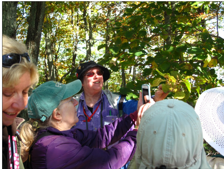
NCNPS members enjoy viewing the beauty of Pilot Mountain natives during the annual Fall Trip.