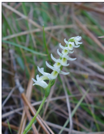
Giant Spiral Orchid