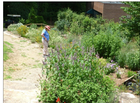
Terrace Agastache, and Monarda, Pycnanthemum in 7-14