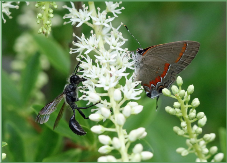
Titi (Cyrilla racemiflora)