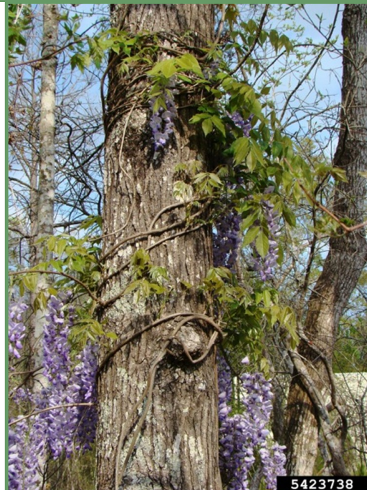
Asian Wisteria girdling tree.

Roadsides, fields, and other disturbed areas are always fertile ground for invasive species, and the Sandhills are no exception. Our native Groundsel Tree ( Baccharis halimifolia ) has been able to move from its original brackish marsh edges into inland habitats, especially along salted highways and the edges of farmlands and timber plots. Other roadside weeds in this region include Showy Rattlebox ( Crotalaria spectabilis ), a southern Asian species that doesn't appear to be moving into natural communities; Asian Rockbell