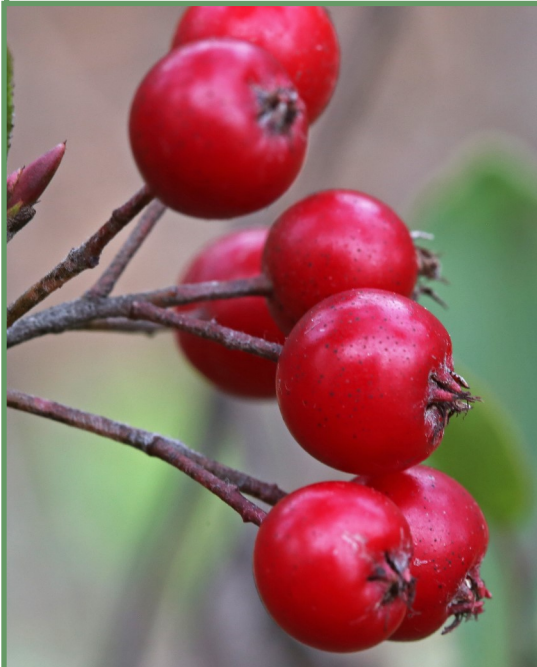
Red Chokeberry (Aronia arbutifolia)

The species we saw were the rare White Wicky , fairly rare Coastal Witch-alder , Dwarf Azalea , Swamp Azalea , two shrub hollies, Mountain Sweet-pepperbush , Red Chokeberry , Titi , Coastal Plain Shadbush , Blaspheme-vine , Poison Sumac , Shining Fetterbush , Staggerbush , Northern Maleberry , Horsesugar , Honey-cups , Southern Sweet Bay , Coastal Fetterbush , Common Wax-myrtle , Sourwood (technically perhaps a tree), and Eastern Prickly Pear (technically a woody plant).