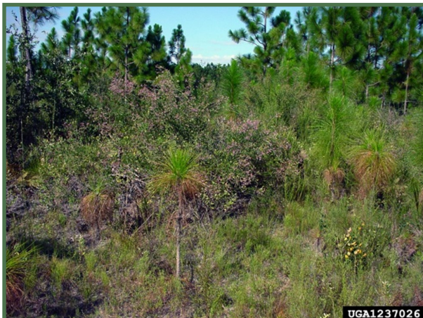
Bicolor Lespedeza in Longleaf Pine forest.