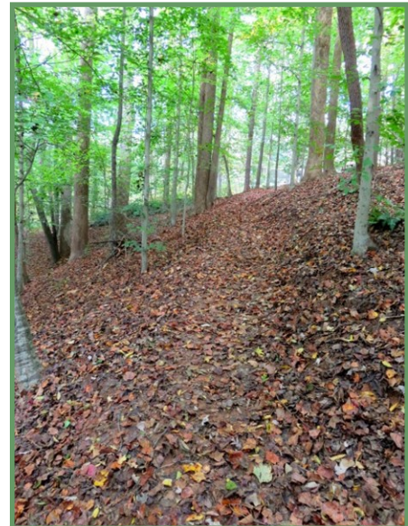
New path on the hill at the Emily Allen Wildflower Preserve.

The Emily Allen Wildflower Preserve is home to over 500 species of native trees, shrubs, vines, ferns, and herbaceous plants. This 5.5-acre preserve is now owned and managed by the PLC, with PLC staff members and a dedicated group of volunteers who work hundreds of hours each year in the garden. Many of the volunteers are NCNPS members.