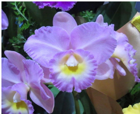
Reserve Champion and Champion Laelinae Rlc. Lakehaven Pearl 'Colleen' Owned by Bruce Wood