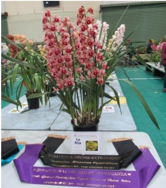
Grand Champion Cymbidium Cym. Rod's Tango 'Tobruk'