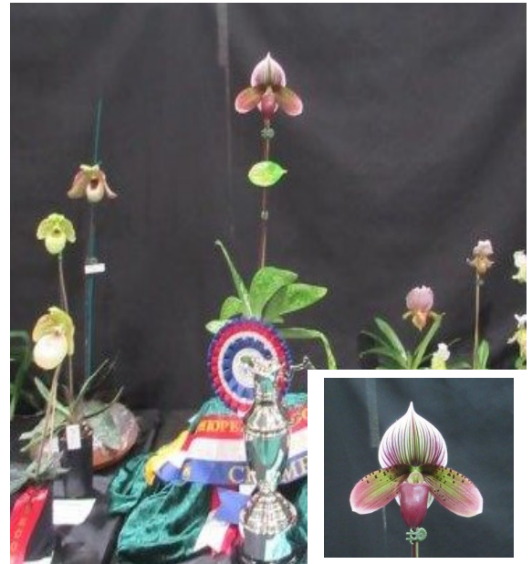
Grand Champion of both the Paphiopedilum Show at Dural & St Ives Orchid Fair Paph. Hsinying Malone 'Yeowie'