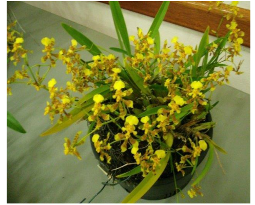
Oncidium longipes Owned by Cary Polis