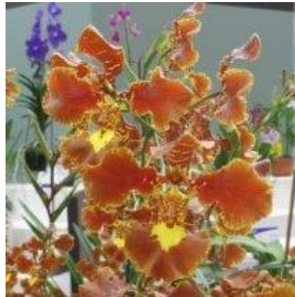
Champion Species Orchid & Supreme Champion of the Show