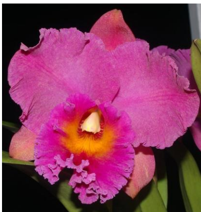
Judges Choice, Rlc. Brunswick Gem 'Coral' Owned by G & A Cushway