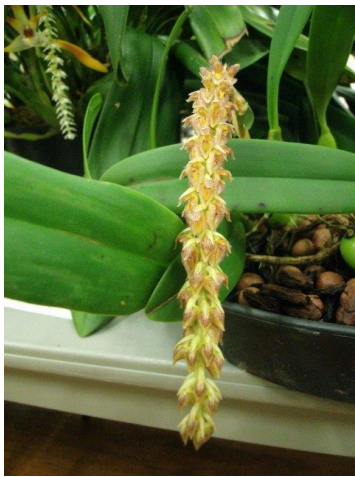
Bulb. lilacinum Owned by I & I Chalmers