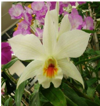
Den. Fire Coral Owned by Ela Kielich