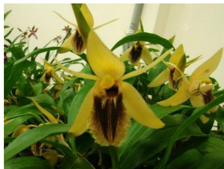
Best of Evening Open Coel. ovalis Owned by Cary Polis