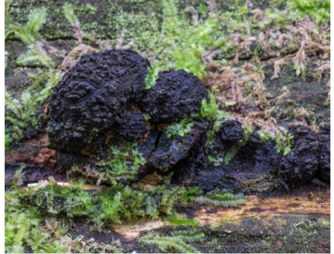
As of yet unidentified specimen, possibly in the Daldinia genus

Agaricus sp. (small but very young, almond odor, in clusters close to the base of a tree)