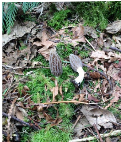
Morels found around Lake Padden!