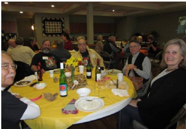
Revelers toward the end of the feast, satisfied!