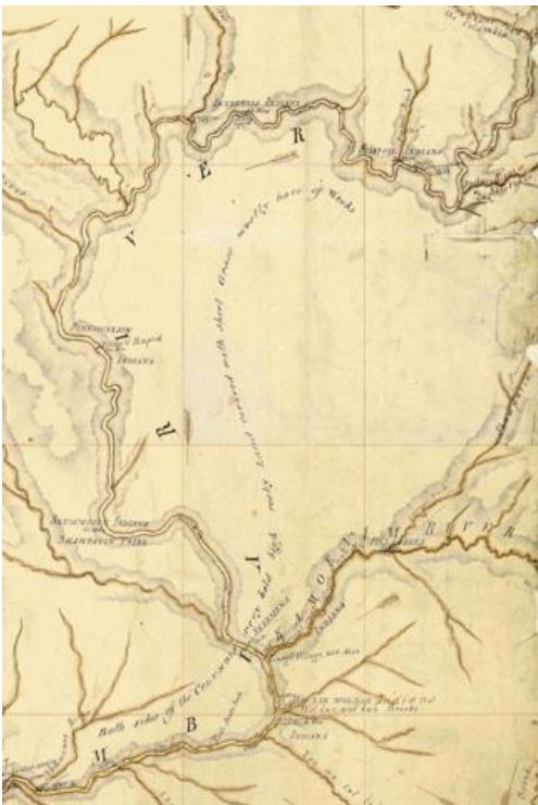
David Thompson ca 1826, Map of North America from 84° West, Sheet 5 (detail), National Archives, London