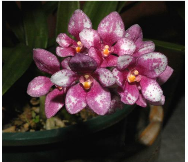
ABOVE: Sarcochilus Red Cascades