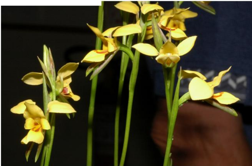
BELOW: Diuris drummondii