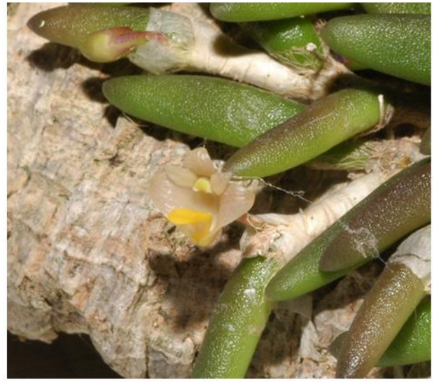
ABOVE: Docrillia prenticii