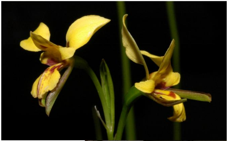
ABOVE: Diuris brevifolia