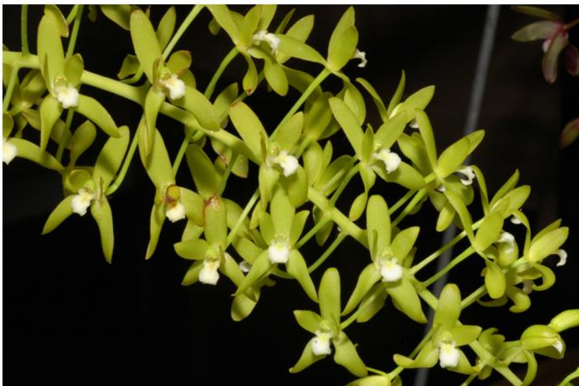
ABOVE LEFT & CENTRE: Cymbidium madidum var. leroyii