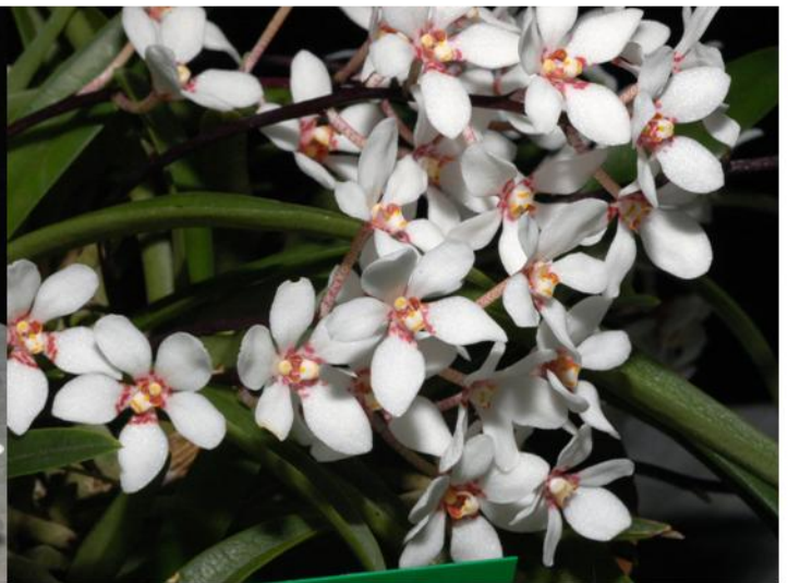
ABOVE: Sarcochilus Cherie Snow

PLANTS BENCHED NOVEMBER 2006—2 EPIPHYTES