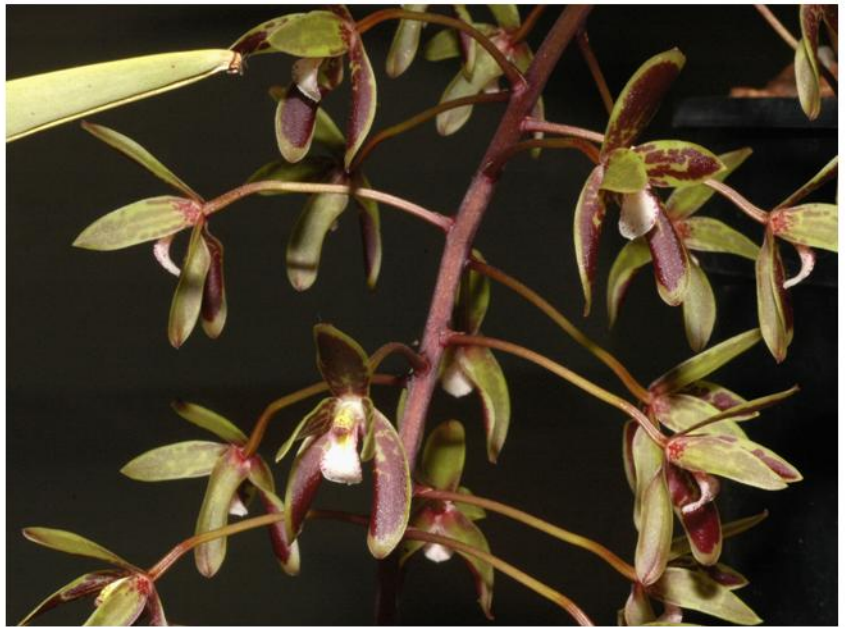
ABOVE and BELOW RIGHT: Cymbidium canaliculatum 'Gladstone'