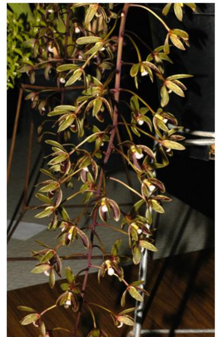
PLANTS BENCHED NOVEMBER 2006—1 EPIPHYTES