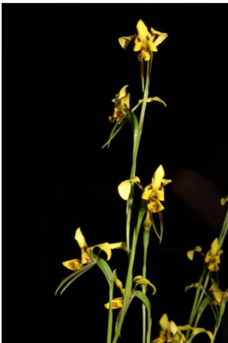
Diuris sulphurea x brevifolia