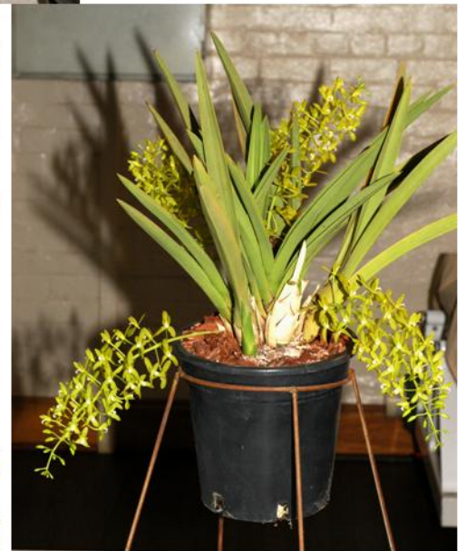
ABOVE : Cymbidium canaliculatum 'Alba'