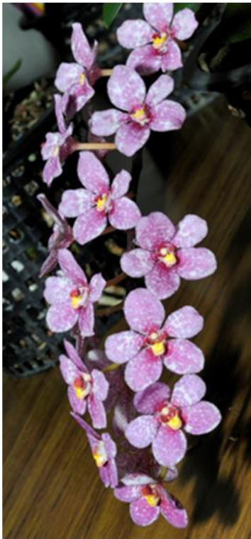
Sarc. Burgundy on Ice