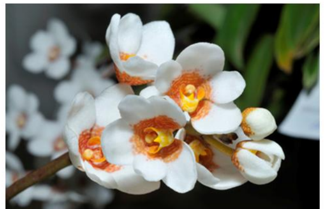
Sarcochilus hartmanii 'Golden Eye'