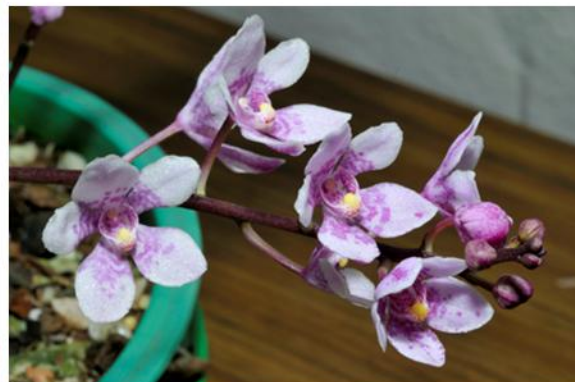
Sarcochilus Highton Magic