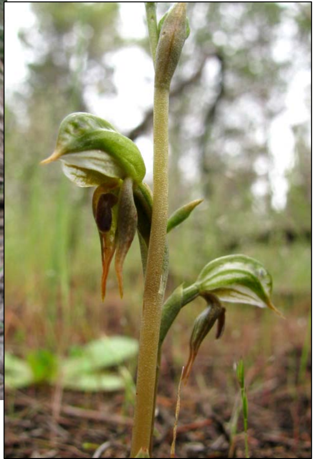
RB, Oligochaetochilus sp Sandy Creek, with O. pusillus behind