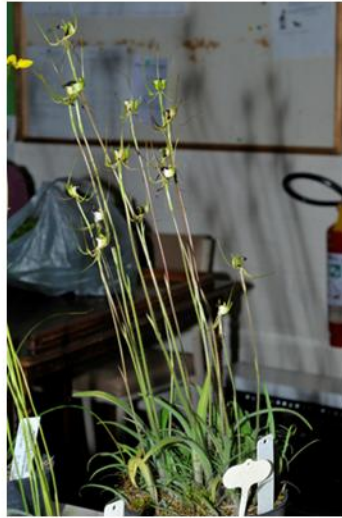
Caladenia tentaculata . Count the seedlings.