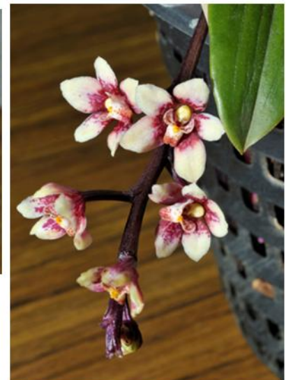
Plectorrhiza