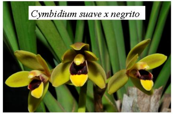
Cymbidium suave x negrito