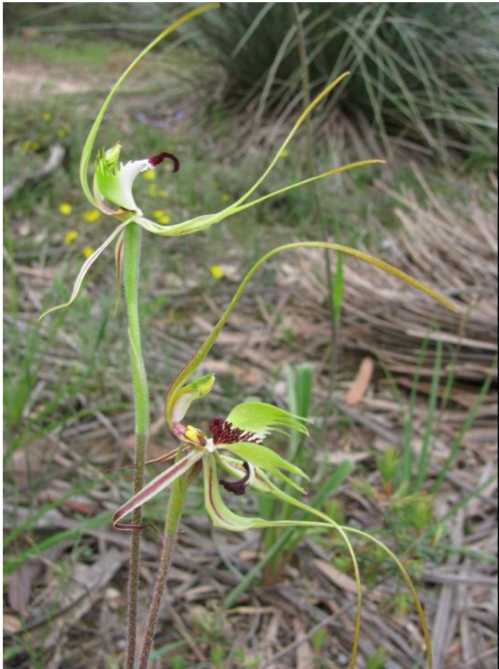
RB, Arachnorchis tentaculata , Altona ssp left, ssp tentaculata right note smaller rigid flower of ssp Altona