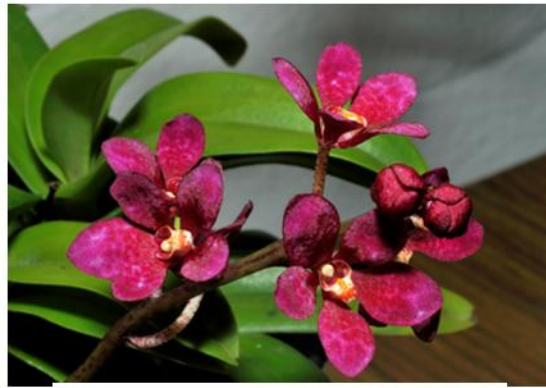
Sarcochilus Bernice Klien x Zoe