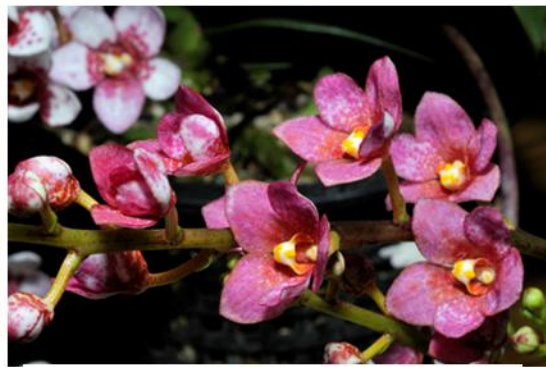
Sarc. Nabiac x Heidi 'Wedding Day'