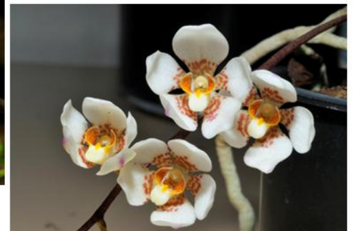
Sarcochilus falcatus x hartmanii