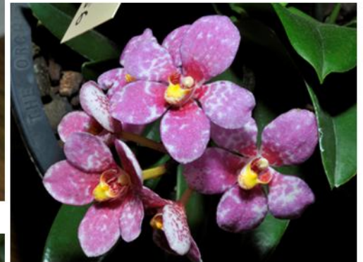
Sarcochilus Burgundy on Ice