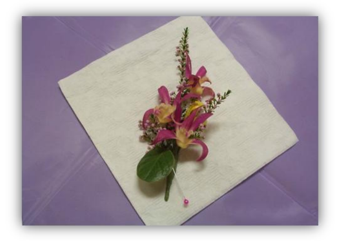
One of only two non-terrestrials, this floral display was taken at one of the Spring Shows.

As a large number of the NOSSA membership is unable to attend the meetings, the next two issues will feature some of the other entries to the Picture Competition. The commentary on the pictures has provided an opportunity for members attending to learn something more of our native orchids. Members have mainly entered terrestrial pictures with only one or two non-terrestrials. Any Australian orchid picture is eligible.