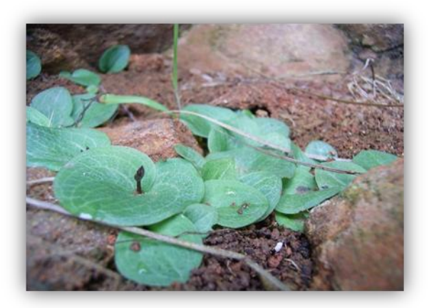
It doesn't need to be in flower as seen in these Cyrtostylis reniformis leaves. Many species can be identified from the leaves alone.