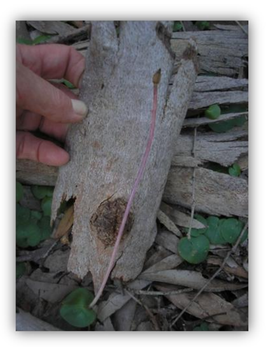
An example of a Corysanthes capsule. This elongation assists with seed dispersal.