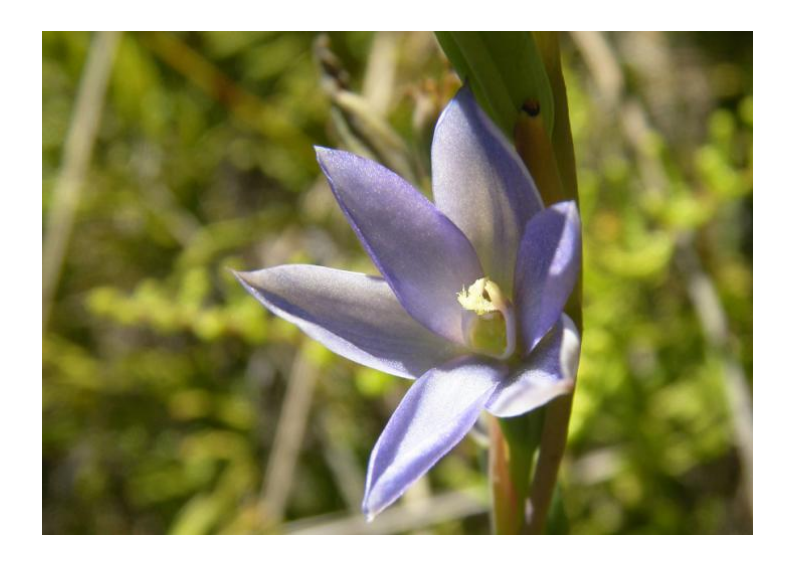
Thelymitra circumspecta , one of the last of the summer flowering sun orchids, is found in swamps.