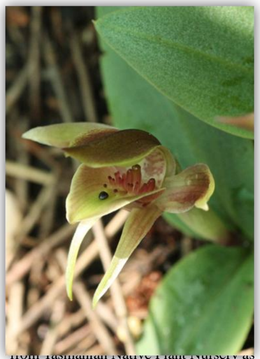
Simpliglottis gunnii but turned out to be a S. triceratops.