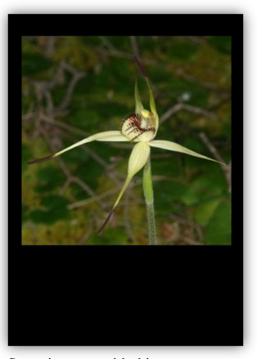
Sometimes, as with this Arachnorchis richardsiorum , the file cannot be made to fit an A4 ratio and a border is used.