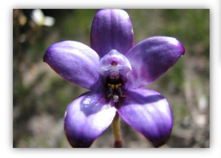
This Elythranthera brunonis , Purple Enamel Orchid from WA features a pixie with thigh boots – not readily seen with the naked eye but quite cute when enlarged to A4!