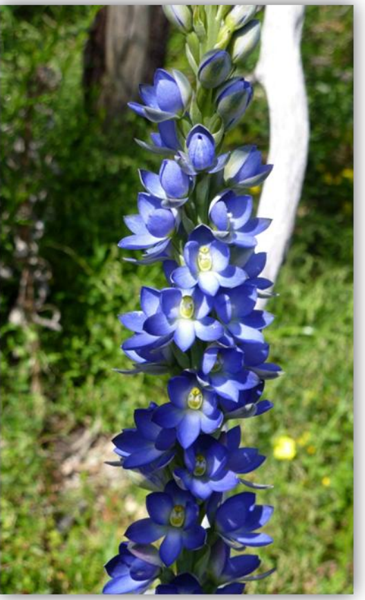
Opened – Next day