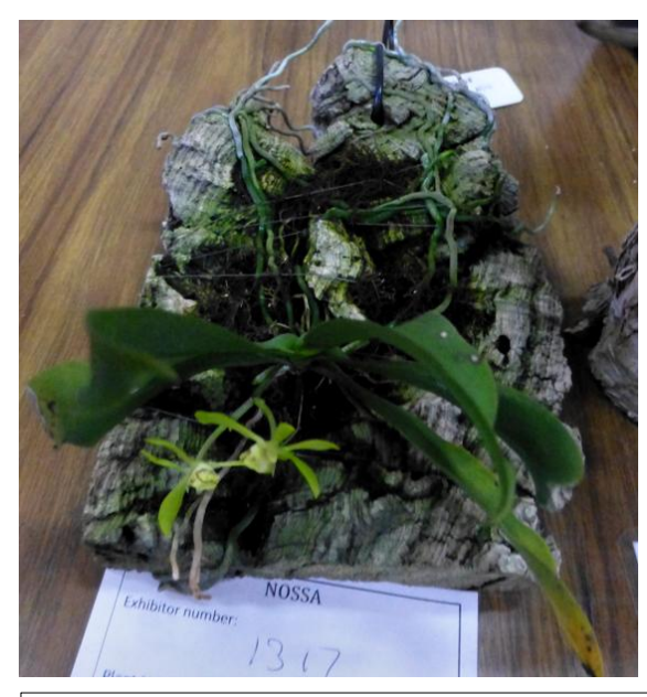
Above & Below Sarcochilus olivaceus