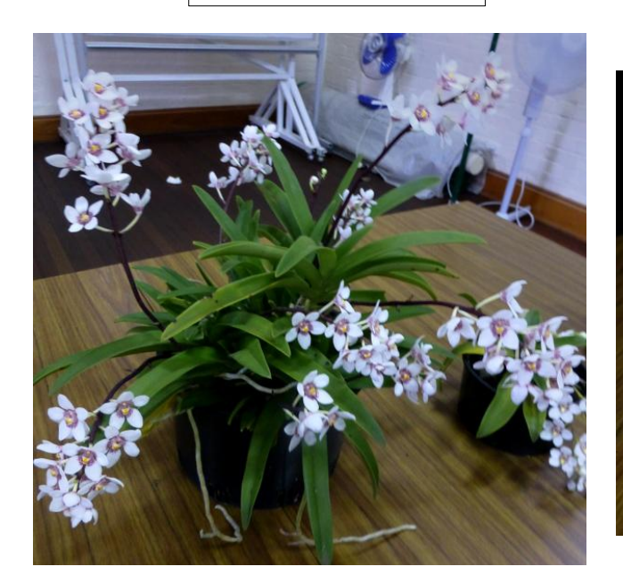
Sarcochilus Fitzhart Above & Below