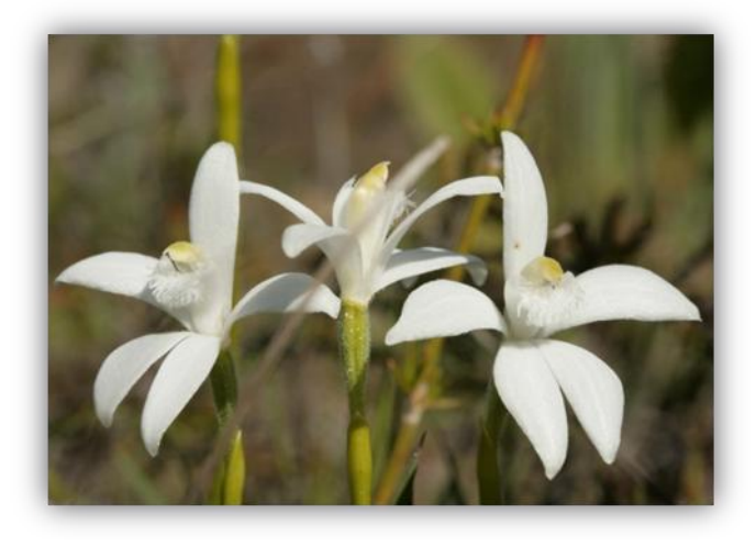
The three views of this white Pheladenia deformis allows us to view more features of the flower. The more information, the better it is for identification.