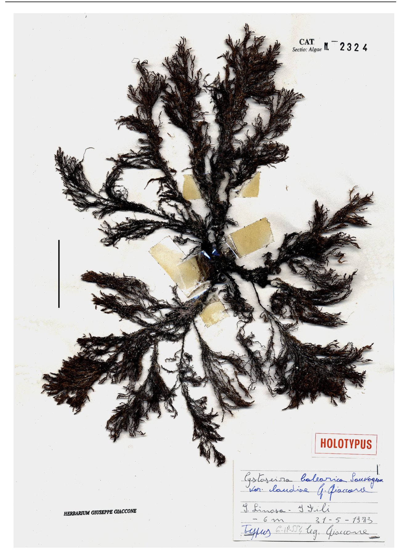
Fig. 1. Ericaria brachycarpa var. claudiae Giaccone ex Boudouresque, Perret-Boudouresque & Blanfuné, var. nov.. Holotype (CAT 2324). Bar = 5cm