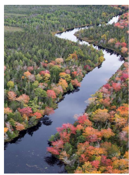
River corridors promote connectivity.

The main purpose in describing flows, and their relationship to the elements, is to provide insight into the role of each element. This will inform understanding of each element's contribution to overall landscape function.