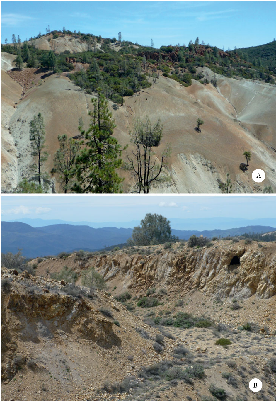
FIG. 4. Non-ultramafic rock types studied. A, silica-carbonate: Clear Creek Mine just below horizon (Site 5); B, shale and sandstone: San Carlos Peak Mine (Site 9).