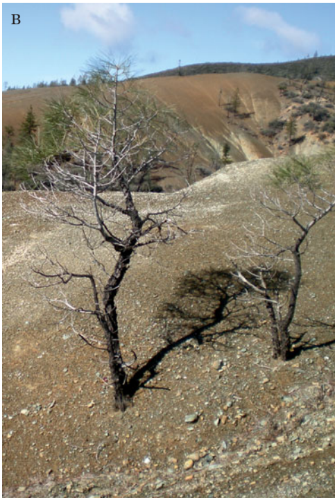
FIG. 2. A, general view of the New Idria serpentinite area, Site 5 (silica-carbonate rock) is just below horizon on the extreme right; B, close up of New Idria serpentinite mass near Site 5 (silica-carbonate rock) showing the generally fragmented nature of the substratum.