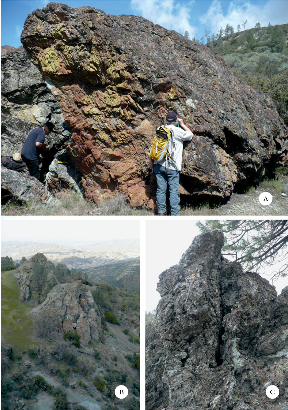
FIG. 3. Ultramafic outcrops. A, nephrite: large boulder at Staging Area (Site 1); B, serpentinite: over view of New Idria Reservoir (Site 6); C, serpentinite: close-up of a small part of San Benito Mountain Summit (Site 10).