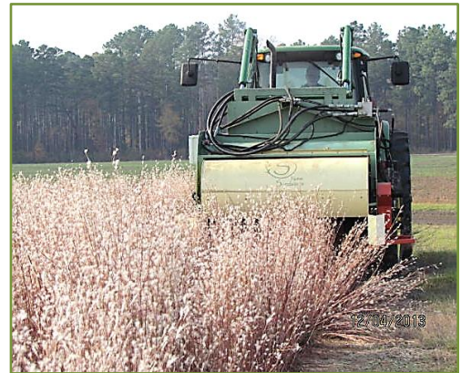
Harvesting fluffy seed of splitbeard bluestem with a flail harvester.