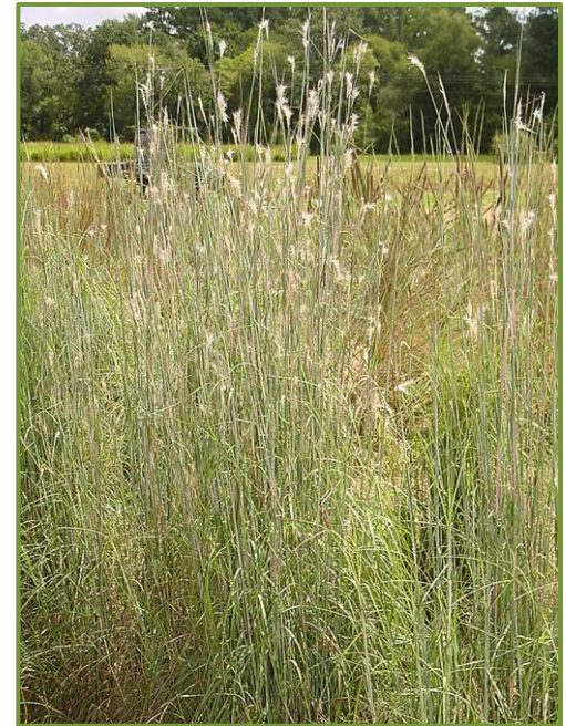
Splitbeard bluestem plant.