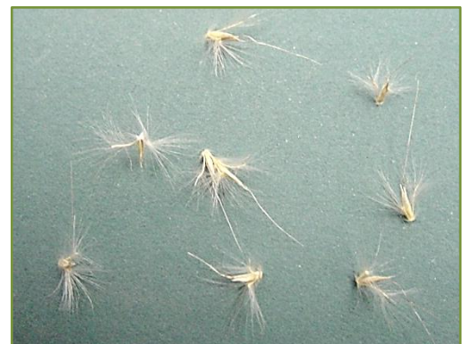
Splitbeard bluestem seeds.