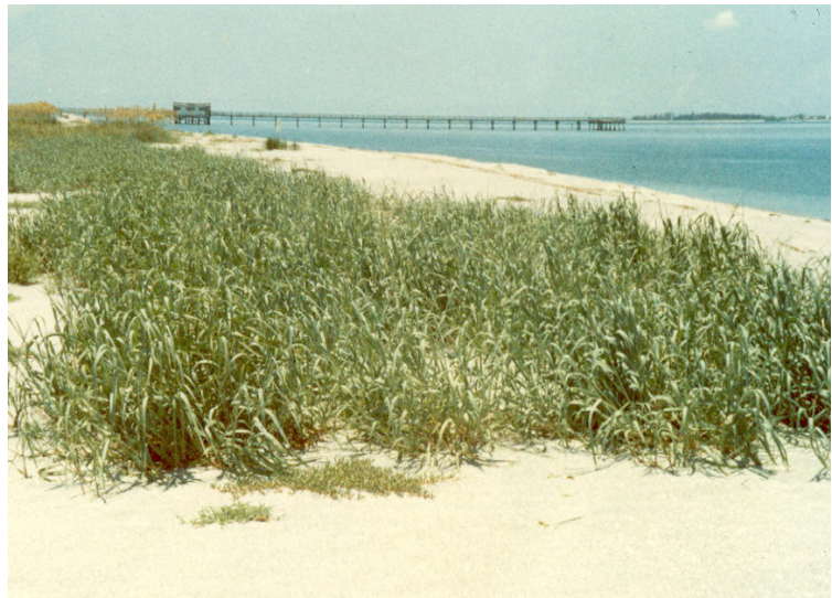
Figure 1: Natural bitter panicum stand on Florida coastline.

'Northpa' and 'Southpa' (pronounced "northpay" and "southpay") are two cultivars of bitter panicum ( Panicum amarum Elliott var. amarum ) released by the USDA NRCS Brooksville Plant Materials Center in 1992. Both are vegetatively propagated and spread by rhizomes or buried stem sections that root at the nodes.