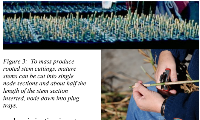
Figure 3: To mass produce rooted stem cuttings, mature stems can be cut into single node sections and about half the length of the stem section inserted, node down into plug trays.

Late winter or early spring is the best time to establish potted plants without irrigation. With irrigation, plants can be established anytime rooted planting material is available and freezing temperatures are not expected for at least 6 months. Unrooted stems cuttings can be buried end to end in trenches 4-6 inches deep and 2-3 feet apart leaving 6-10 inches of the stem top exposed. Additionally, unrooted stem cuttings can be planted three to a hole to a depth where at least ½ the stem is buried in staggered rows and 2-3 feet apart with holes 2 feet apart in each row. Transplant potted and bare root plants in staggered rows 2-3 feet apart with plants 2 feet apart in each row. Transplant these types of plants at a depth of 8-10 inches or deeper into moist soil, leaving 2-3 inches of leaf tissue above the soil surface. Production fields should be fertilized 3 to 4 weeks after planting based on soil test recommendations for low input warm season perennial grass. In lieu of a soil test, apply 200-300 pounds of 10-10-10 fertilizer. Applying fertilizer annually in early June and August encourages plant growth and fills gaps in the production field. Irrigation is beneficial until plants become well established. Restrict traffic of the production field during the establishment year.