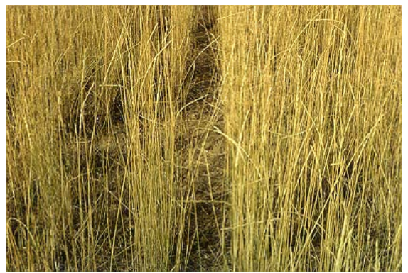
Intermediate wheatgrass, Dan Ogle, USDA-NRCS, Idaho

Eight inches of new growth should be attained in spring before grazing is allowed on established stands. A four-inch stubble height should be maintained following grazing or mowing and going into winter. In pasture tests, stands consistently out-yield other grass-legume mixtures. For this reason, stocking rates can be set higher than other grasses. Care should be taken to allow proper rest of at least 21 to 28 days between grazing periods under irrigated and high moisture situations.