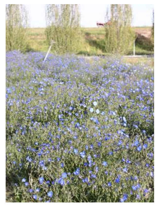
Figure 2. Test plots of 'Appar' blue flax ( Linum perenne ) .

Flax species do best on well-drained soils. Most ecotypes do well on infertile, disturbed soils. They have excellent cold winter and drought tolerance. They will tolerate weakly saline to weakly acidic sites. Plants are usually found in open areas, but will tolerate semi-shaded conditions. They are fire resistant due to leaves and stems staying green with relatively high moisture content during most of the fire season.