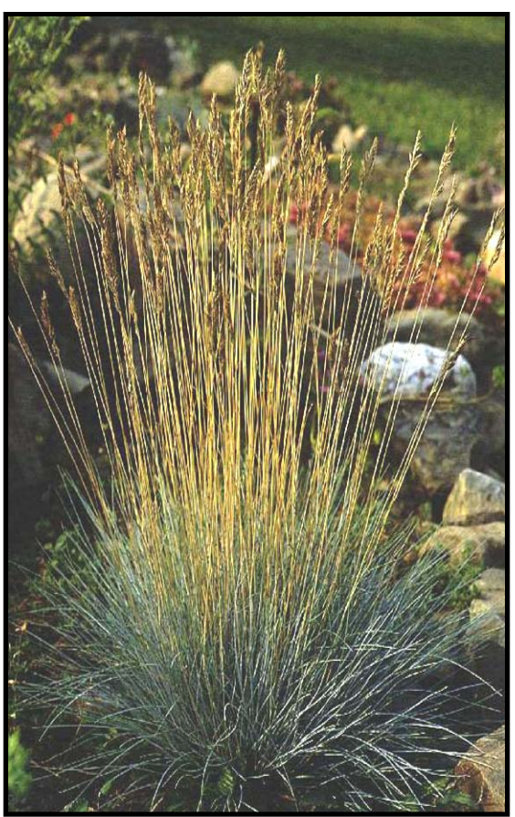
Figure 1. Sheep fescue in xeriscape garden.

Contributed By: USDA, NRCS, Idaho and Washington Plant Materials Staff and the National Plant Data Center