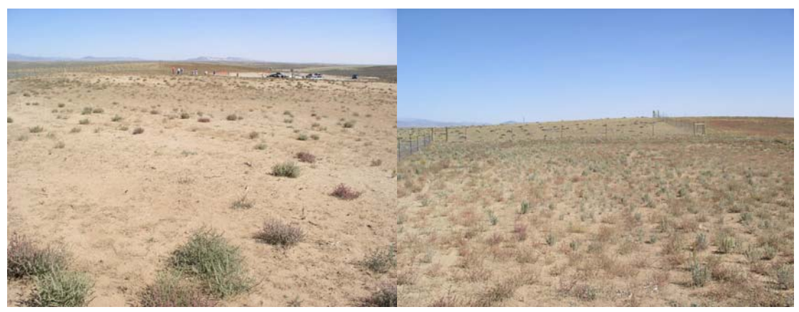
Shell drill-seeded plots 2007: Bridger mixture (left) and Shell mixture (right).

In 2007, in the 1-acre treatment with the Shell Mix, 60% of species in the mix was present in the sample area (table 8). The species, in order of most to least frequency, are fourwing saltbush (70%), Wyoming big sagebrush (50%), Rimrock Indian ricegrass (30%), Sandberg bluegrass and winterfat (20%), and Rydberg's penstemon (10%). The total number of plants in the treatment declined approximately 50% from the previous year. Overall vigor was moderately fair and plant height was approximately 3 inches. The remaining 40% of the species in the mix not present included fringed sagewort, native yarrow, scarlet globemallow, and silvery lupine.