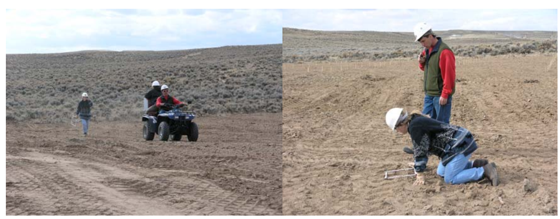
Shell broadcast-seeded plots, October 2005.

If stand failure is intermittent or limited to occasional species or replications, those completing the evaluation will recommend appropriate action. In all cases, weed control will be conducted on the entire plot area. The criteria for a site to be considered successful in reclamation for the chosen well-pad will be based on site stability, seeded species, and any additional criteria outlined in the PRACWA. If areas of bare ground larger than 30 ft² exist after the 5-year evaluation, or the site is considered unstable, replanting may be required.