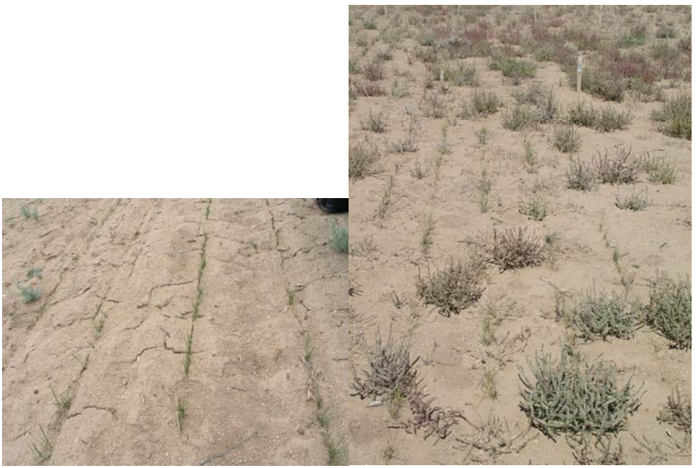
Shell replicated plots: Copperhead slender wheatgrass in 2006 (left) and 2007 (right).