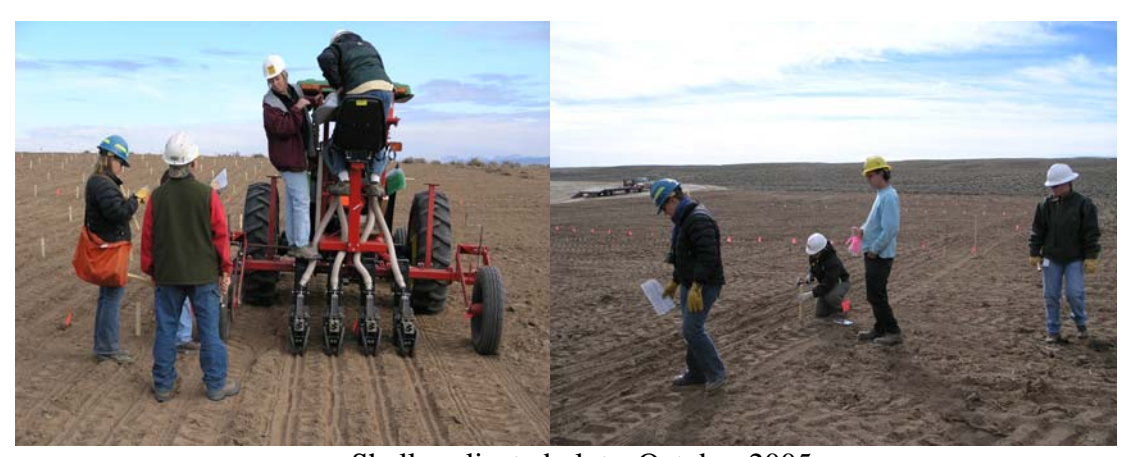
Shell replicated plots, October 2005

On October 10, 2006, a total of 116 plots were seeded with 29 shrub entries of 25 species in a randomized complete block design with four replications (table 6). Three, single-row belt seeders were used to plant shrub entries in 4-row plots, 8 ft wide by 20 ft long (160 ft²). The shrub seeding rate was dependent on seed size and ranged from 10 to 40 pure-live-seed per foot. Seeding depth ranged from nearly surficial to 1 inch, depending on seed size. Five bluebunch wheatgrass varieties were broadcast seeded as a small observation area on the east end of the study site. The 0.23-acre grass plots were planted at 40 pure-live-seeds/ft².