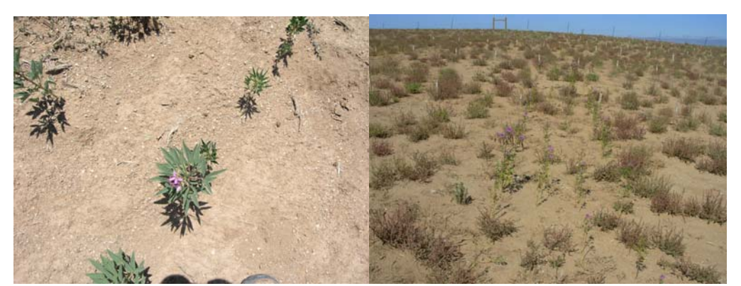
Shell replicated plots: Rocky Mountain beeplant in July 2006 and October 2007.