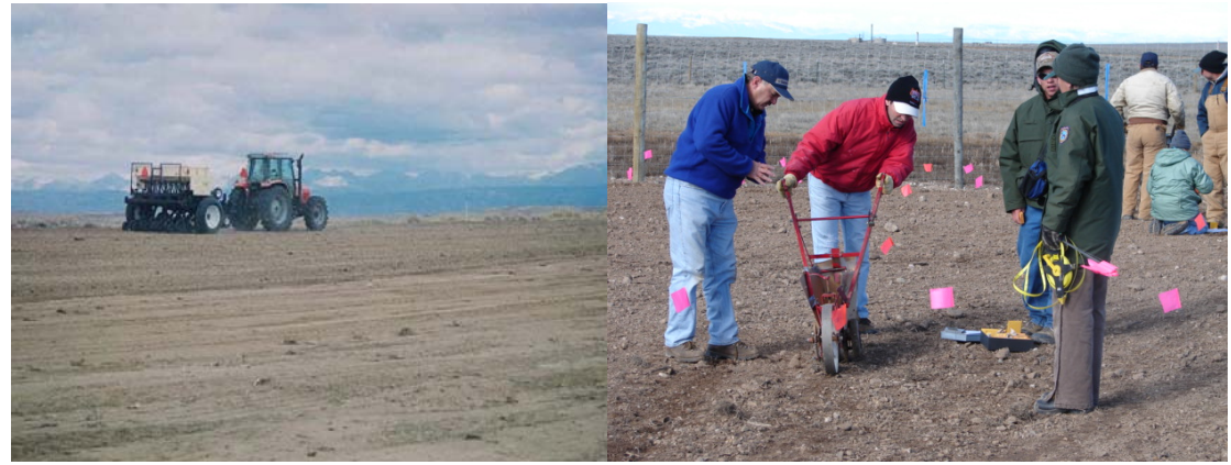
Shell drill-seeded plots, October 2005