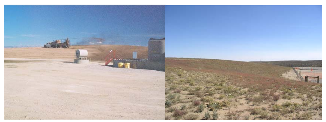
Shell hydro-seeding with Shell seed mixture: December 2005 (left) and October 2007 (right).

The natural terrain of the site is rolling and the percentage slope mostly ranges from less than 1 to 8, with up to 12% slope in portions of the hydro-seeded treatment. In the steeper gradients, plots were tracked with minor rills where water moved downhill. Minor soil movement due to wind erosion was evident in small accumulations adjacent to the fence and in low lying areas.