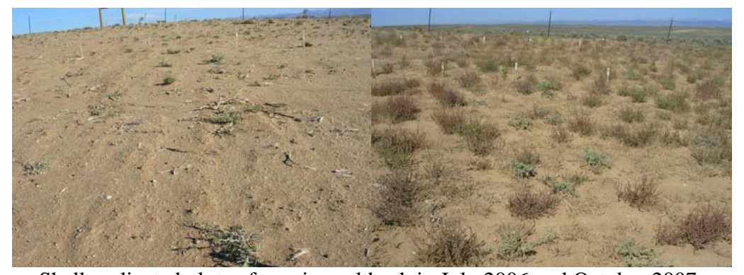
Shell replicated plots: fourwing saltbush in July 2006 and October 2007.