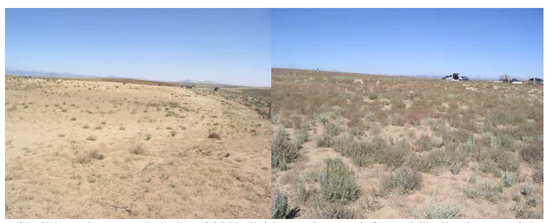
Shell broadcast-seeded plots 2007: Bridger mixture (left) and Shell mixture (right).

<u>Hydro-Seeded.</u> In 2006, 33% of the species mix was present in the sample area of the 1-acre treatment with the Shell mix (table 11). The species, in order of most to least frequency, were winterfat (10%), and Sandberg bluegrass and Wyoming big sagebrush (5%). Overall vigor was average and plant height was approximately 2 inches. Fourwing saltbush, Rimrock Indian ricegrass, and silvery lupine were found outside the sampled plots at very low estimates of percentage basal cover. Fringed sagewort, Rydberg's penstemon, scarlet globemallow, and the native yarrow were not present. Due to the poor establishment, the area was hydro-seeded again in October 2006.