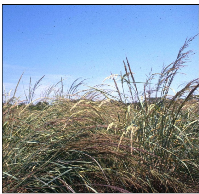
'Atlantic' coastal panicgrass (Panicum amarum Ell. var. amarulum) is a cultivar released in 1981.