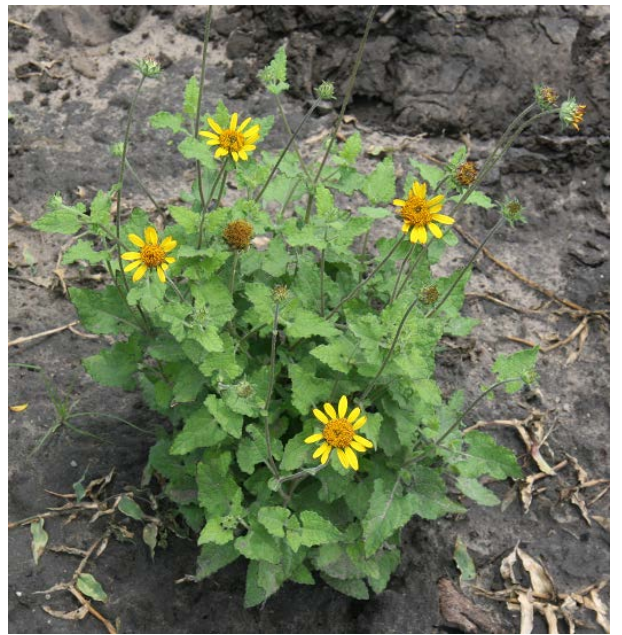
VenadoGermplasm awnless bushsunflower.

A Conservation Plant Release by USDA NRCS E. "Kika" de la Garza Plant Materials Center, Kingsville, TX