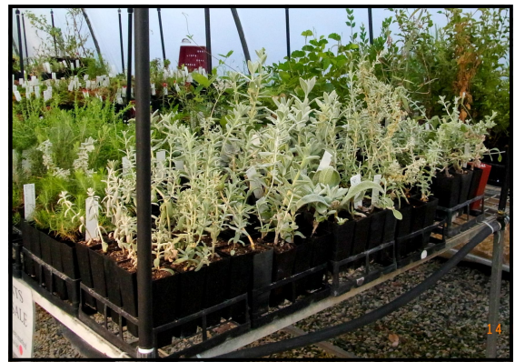
The white felty foliage of Dicrastylis species makes a great architectural contrast