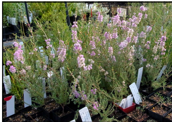
Our great range of Verticordias includes this delightful V. halophila , which flowers right through summer.