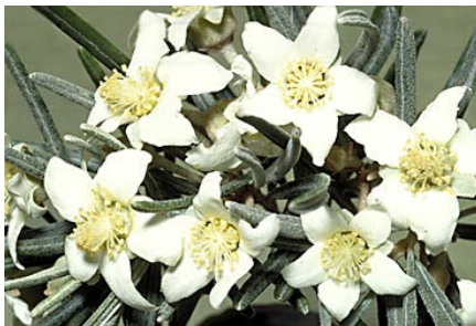
Caption: Female (above) and male flowers (below)