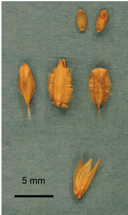
Fig. 1. Mature 'seeds' of Cockatoo Grass ( Alloteropsis semialata ) showing the intact spikelets (middle) and the actual seeds (caryopses) after extraction from the covering structures (top). The bottom spikelet has been opened to remove the caryopsis and the remains of the outer glumes and the inner lemmas covering the two florets can be seen. Opening or cutting the spikelet to check for a filled caryopsis is an easy initial test for checking the proportion of spikelets that contain viable seeds.

as a bare caryopsis or enclosed within the floret. Seed lots of native grasses generally contain florets, other inflorescence material such as the stigma and stamens (Fig. 2), and sometimes vegetative material, as well as the caryopses (Fig. 3). There may be a low proportion of viable seeds in a seed lot if the seed lot contains a high proportion of vegetative material, a high proportion of empty florets, or a high proportion of damaged or dead caryopses. A simple indicator of poor seed fill is to lightly press on the sides of the florets to feel the caryopsis. Alternatively, the floret