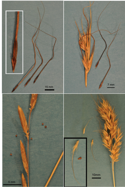
Fig. 3. Seeds and associated structures of Giant Speargrass ( Heteropogon triticens ) (top left), Kangaroo Grass ( Themeda triandra ) (top right), Love Grass ( Eragrostis spartinooides ) (bottom left) and Wanderrie grass ( Eriachne schultzeiana ) (bottom right). The small brown seeds or caryopses extracted from the covering structures are shown for Love Grass and Wanderrie Grass.

Seeds were mainly supplied by Greening Australia NT and by Kakadu Native Plant Supplies, with a list of desired species sent to their collectors. Seeds were collected in the Jabiru, Darwin and Katherine regions. Four seed lots ( Alloteropsis semialata Lot 3; Eriachne ciliata Lot 3, Eriachne schultzeiana Lot 2 and Thaumastochloa major Lot 1) were collected with assistance from Charles Darwin University (CDU) staff and/or students. Seeds were collected between April 2005 and May 2011. The date or month of collection provided by the seed collector or seed supply company and the date of testing were recorded.