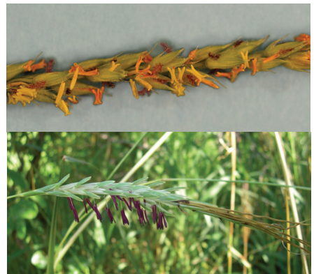
Fig. 2. Cockatoo Grass ( Alloteropsis semialata ) (above) and Giant Spear Grass ( Heteropogon triticeus ) (below) flowering. The Cockatoo Grass flowers have orange and yellow stamens and purple feather-like stigmas. The Giant Spear Grass has purple stamens and long brown awns protrude from the apex of the inflorescence.