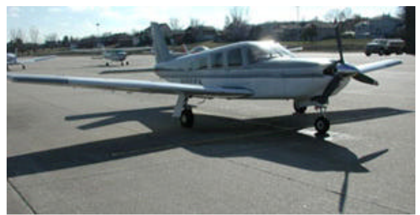
Airborne Remote Sensing Facility Development (ARS)

The primary focus of Airborne Remote Sensing for Agricultural Research and Commercialization Applications will be remote sensing of crop-land agriculture, with an emphasis on defining more clearly the ways in which remote sensing can contribute to the newly developing field known as "precision agriculture." Since remote sensing technology is poised to enter the commercial market during the new millennium, the advantage of such a facility will not only benefit the conduct of high-quality research but also help spawn spin-off companies designing novel low-cost airborne sensor systems.