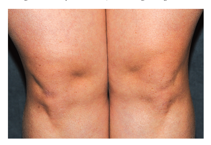
FIGURE 3. Several scattered small dark brown macules on both knees.

several hypotheses on the pathogenesis of vitiligo, including the autoimmune, neurohormonal, and autocytotoxic theories (Alikhan, Felsten, Daly, & Petronic-Rosic, 2011). The strongest evidence supports the autoimmune hypothesis of altered cellular immune response (Ongenae, Van Geel, & Naeyaert, 2003). Vitiligo presents with sharply demarcated depigmented macules and patches (Figure 5). It commonly affects the face, axillae, nipples, umbilicus, dorsal aspect of the hands, elbows, knees, digits, flexor wrists, sacrum, groin, and anogenital area. Trauma to unaffected skin might result in the development of new lesions, a phenomenon called koebnerization (Alikhan et al., 2011). Spontaneous repigmentation of vitiliginous patches is uncommon (seen in 10%-20% of patients) but can occur (Castanet & Ortonne, 1997; Yaghoobi, Omidian, & Bagherani, 2011). Repigmentation usually occurs in a perifollicular pattern, suggesting that the hair follicle functions as a reservoir for melanocytes (Castanet & Ortonne, 1997). On the basis of the general morphological pattern of the individual patches, vitiligo is broadly divided into two categories: segmental and nonsegmental (Taieb & Picardo, 2007). Segmental vitiligo is usually unilateral, occurring along a derma-