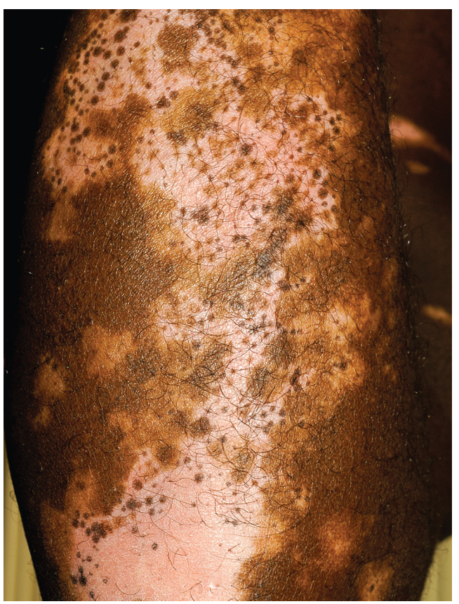
FIGURE 5. Vitiligo. Large depigmented patch with multiple areas of perifollicular repigmentation.

tome. Nonsegmental vitiligo is more common, generally has a symmetric distribution, and is more likely to be progressive. When vitiligo is classified according to the distribution of lesions, there are three types (Table 1): localized, generalized, and universal (Alikhan et al., 2011). Localized vitiligo is further subdivided into focal, segmental, and mucosal. Generalized vitiligo is classified into acrofacial, vulgaris, and mixed. Universal vitiligo affects more than 80% of body surface area. The diagnosis of vitiligo is usually made on clinical grounds based on the