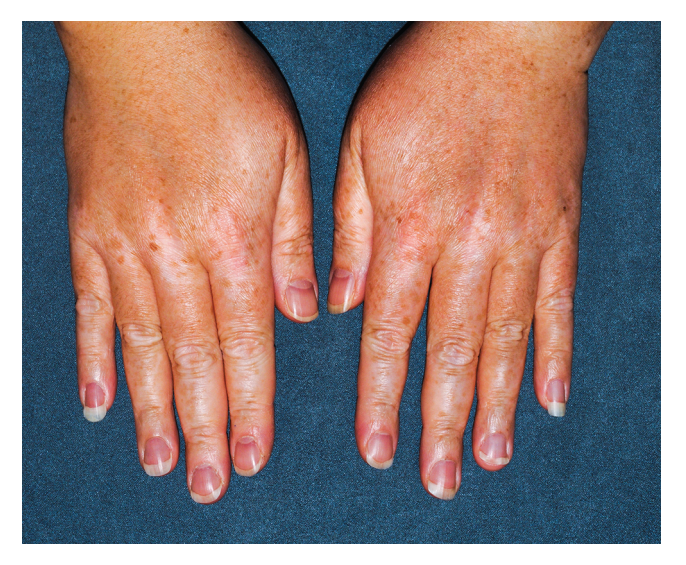
FIGURE 1. A combination of hyper- and hypopigmented macules involving the dorsal hands.

Vitiligo is a chronic acquired disease characterized by well-defined white, depigmented macules and patches affecting the skin and mucous membranes. Mucocutaneous lesions develop secondary to selective autoimmune destruction of melanocytes. Vitiligo may appear at any age with an estimated worldwide prevalence of 0.5%–1% (Taieb & Picardo, 2007) and is the most common skin disorder causing light-colored skin. The etiology of vitiligo is largely unknown but is likely thought to be multifactorial. A family history of vitiligo is positive in up to 20% of cases (Alkhateeb, Fain, Thody, Bennett, & Spritz, 2003; Nath, Majumder, & Nordlund, 1994). There are