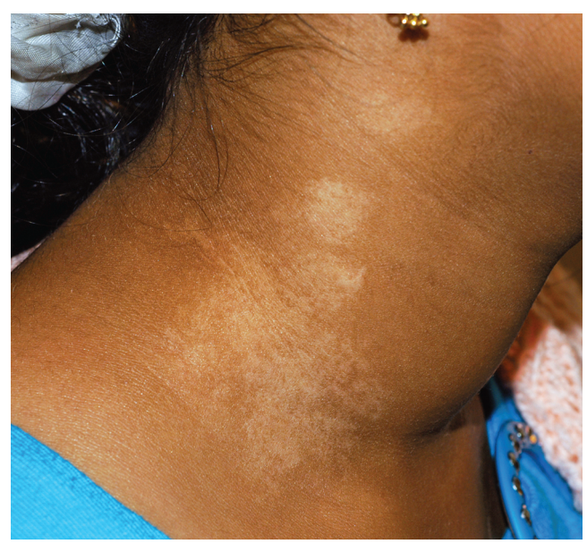
FIGURE 6. Nevus depigmentosus. An irregular hypopigmented patch involving the neck.

Nevus depigmentosus (ND) usually presents at birth as a hypopigmented macule or patch and remains stable throughout life. Some cases of ND develop later in life; however, approximately 74% of cases develop lesions before the age of 3 years. The lesions may have an irregular border and can be solitary or clustered (Figure 6). The trunk is the most commonly involved site, but the face, neck, and extremities can also be affected (Xu, Huang, Li, Wang, & Shen, 2008). Nevus depigmentosus has no familial tendency and usually occurs sporadically in families. The etiology of ND is unknown. However, it has been reported to be because of a defect in the transfer of melanosomes from melanocytes to keratinocytes (Kim, Kang, Lee, & Kim, 2006). Distinguishing ND from vitiligo is difficult. Clinicopathological features that favor the diagnosis of ND over vitiligo include early age of onset, stability throughout life, macules that are hypopigmented rather than depigmented, an off-white rather than a chalky white accentuation under Wood's light, and decreased melanin with normal melanocyte numbers on biopsy (Kim et al., 2006; Xu et al., 2008). Hypomelanotic macules similar to ND are seen in 97% of patients with tuberous sclerosis (TS). Tuberous sclerosis is an autosomal dominant neurocutaneous syndrome characterized by the development of tumors in several body organs. The ovoid