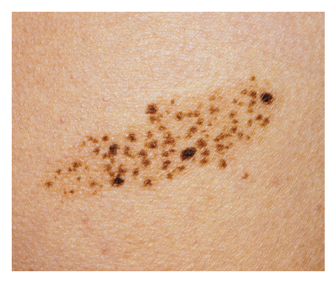
FIGURE 8. Nevus spilus. A well-demarcated light brown patch studded with multiple dark brown macules and papules.

This patient's skin condition represents acropigmentation of Dohi (APD). Acropigmentation of Dohi (also known as