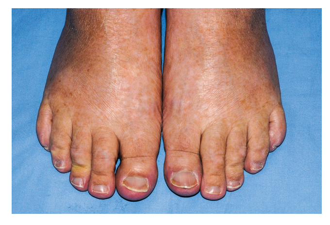
FIGURE 2. A combination of hyper- and hypopigmented macules involving the dorsal feet.

several hypotheses on the pathogenesis of vitiligo, including the autoimmune, neurohormonal, and autocytotoxic theories (Alikhan, Felsten, Daly, & Petronic-Rosic, 2011). The strongest evidence supports the autoimmune hypothesis of altered cellular immune response (Ongenae, Van Geel, & Naeyaert, 2003). Vitiligo presents with sharply demarcated depigmented macules and patches (Figure 5). It commonly affects the face, axillae, nipples, umbilicus, dorsal aspect of the hands, elbows, knees, digits, flexor wrists, sacrum, groin, and anogenital area. Trauma to unaffected skin might result in the development of new lesions, a phenomenon called koebnerization (Alikhan et al., 2011). Spontaneous repigmentation of vitiliginous patches is uncommon (seen in 10%-20% of patients) but can occur (Castanet & Ortonne, 1997; Yaghoobi, Omidian, & Bagherani, 2011). Repigmentation usually occurs in a perifollicular pattern, suggesting that the hair follicle functions as a reservoir for melanocytes (Castanet & Ortonne, 1997). On the basis of the general morphological pattern of the individual patches, vitiligo is broadly divided into two categories: segmental and nonsegmental (Taieb & Picardo, 2007). Segmental vitiligo is usually unilateral, occurring along a derma-