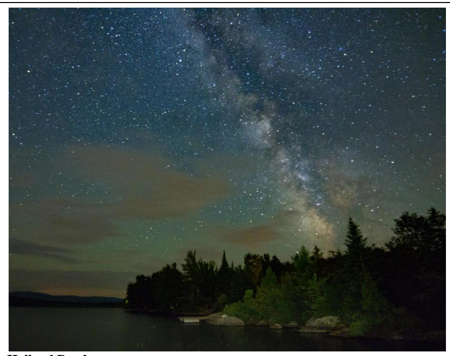
Holland Pond

There are numerous natural areas and scenic features throughout the Town, including the Bill Sladyk Wildlife Management Area containing 4,655 acres along the eastern end of Town, managed by the Vermont Fish and Wildlife Department. The WMA is currently without a Management Plan and will be receiving one in the coming years, at that time the State will be reaching out to the Town. The State wants the Town involved with their Land Management Plan, to ensure the local voice is heard when and if the state decides to undertake any potential changes to the WMA, though at this time there are no plans for any significant changes to the WMA. The