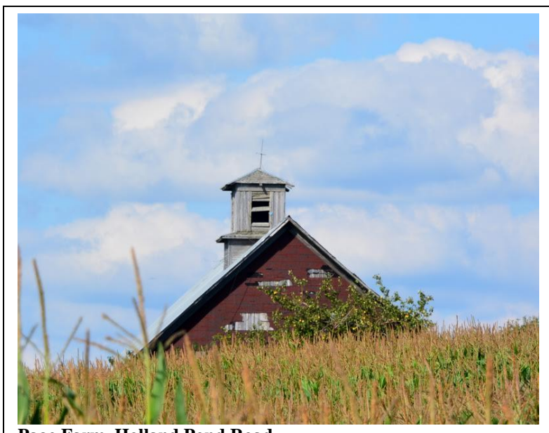
Page Farm, Holland Pond Road

According to the State of Vermont Department of Taxes Annual Report based on 2015 Grand List data, a total of 74 parcels comprising 10,072 acres in Holland were enrolled in the Use Value Appraisal Program (Current Use). 5,732 acres of this total was enrolled as forest and 4,290 acres were enrolled as agricultural land. The Town's 2016 Grand List indicates enrollment has increased. The Use Value Appraisal program allows landowners with enrolled acreage to pay property taxes based on the use value rather than the fair market value. Enrolled farm buildings are completely exempt from property taxes. In exchange, the landowner has to keep the property in agricultural or forest production. The municipalities receive an annual payment from the State called the "hold harmless payment" to make up the difference between the municipal taxes paid at use value and municipal taxes that are based on the assessed fair market value. The State Current Use Advisory Board establishes "use values" every year. In 2015, the use value for agriculture land was set at $289 an acre, and forest land was valued at $131 per acre (forest land