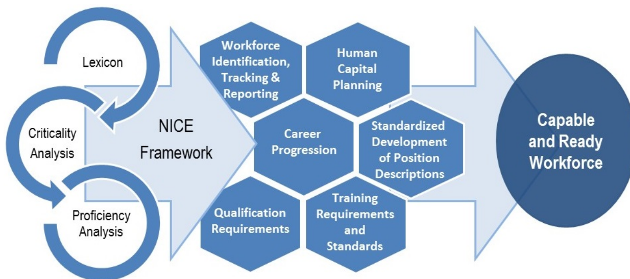
Figure 2 - Building Blocks for a Capable and Ready Cybersecurity Workforce

Figure 2 illustrates how the NICE Framework is a central reference to help employers build a capable and ready cybersecurity workforce.