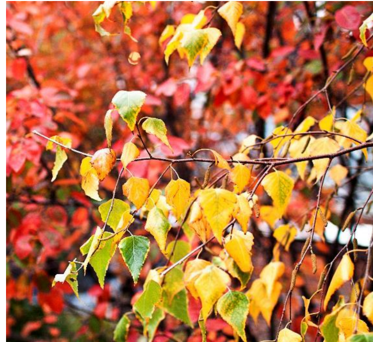
Grey Birch.