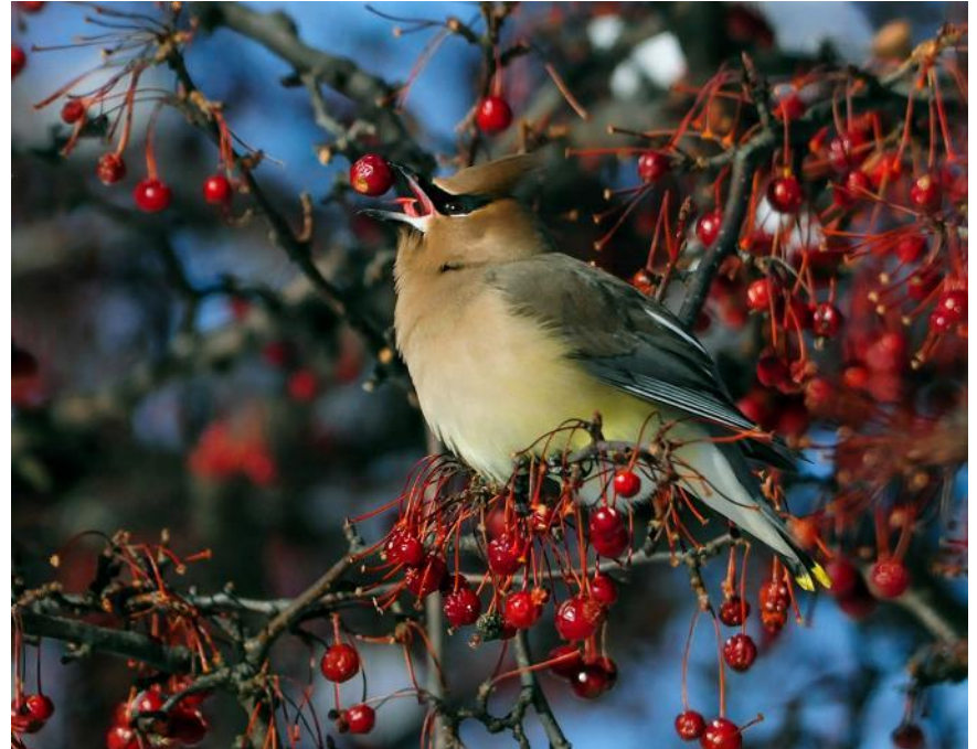
Cedar Waxwing with berries.