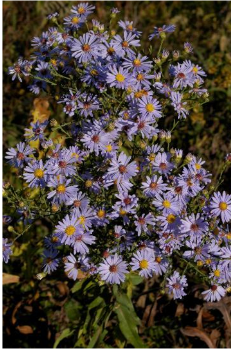
Smooth Aster.