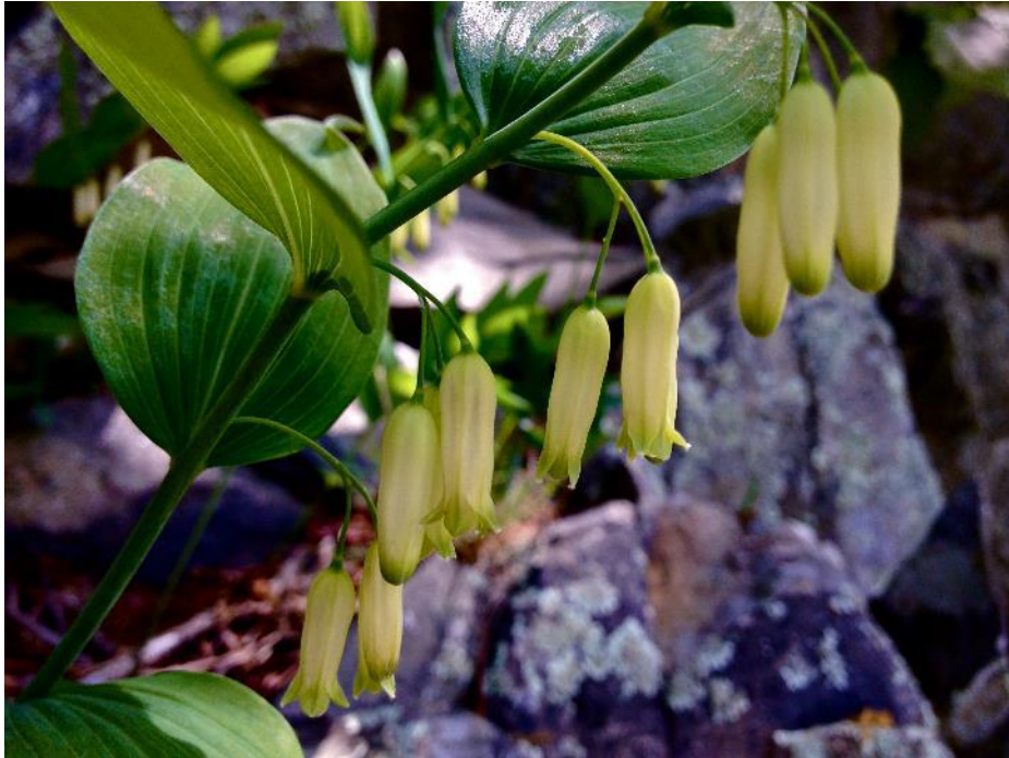
Solomon's seal.

Part shade/Shade. Dry to moist soils. 1-5 ft long stalks, 18" tall. Showy blue fruits in fall. Deer resistant