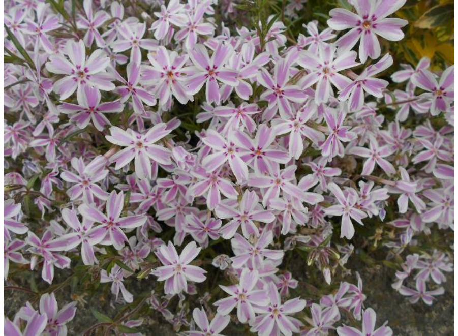
Candy Stripe.