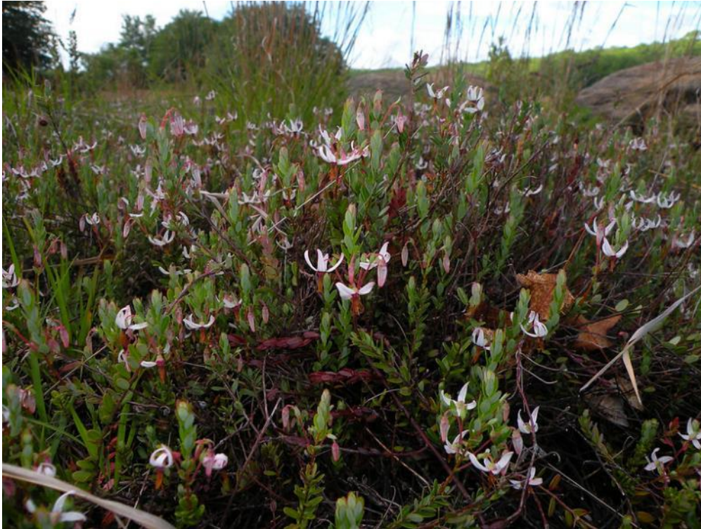
Flowering plant.

Full sun. May – Jun. pink blooms. 6" tall. Evergreen groundcover. Cranberries in the fall.