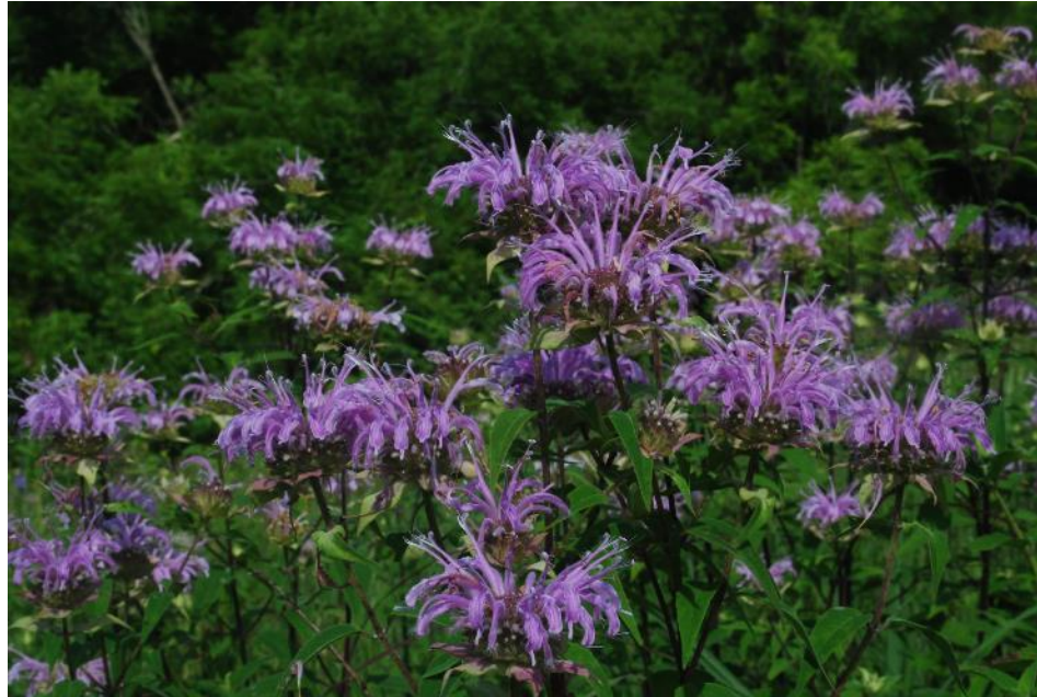
Monardo fistulosa.

Sun/Part shade. Average to moist soil. 3 – 4 ft tall. Purple flowers bloom Jun-Sep. Mildew resistant, deer resistant. Attracts pollinators.