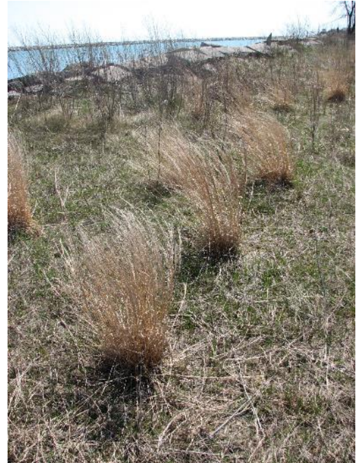
Little Bluestem.