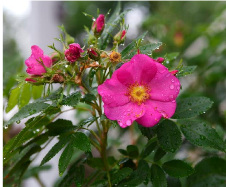
Rosa virginiana.