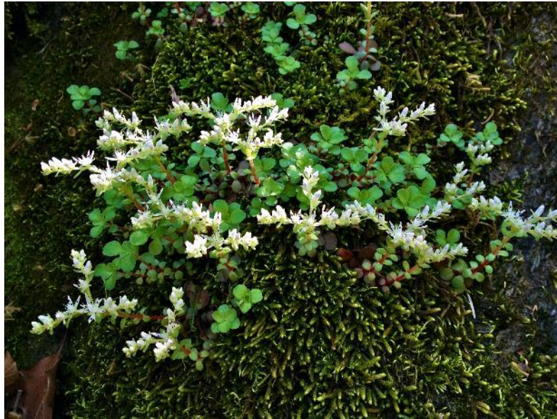
Sedum ternatum .

Part shade. 4-8 in tall. Moist soils. Loves rocks. Showy white flowers, creeping habit.