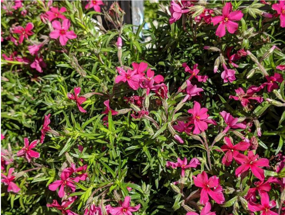
Red Wings.

Sun. Moist soil. Dark red flowers, attracts pollinators. Deer resistant.