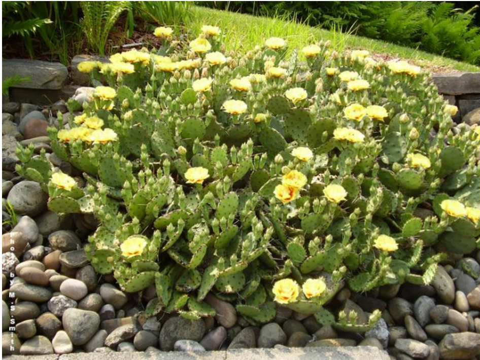
Opuntia humifusa .

Full sun. Jun-Jul. yellow blooms. 4-8" tall. Edible fruit. Drought & salt tolerant, deer resistant.