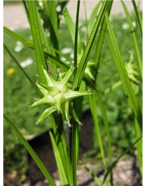
Mace Sedge.