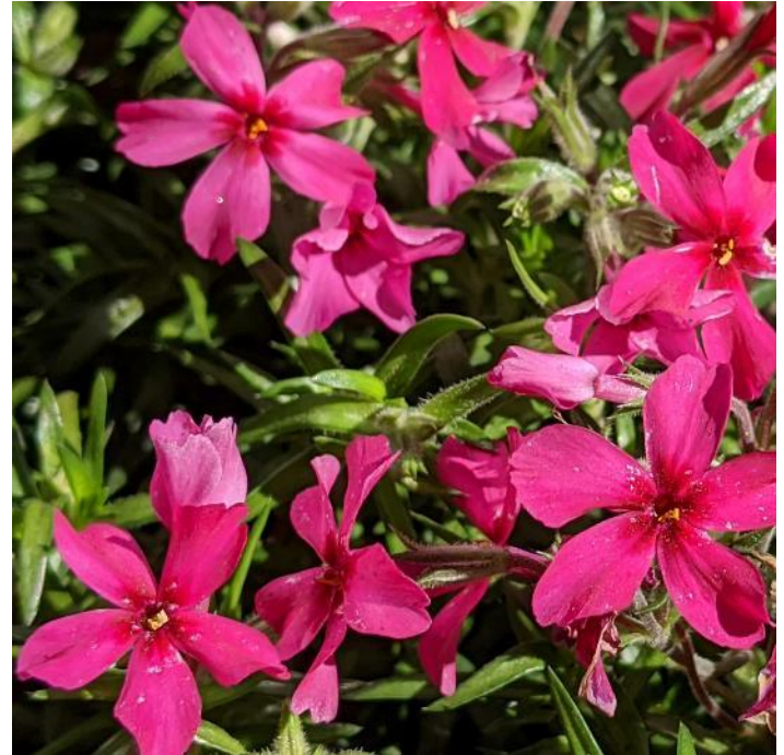
Red Wings.