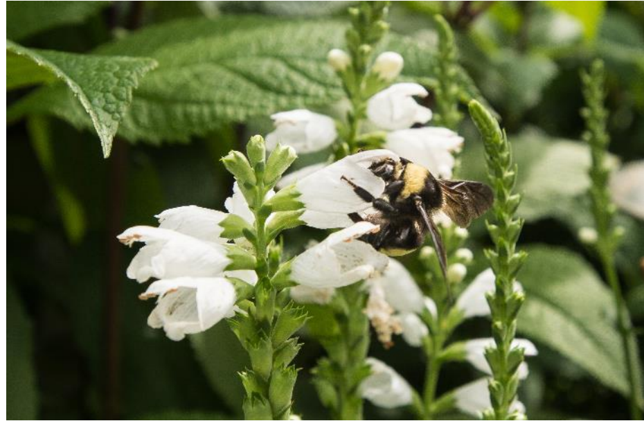
Chelone glabra with bee.