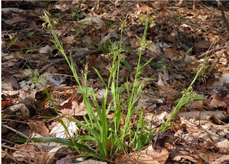
Full plant.

Part shade, shade. Apr.-May bloom, flowers 20" tall. Semi-evergreen. Height: 6-12". Dense tufts, spreading groundcover.