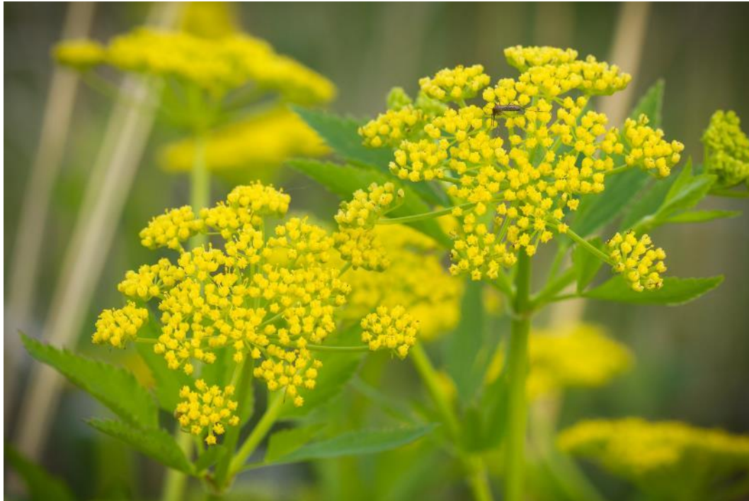
Golden alexanders.

Sun/Part shade/Shade. 1-2 ft tall. Yellow flowers April-June. Attracts beneficial insects.