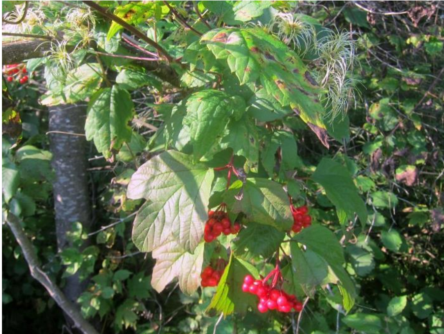
Leaves and berries.

Part shade. Moist to wet soils. 8-12 ft tall shrub. White flowers in spring, red berries in the fall attract birds. Red, yellow, purple fall colors.