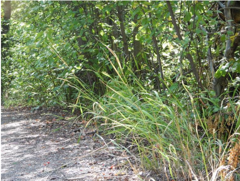
Elymus virginicus .

Full sun/part shade, bright green foliage, height: 2-4ft. Deer resistant. Erosion control.