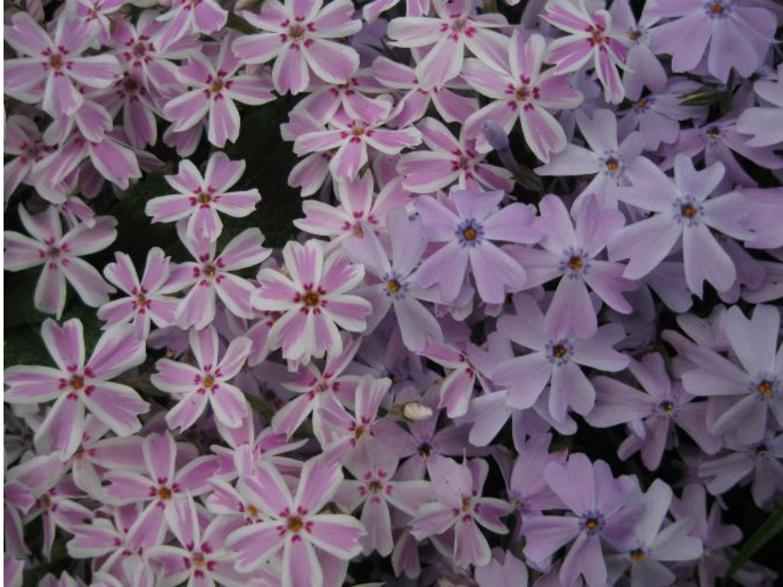
Candy Stripe (left).

Sun. Moist soil. 4-6". White flowers with bold pink stripe, May-Jun. Deer resistant.