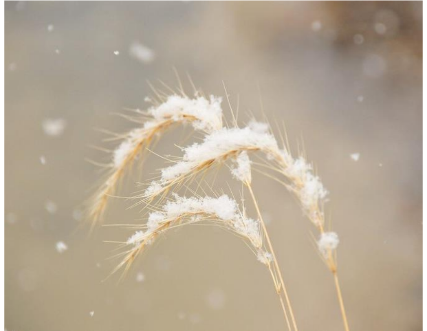
Seed heads in winter.