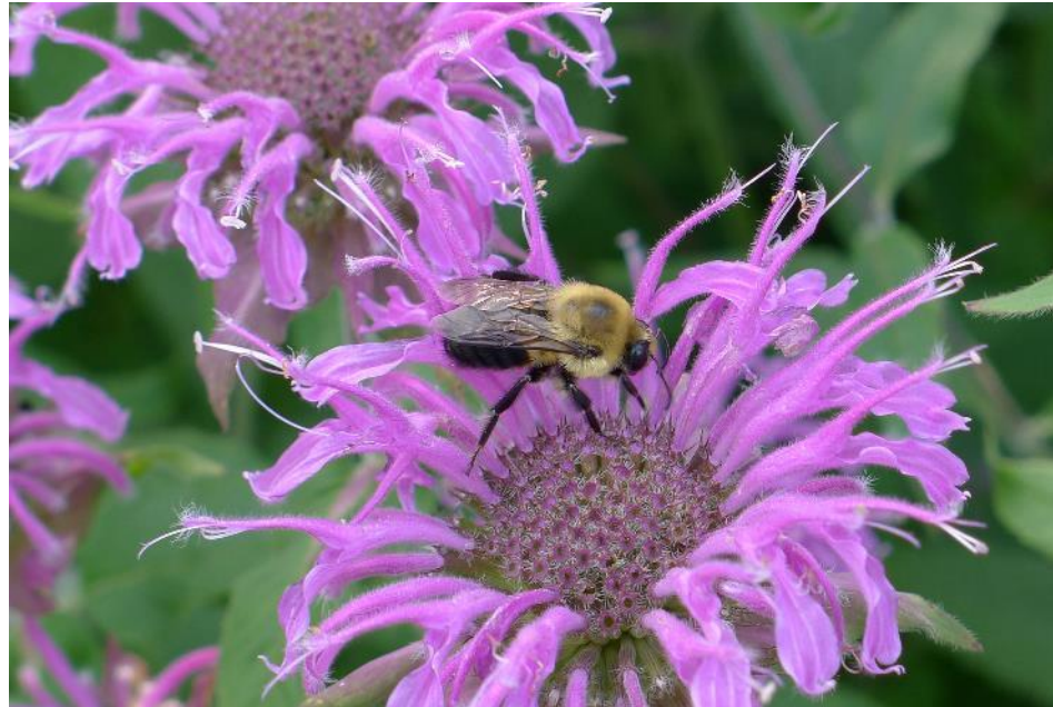
Monarda fistulosa and bee.