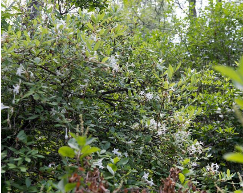
Swamp Rhododendron

Part shade. 12 ft width, up to 5 ft tall. Moist soil tolerant. White flowers with sweet, spicy fragrance, Jun-Jul. Deciduous shrub.