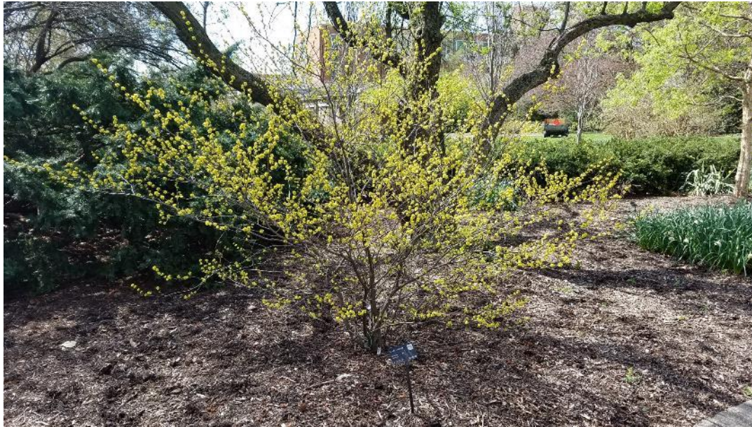
Spicebush flowers.

Shrub growing up to 15 ft tall. Sweetly fragrant yellow flowers in April, yellow-gold fall foliage, red berries. Attracts pollinators, deer resistant.