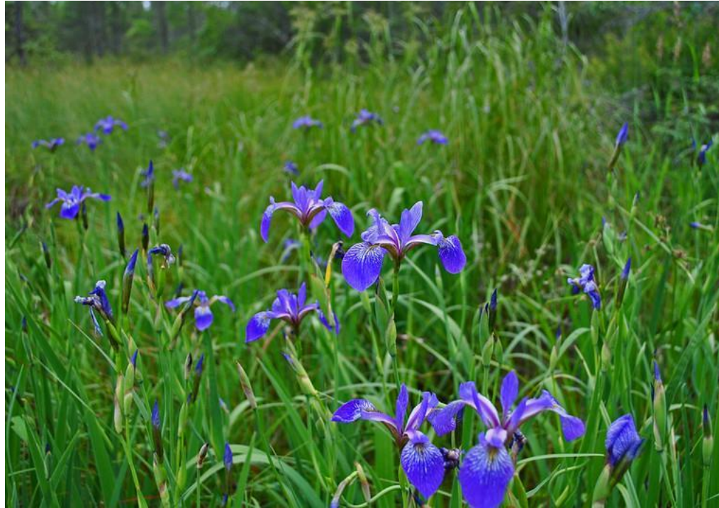
Blue Flag.