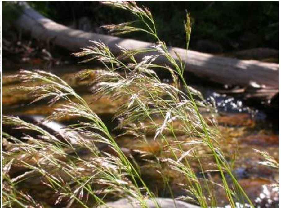
Seed heads.