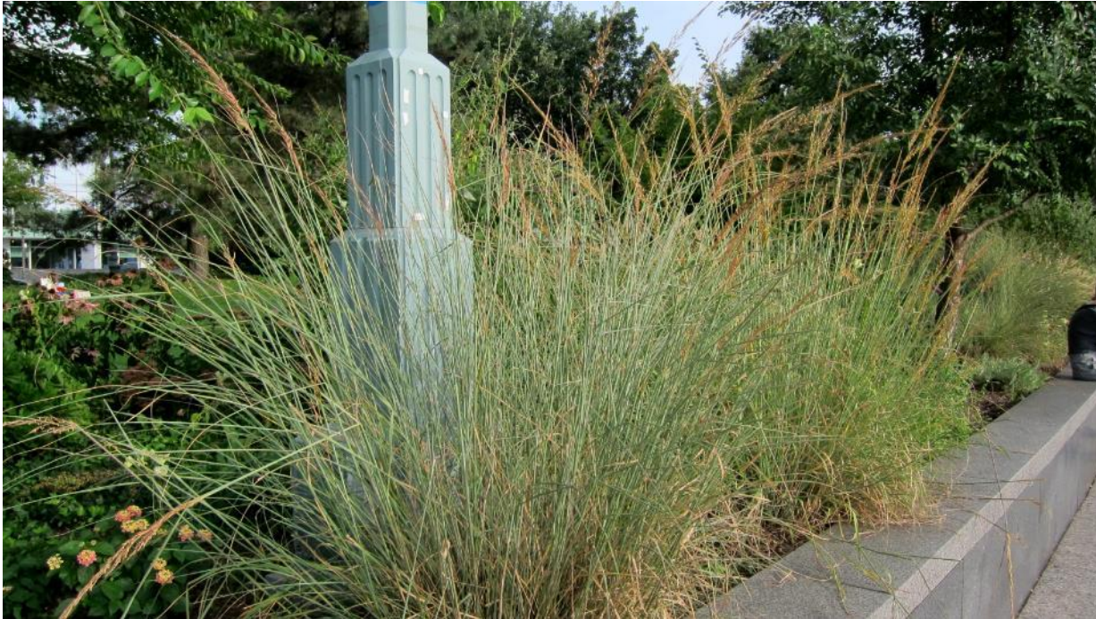
Indian Grass.

Sun/Part shade/Shade. 4-5 ft tall. Clump forming. Copper flowers, Aug. Drought tolerant, deer resistant.