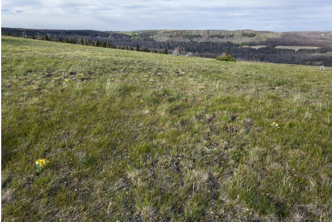
Rosy Sedge among other plants.

Part shade, shade. Height: 12". Semi-evergreen. Drought tolerant. Deer resistant.