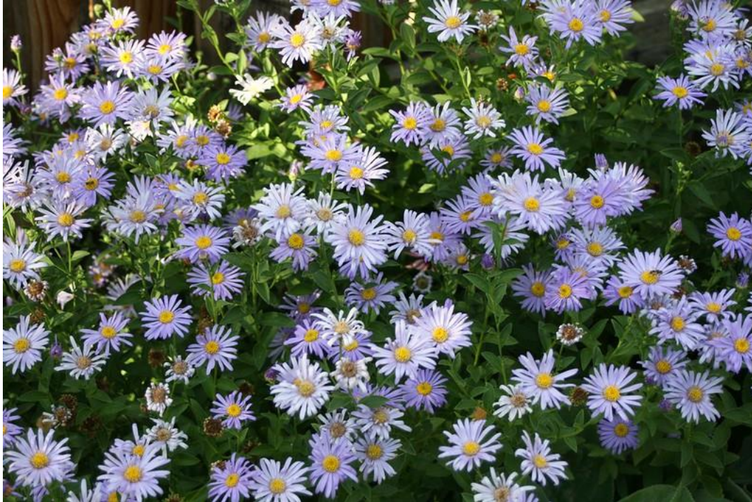
New York Aster.

Full sun, Sept.- Oct. Bloom, height: 2-3ft., Blue, purple, rose, or white flowers. Salt tolerant.