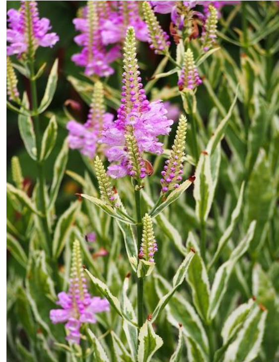
Obedient Plant.