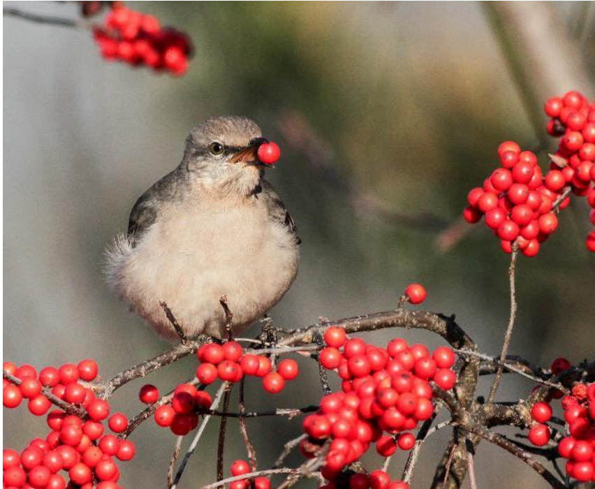
Northern Mockingbird.

Full sun/part shade, June-July boom, water: medium to wet, attracts birds