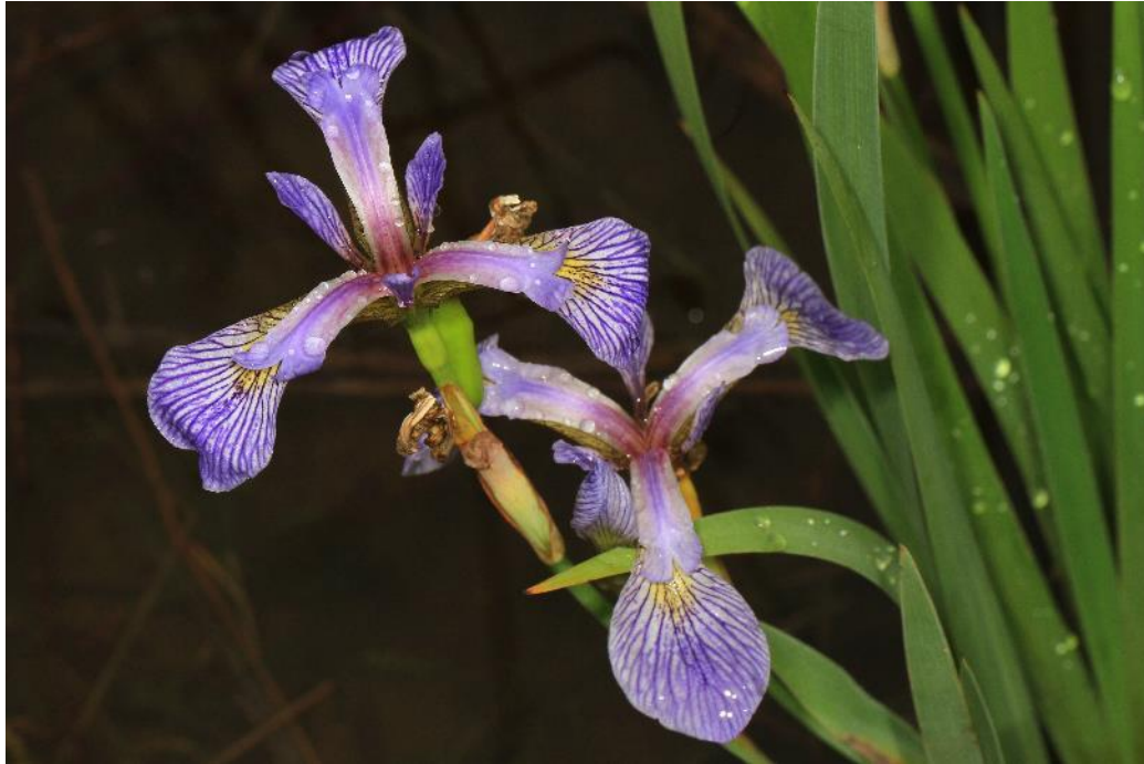
Slender Blue Iris.

Part shade, May-July bloom, height: 1-3ft., water: moist, thin, grass-like leaves rise from a basal cluster, attracts birds,