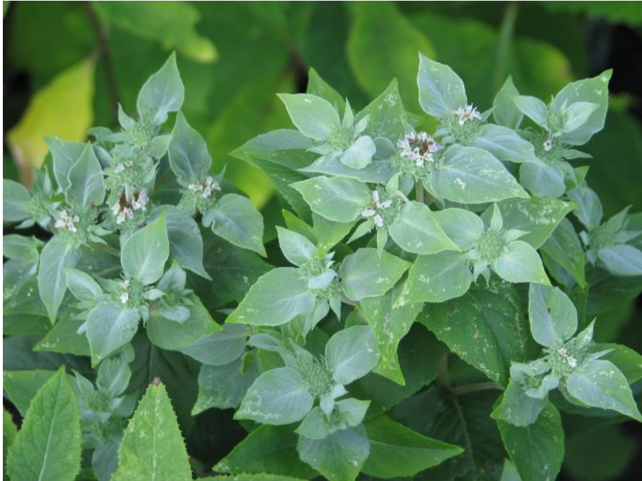
Mountain mint.

2 ft tall. Mint fragrance. White flowers Jul-Sep. Deer resistant. Attracts pollinators.