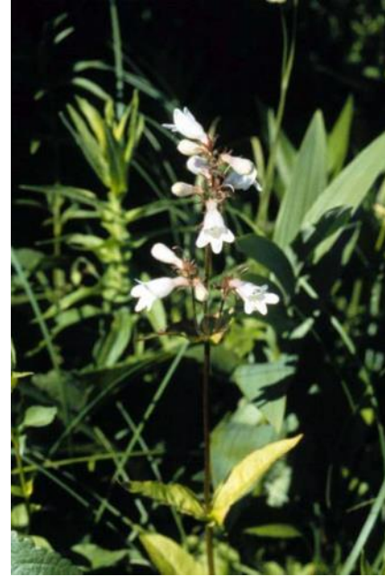
Full plant.