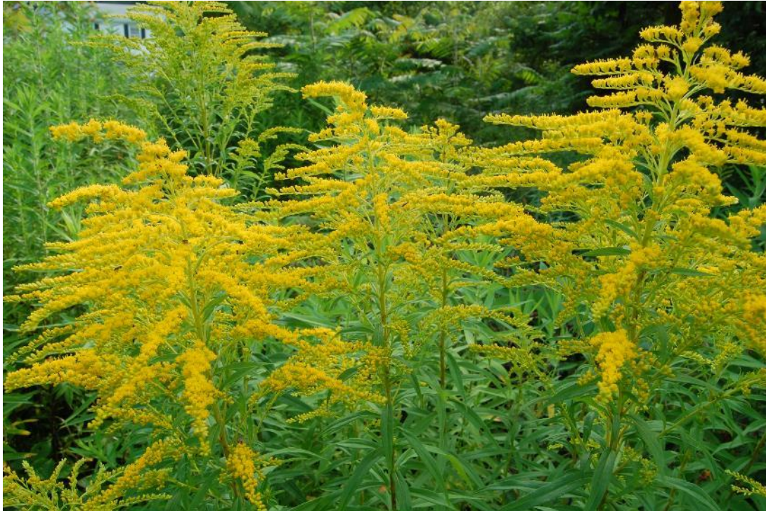
Early Goldenrod.

Sun/Part shade/Shade. 2-4 ft tall. Dry to moist soil. Yellow flowers in summer. Deer resistant, attracts pollinators, drought tolerant.