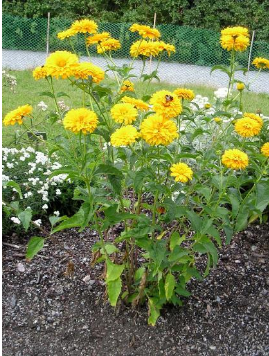
False sunflower.

Sun/Part Shade. Dry or sandy soils. Blooms Jun, Jul, Aug & Sept. 3-4 ft. Attracts pollinators.