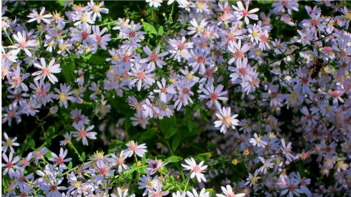
Blue Wood Aster.

Full sun, Sept.- Oct. Bloom, height: 2-3ft., white-blue flowers. Drought tolerant. Deer resistant.