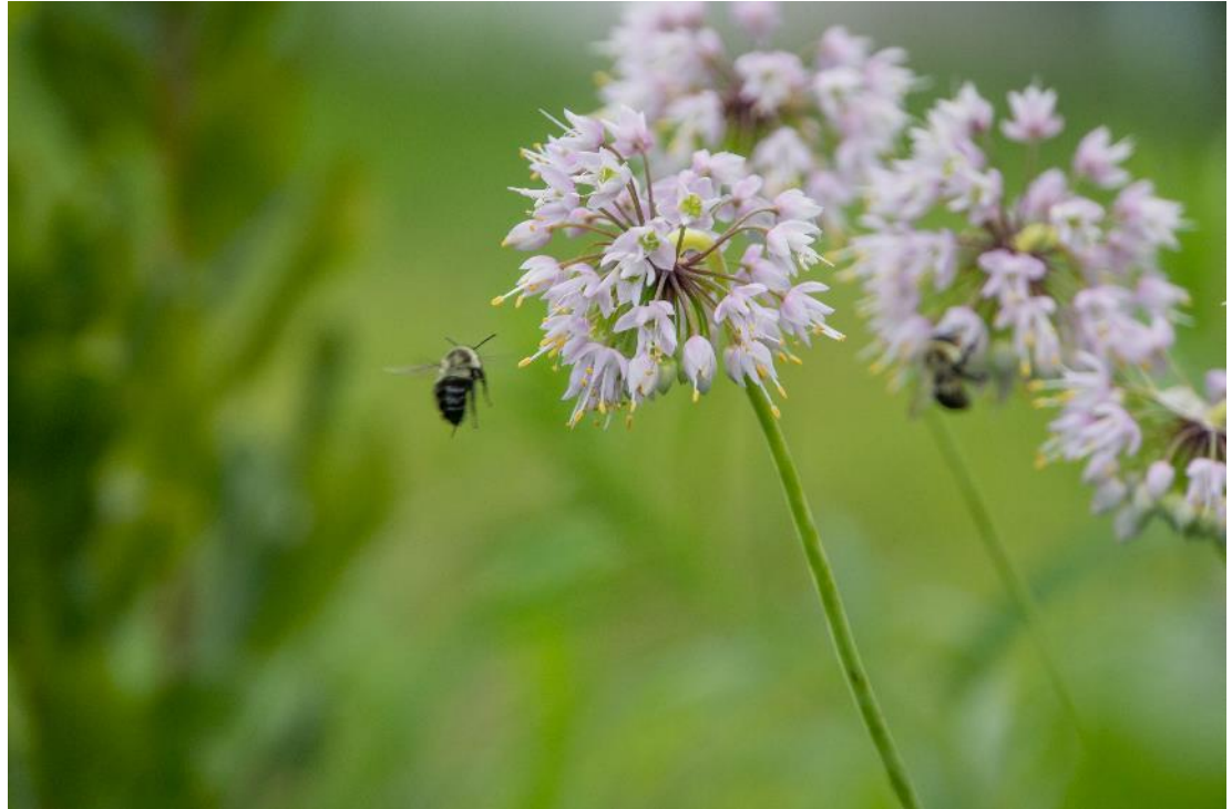
Allium cernuum with bees.