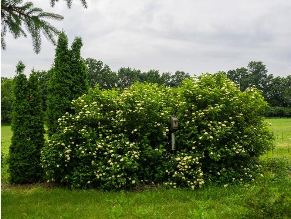
Full shrub (flowered).

Sun/Part Shade/Shade. Dry to wet soil. 6-12 ft tall shrub. White flowers May-Jul. Blue-black berries in the fall.