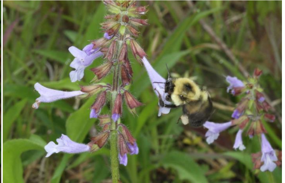
Salvia lyrata (not Burgundy Bliss) with bee.