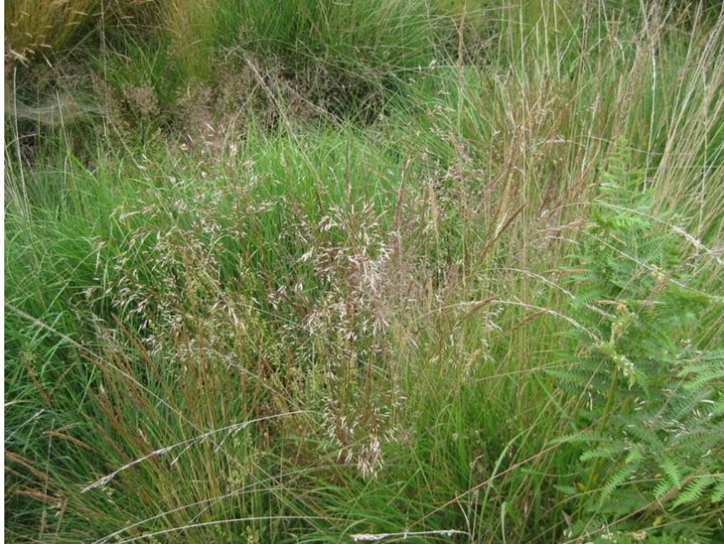
Deschampsia flexuosa .

Full sun/part shade, July-Nov bloom, height: 6-12". Deer resistant. Drought resistant.