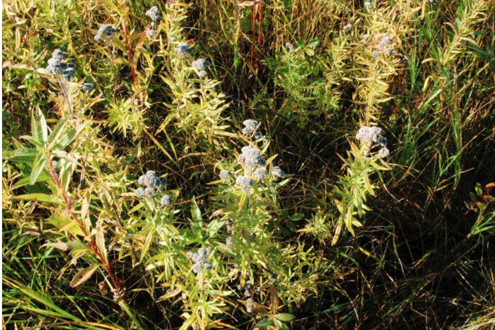
Mountain mint.

Part shade. Moist soils. Pale lavender flowers. Mint fragrance. Nectar producer. Deer resistant.