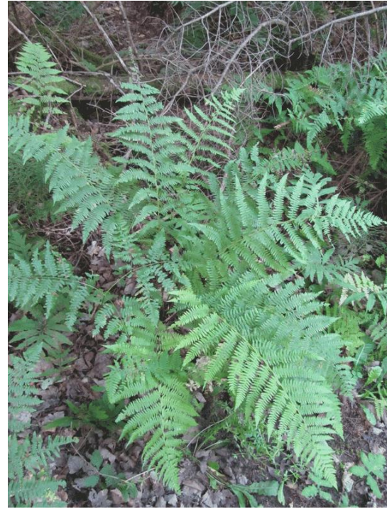
Lady fern.