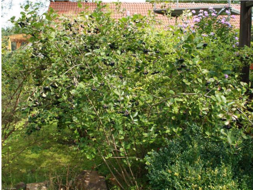
Black Chokeberry.

Full sun, part shade, May bloom, height: 3-6 ft., white flowers in spring, purple and black fruit in summer eaten by many birds and mammals