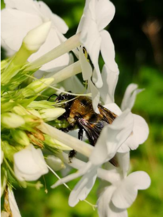
Garden phlox and bee.

Sun. Moist soil. 3-4 ft tall. White flowers, Jul-Sep. Mildew resistant variety.