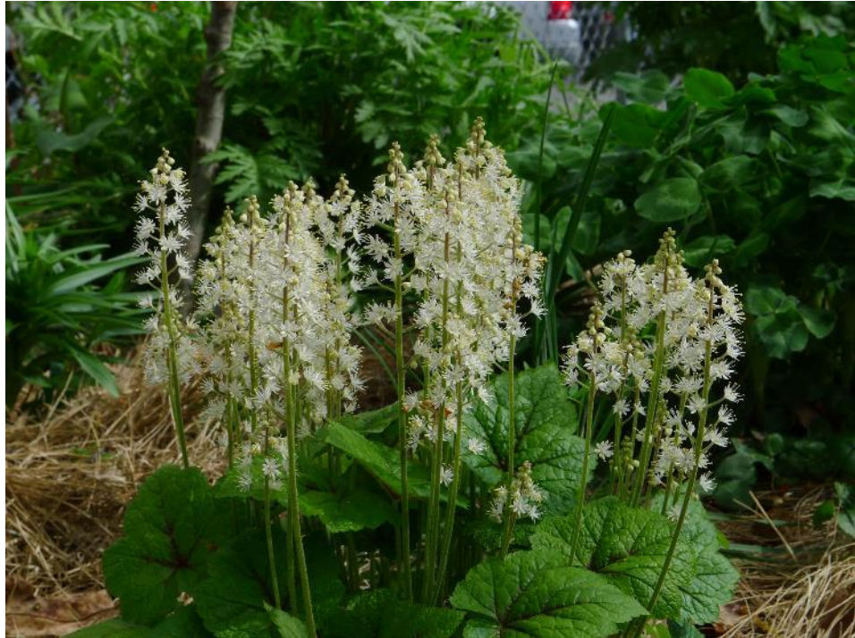
Foamflower plant.