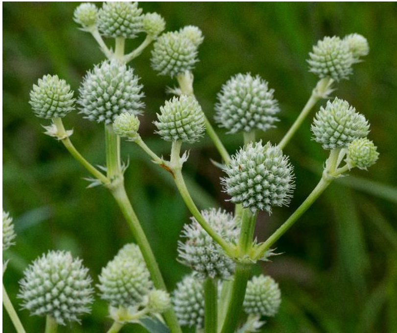
Rattlesnake master.

Full sun, June-Sept. Bloom, height: 4-5ft., water: dry-med, drought tolerates drought, member of the carrot family,