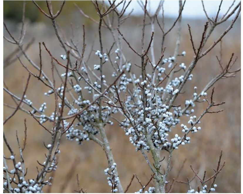
Bayberry berries.