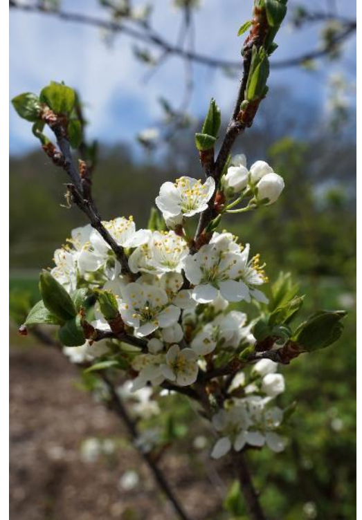
Beach plum.