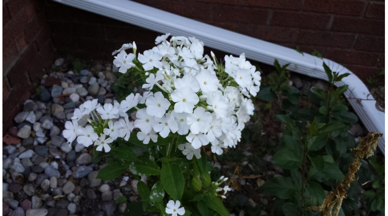
Garden phlox.