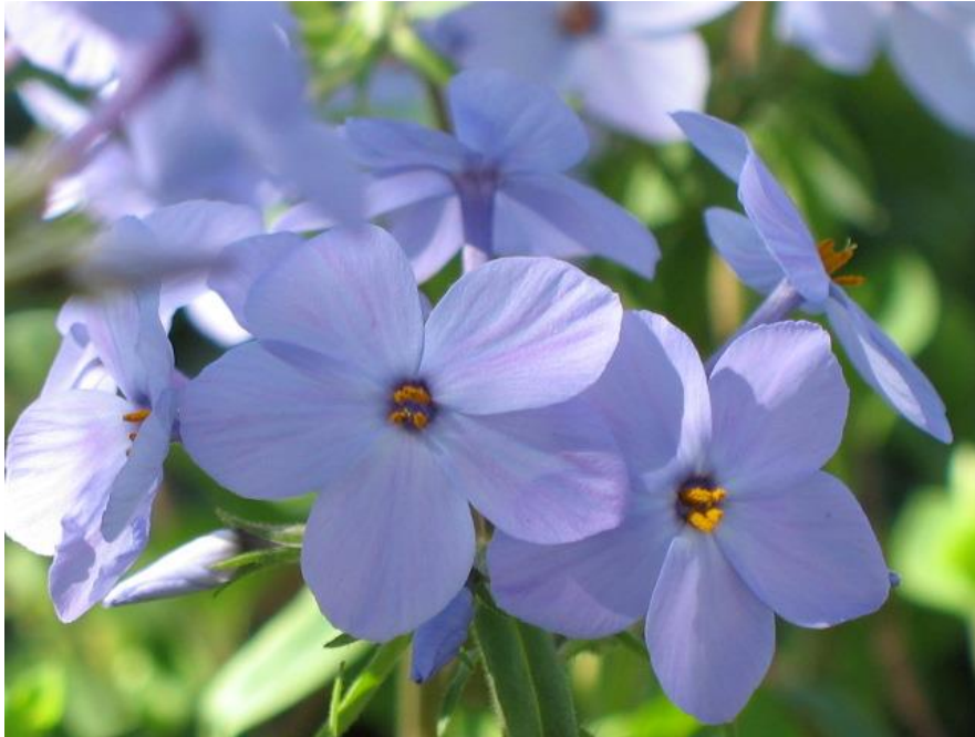
Woodland phlox.

Sun. Moist soil. Up to 8" tall. Pale blue flowers, Jul-Sep. Mildew resistant variety.