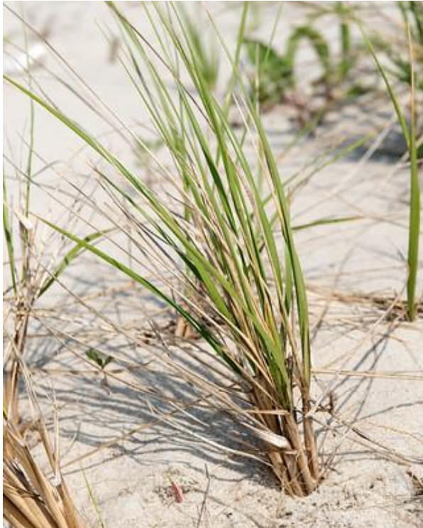
Beach grass.

Sun, Jul. - Sept. bloom, height: 18 – 30” tall. Drought tolerant. Salt tolerant. Deer resistant.