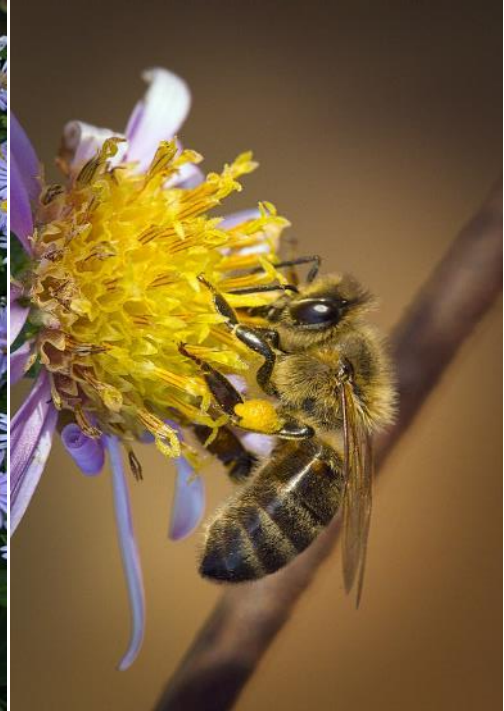
Bee on New York Aster.