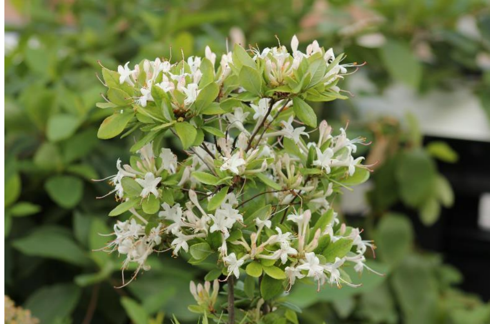
Swamp Rhododendron