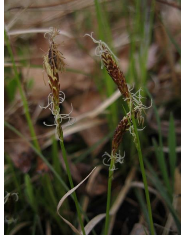
Pennsylvania Sedge.