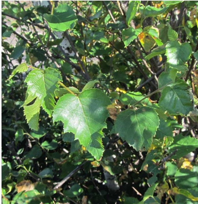
Grey Birch.

Full sun/part shade, Apr. bloom, height: 10- 20ft., chalky white bark with dark trunk wedge markings, long-pointed toothy leaves, attracts birds, butterflies and caterpillars, deer tolerant