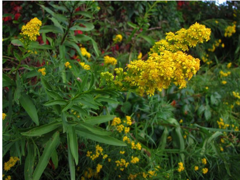
Seaside Goldenrod.