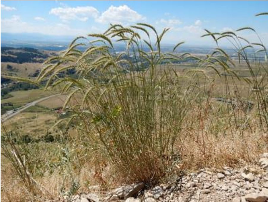
Elymus canadensis .

Full sun/part shade, blue leaves, height: 3-4ft. Seed heads in summer. Deer resistant.