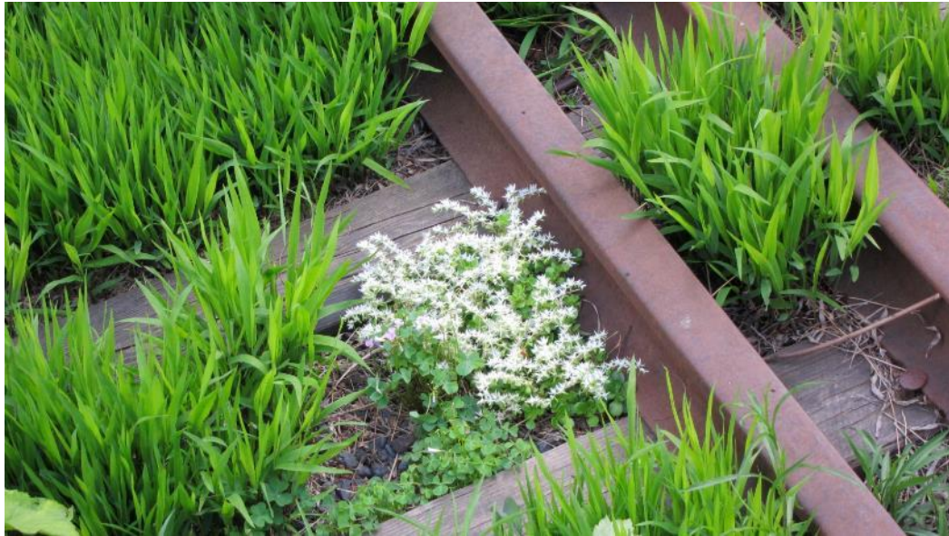
Sedum ternatum .