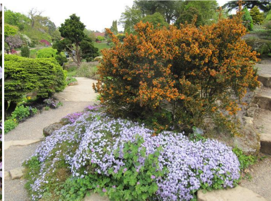
Blue Emerald (foreground).