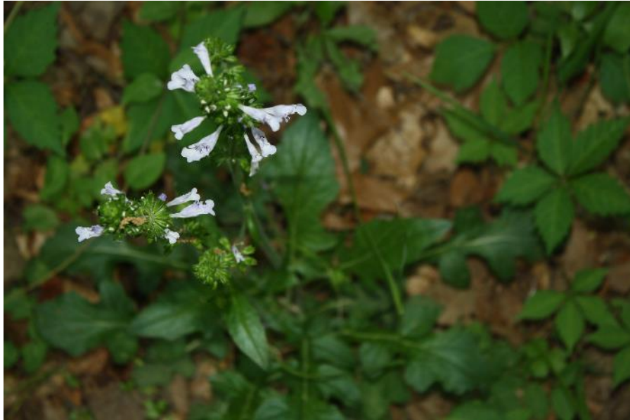
Salvia lyrata (not Burgundy Bliss).

Sun/Part shade/Shade. Dry to moist soil. 6" tall, white flowers up to 12" tall. Deep burgundy foliage, evergreen. Deer resistant.