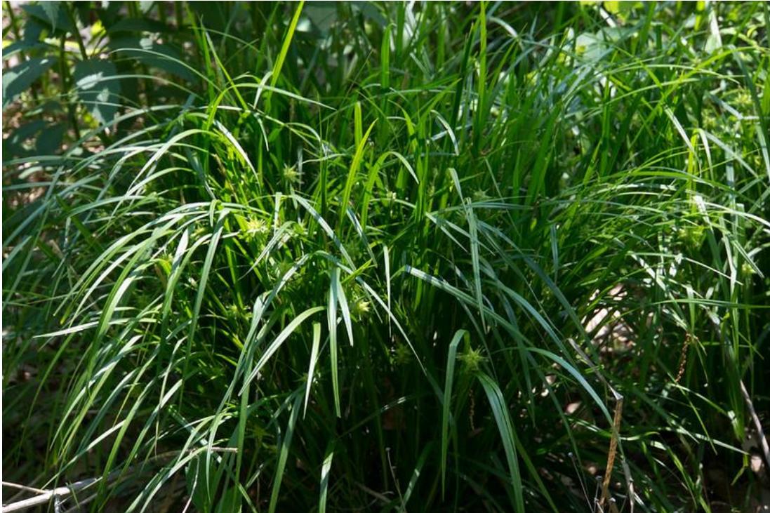
Mace Sedge.

Full sun, part shade. Spiked-globe seedheads in May. Height: 18-36", Deer resistant.