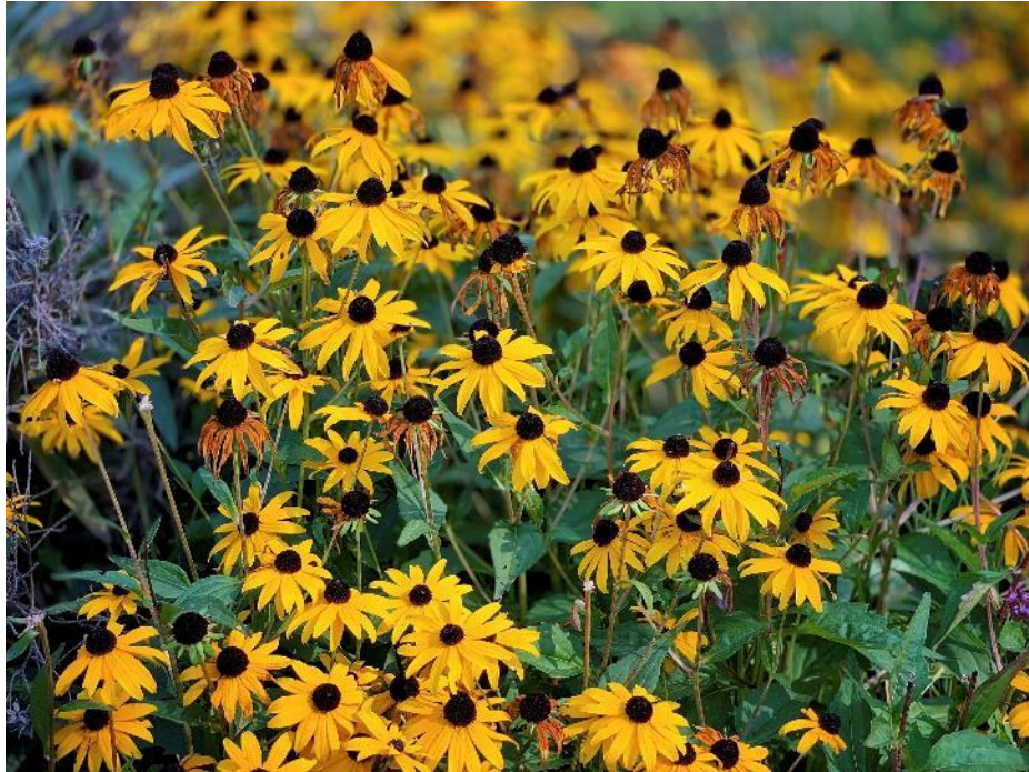
Black-eyed Susan.

Sun. Dry-moist. 24" tall. Bright gold daisies Jun-Oct. Low-maintenance. Seeds attract birds.