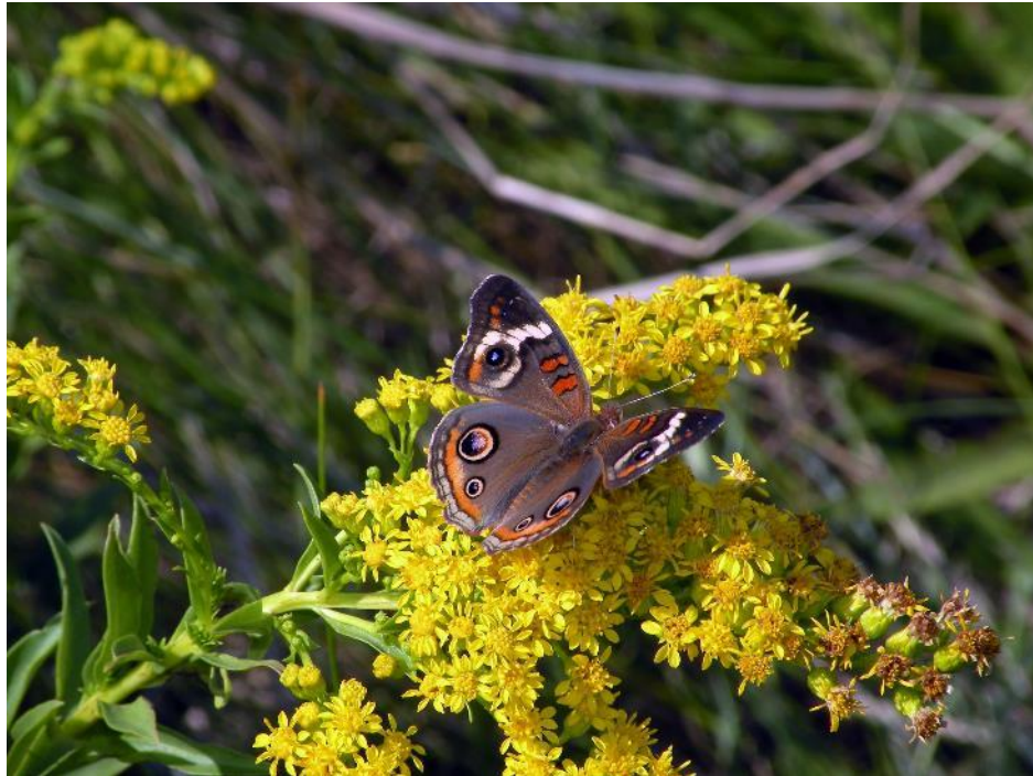
Goldenrod with Common Buckeye.

Sun. Moist soils. 2-4 ft tall in bloom. Golden yellow flowers Sep-Oct. Salt and drought tolerant, deer resistant. Attracts pollinators.