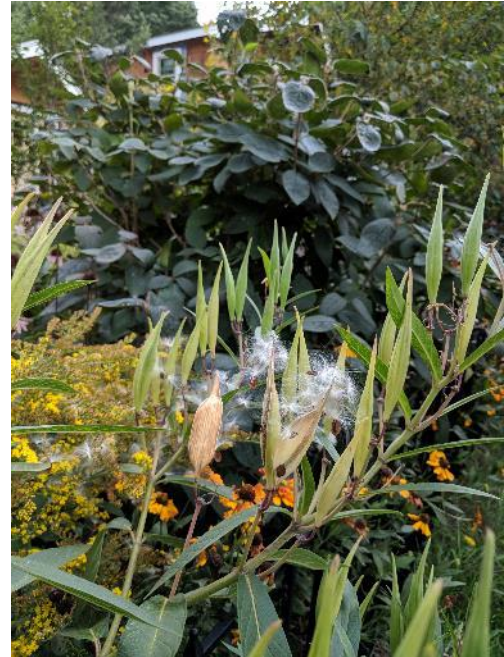
Seed pods.