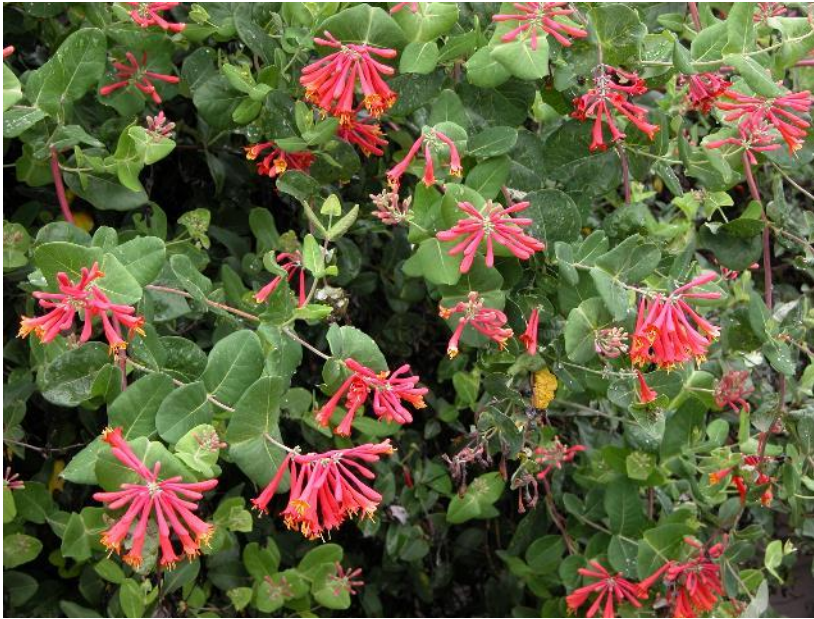
Trumpet honeysuckle.

Sun/Part shade. Moist soils. 15-20 feet. Pink flowers bloom Mar-Jun. Trellised. Attracts pollinators.