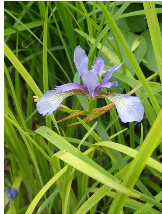
Slender Blue Iris.