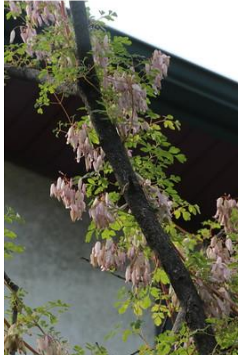
Allegheny Vine.