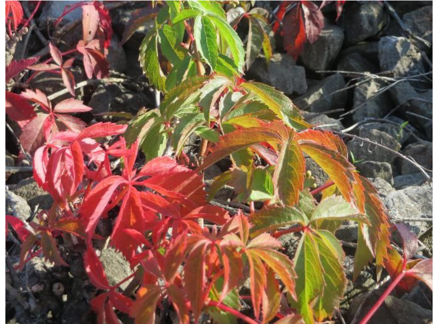
Virginia creeper.