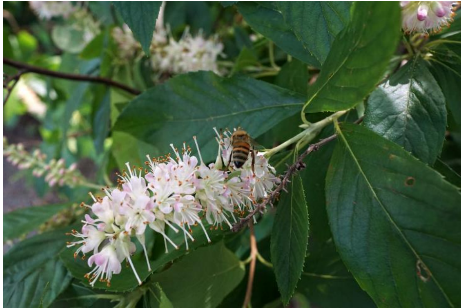
Clethra anifolia .