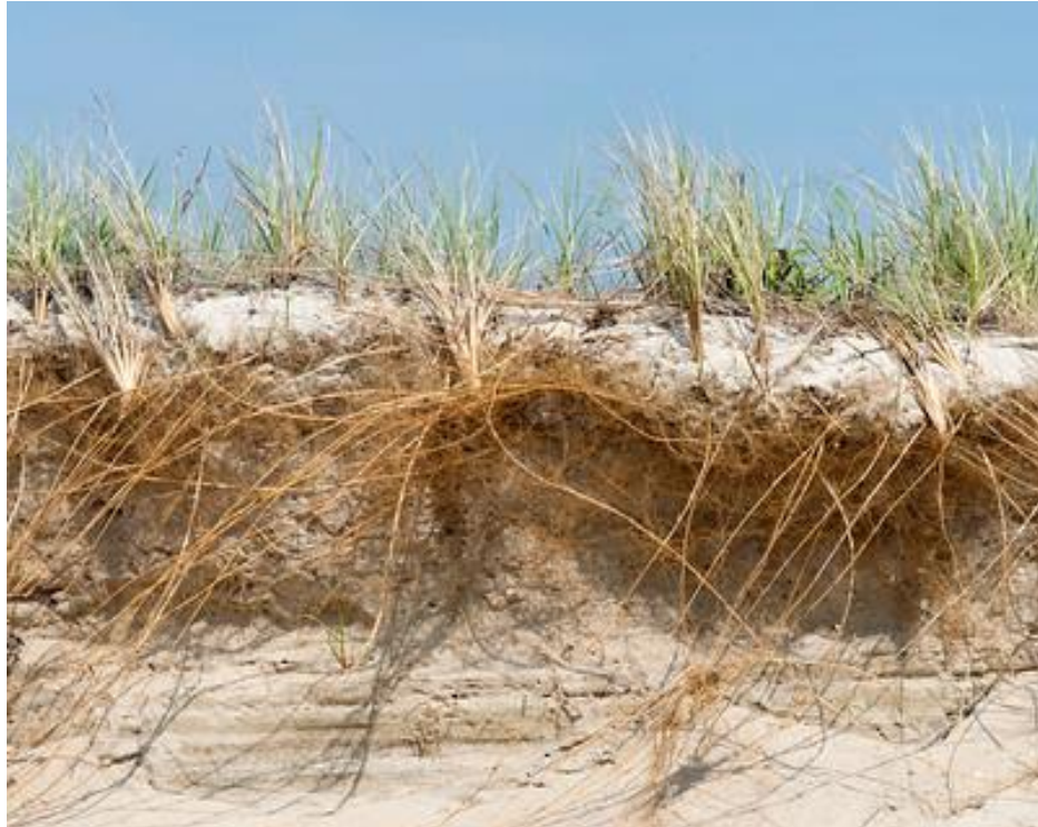
Beach grass.