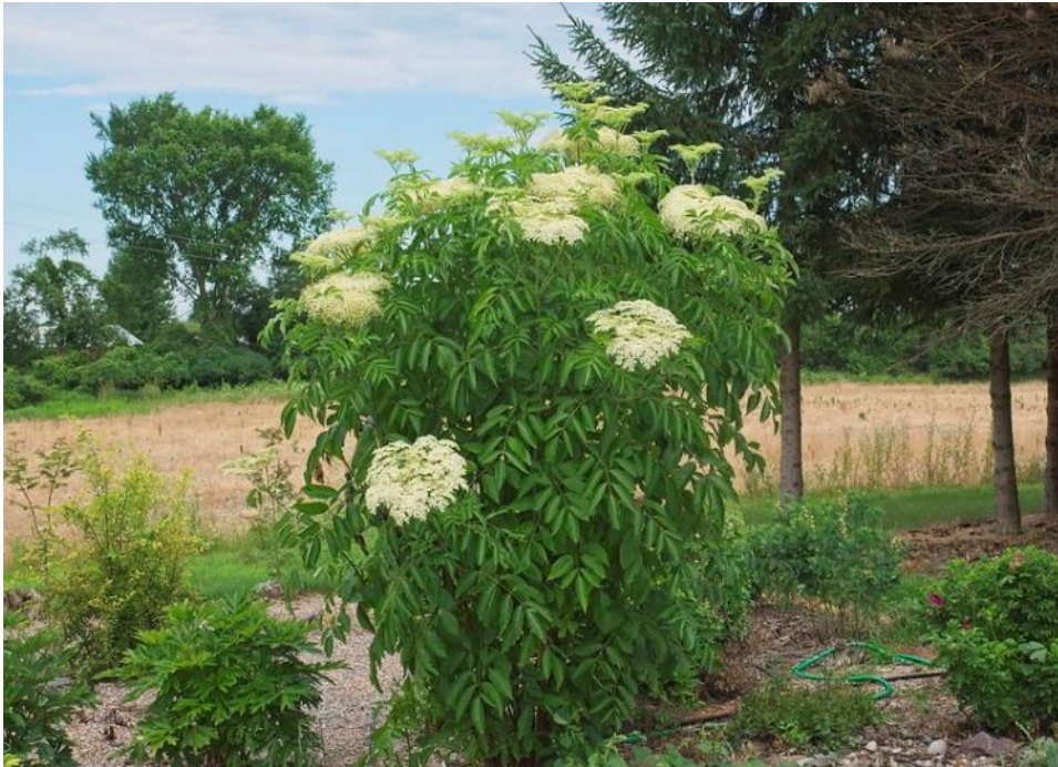
Black Elderberry.

Full sun, part shade. Dry to moist soil. 6-10' tall. June - enormous white flower clusters. August – delicious purple-black fruit. Fast growing.