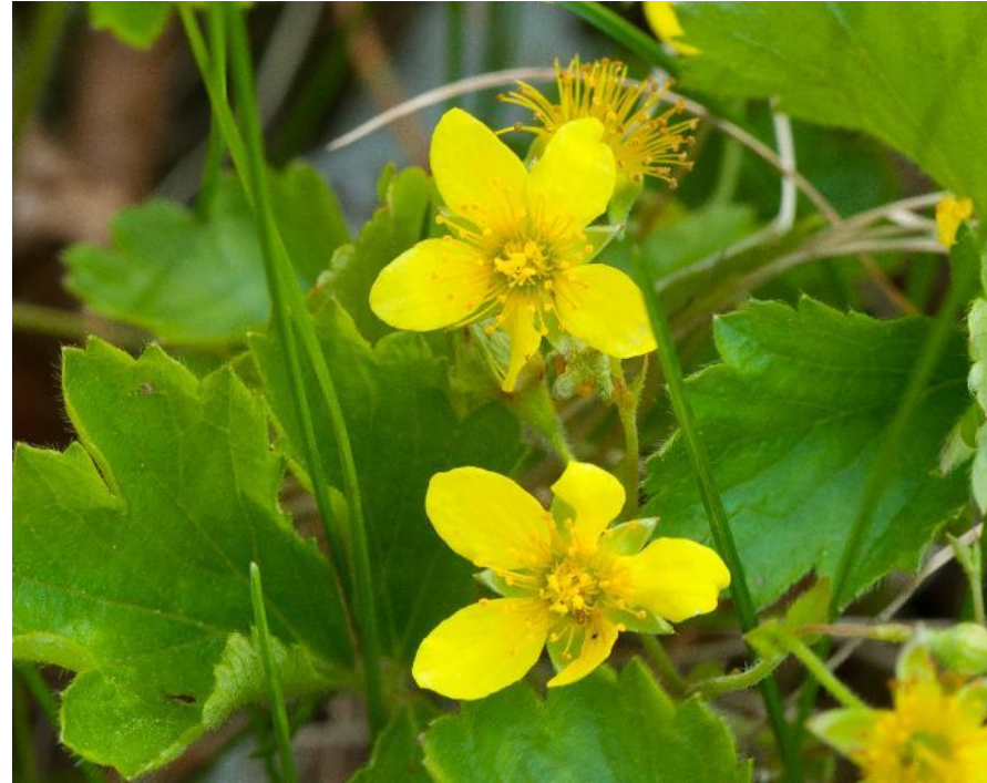
Barren strawberry.