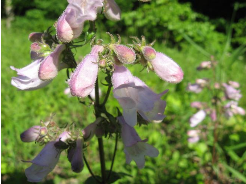
Calico beardtongue.

Sun/Part shade. 24-30" tall. Moist to dry soils. June-July. Attracts pollinators. Deer resistant.