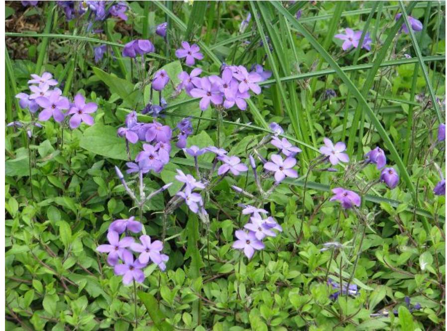
Woodland phlox.