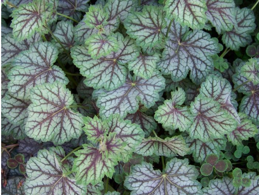
Heuchera 'Green Spice' leaves.

Full sun/part shade, June-July bloom, height: 1.5-2.5 ft., water: medium, drought, heat and humidity tolerance, effective as a border along pathways and walkways