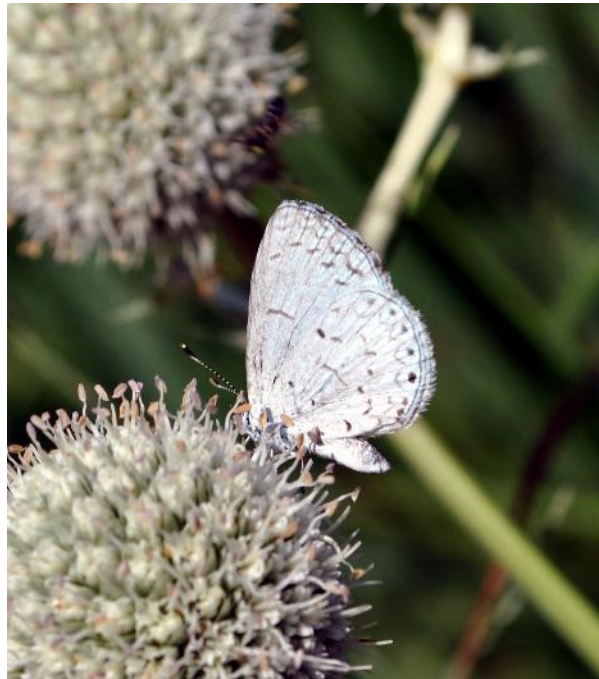
Rattlesnake master.