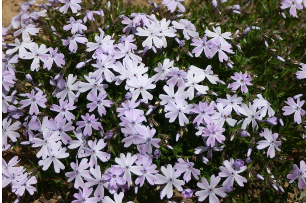
Blue emerald.

Sun. Moist soil. 2-4 ft tall. Pale violet flowers, Jul-Sep. Mat-forming evergreen creeper.