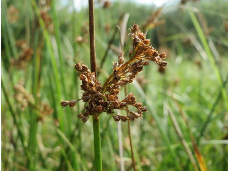
Variegated Rush.

Full sun, Jun. bloom, height: 2-3ft. Moist to wet soil tolerant. Salt tolerant. Attracts pollinators.