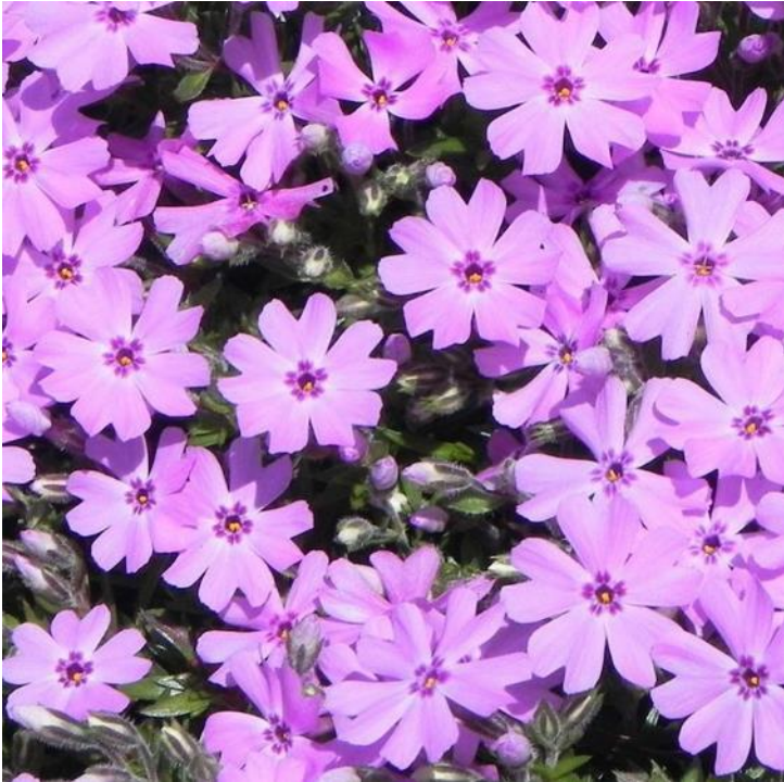
Fort Hill.

Sun. Moist soil. Pink flowers, evergreen foliage, attracts pollinators. Deer resistant.