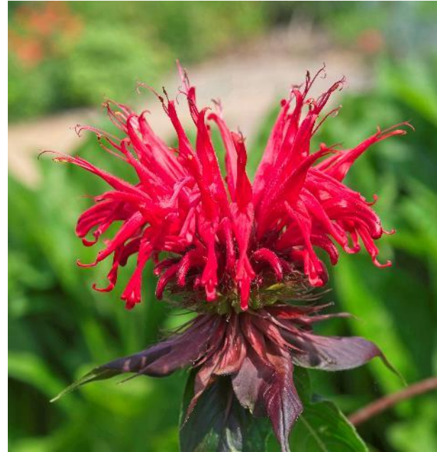
Monarda didyma .