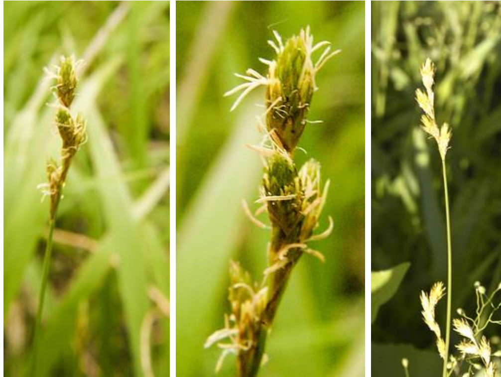
Prairie Sedge.

Sun, Part shade, clump-forming, height: 18-36", Moist & drought resistant. Deer resistant.