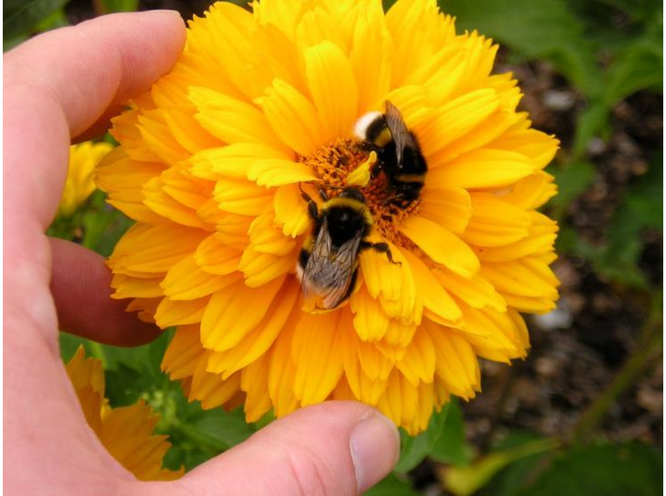
False sunflower with bees.