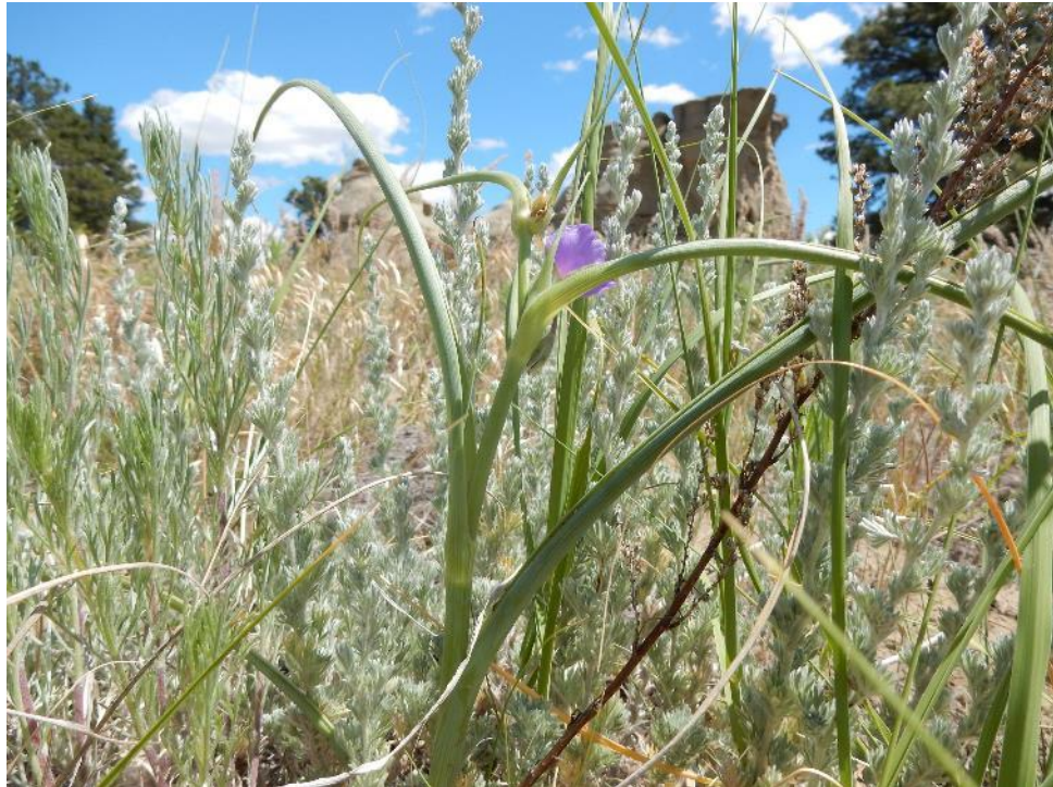
Spiderwort (foreground).