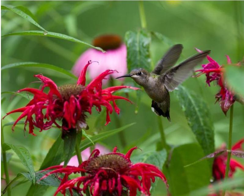
Ruby-throated hummingbird with Beebalm.

Sun/Part shade. Moist to wet soils. 2-4 ft tall, but can grow up to 6 ft. Clustered red flowers bloom May-Oct. Mildew resistant cultivar. Attracts pollinators, deer resistant.