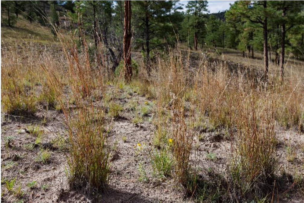
Little Bluestem.

Sun/Part shade. 2 ft tall. Blue-green foliage with red/purple fall highlights. Seeds heads feed wintering birds. Deer resistant.