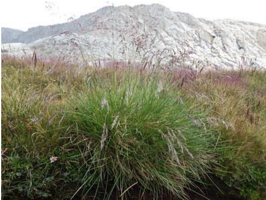
Deschampsia cespitosa .

Full sun/part shade, July-Nov bloom, height: 2-3ft., clump-forming. Deer resistant.