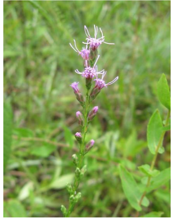
Blazing star.