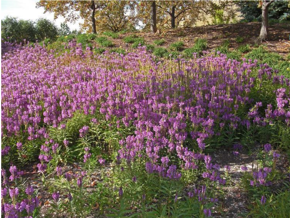
Obedient Plant.

Sun/Part-shade/Shade. 4 ft stems. Moist soils. Variegated leaves, pink flowers. Attracts pollinators.