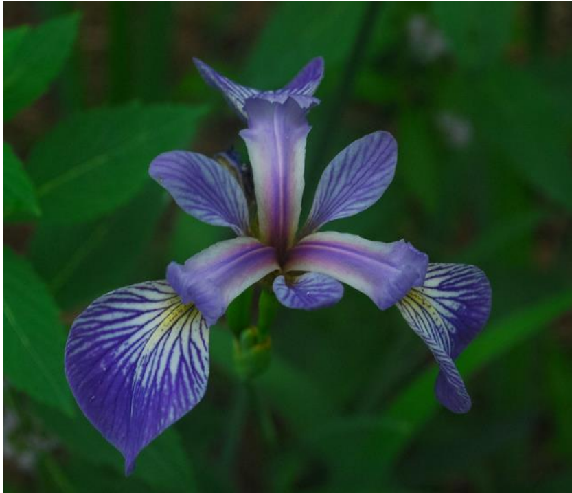
Blue Flag.

Full sun, Jun. bloom, height: 2-3ft. Moist to wet soil tolerant. Salt tolerant. Attracts pollinators.