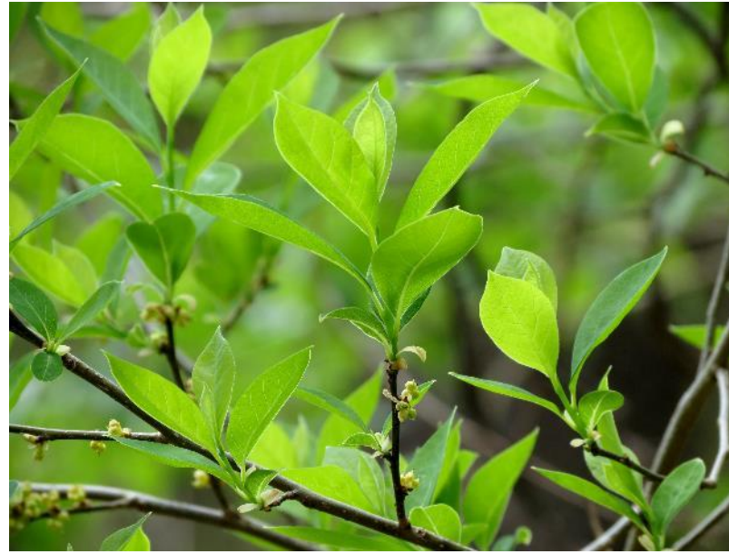
Spicebush leaves.