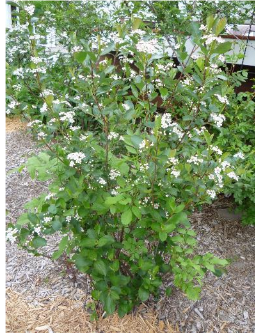
Flowering plant.