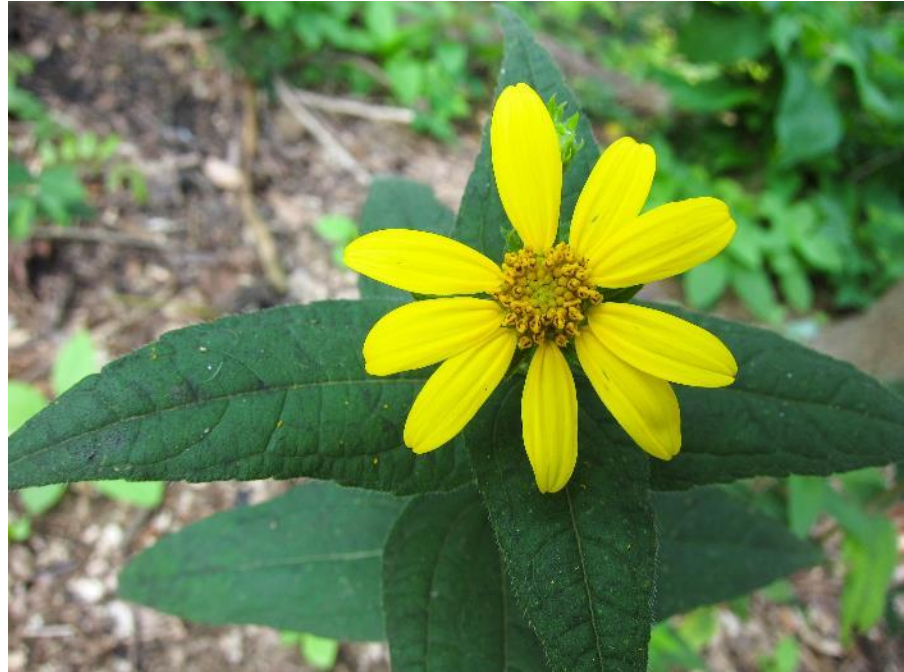
Woodland sunflower.