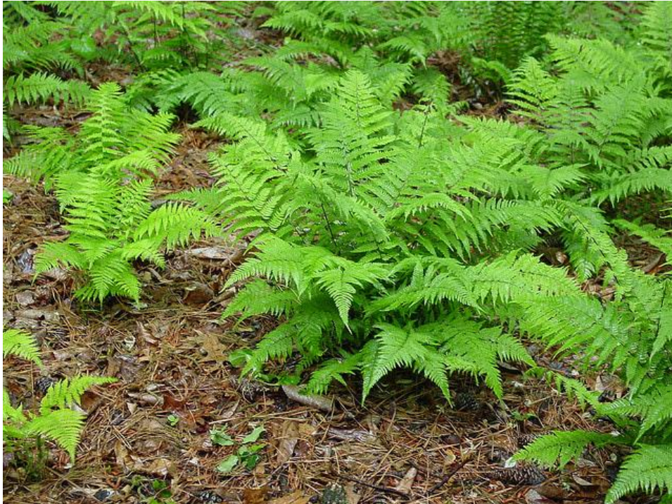
Lady fern.

Part shade/full shade, easier to grow in rich, medium moisture, well drained soil, tolerates drier soils than most ferns, tolerates: rabbits and heavy shade