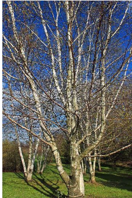
Grey Birch.