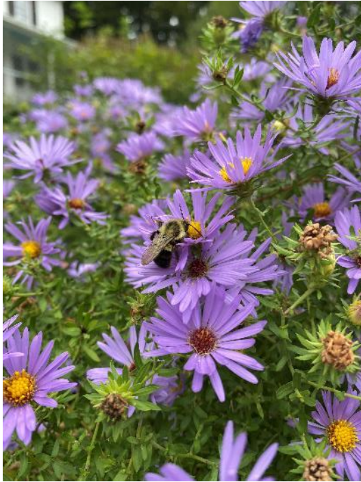
Smooth Aster with bee.

Full sun, Sept.- Oct. Bloom, height: 3-4ft., violet flowers, attracts butterflies and pollinators