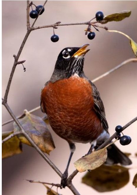
American robin.