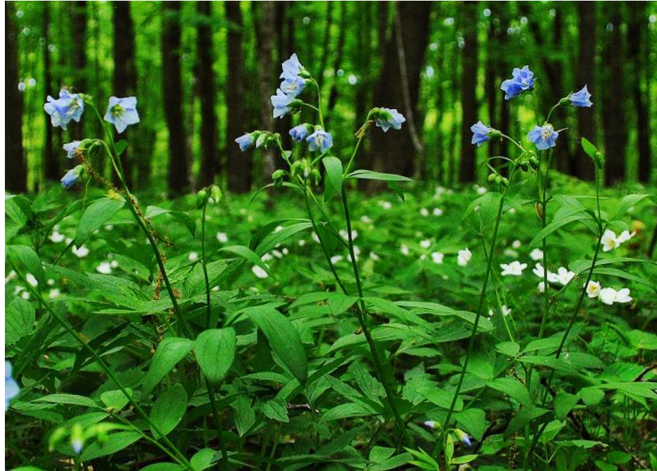
Jacob's Ladder (non-variegated).