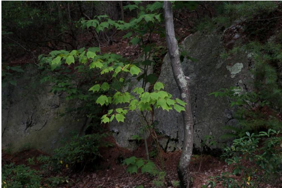
Acer pensylvanicum .