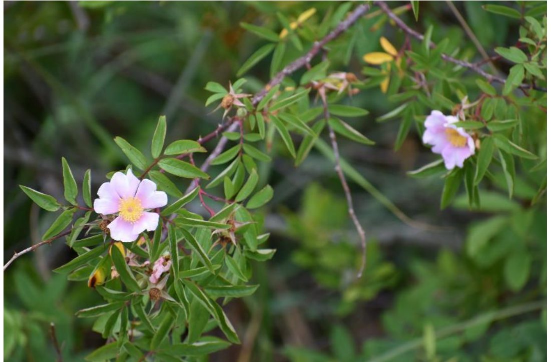
Swamp Rose.