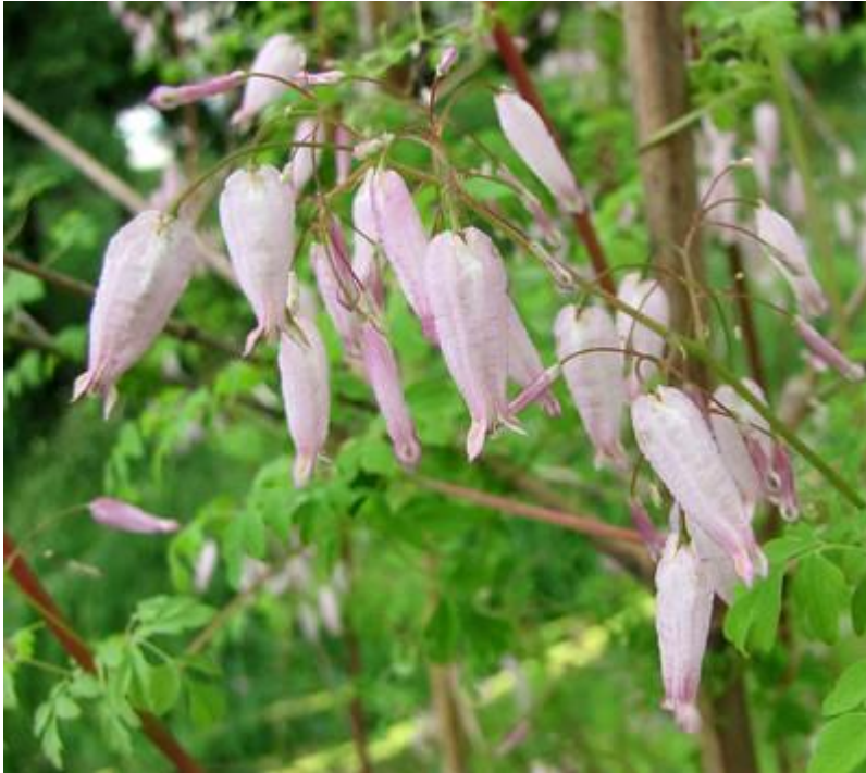
Allegheny Vine.

Part shade. Jun-Jul blooms. Pink, white flowers. Height: up to 10' tall. Climbing vine.