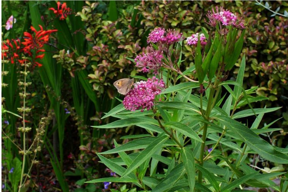
Showy swamp milkweed with butterfly.

Full sun, July-August bloom, showy bright pink flowers, height 4-5ft., attracts butterflies