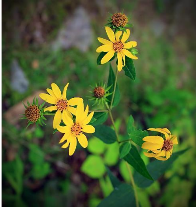
Woodland sunflower.

Part shade, July-Sept. bloom, height: 2-6 ft., water: dry- medium, tolerant of wide range of soil conditions, divide every 3-4 yrs. to control spread and maintain vigor, attracts birds and butterflies, deer and drought tolerant