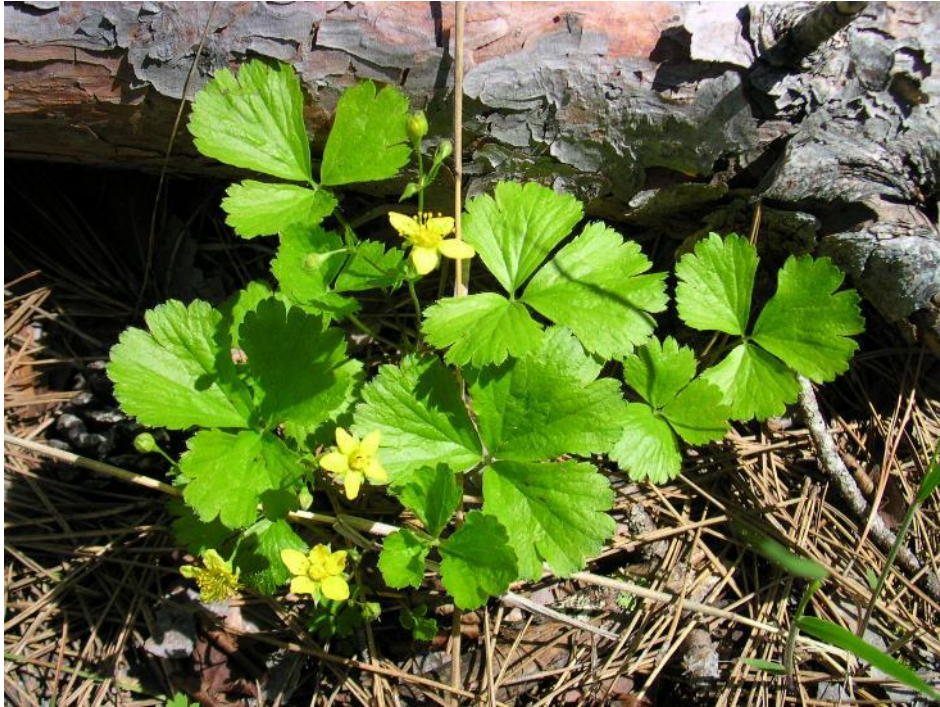
Barren strawberry.

Part shade/Shade. Weed-smothering groundcover. Yellow flowers Apr-Jun. Evergreen leaves.