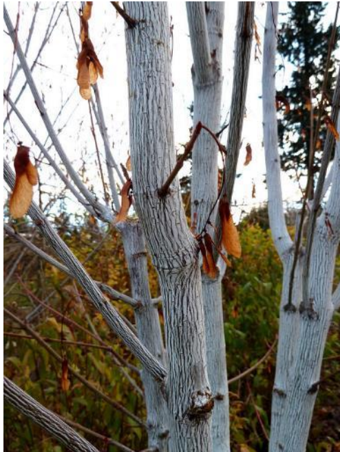
Acer pensylvanicum .

Part-shade, shade. Apr-May blooms. Height: 15 – 25' tall. Small tree w/ distinctive white stripes on young trunks. Lemon yellow fall foliage.