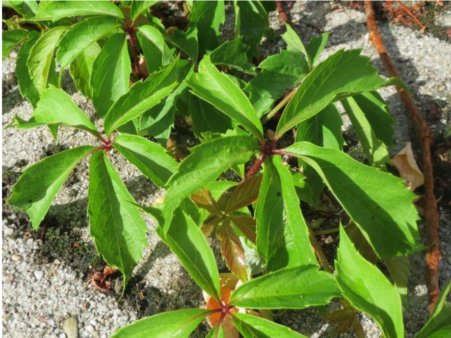
Virginia creeper.

Sun/Part shade/Shade. Moist soils. Green leaves turn red in fall. Attracts birds with berries (toxic to humans). Ground cover, climbing vine.