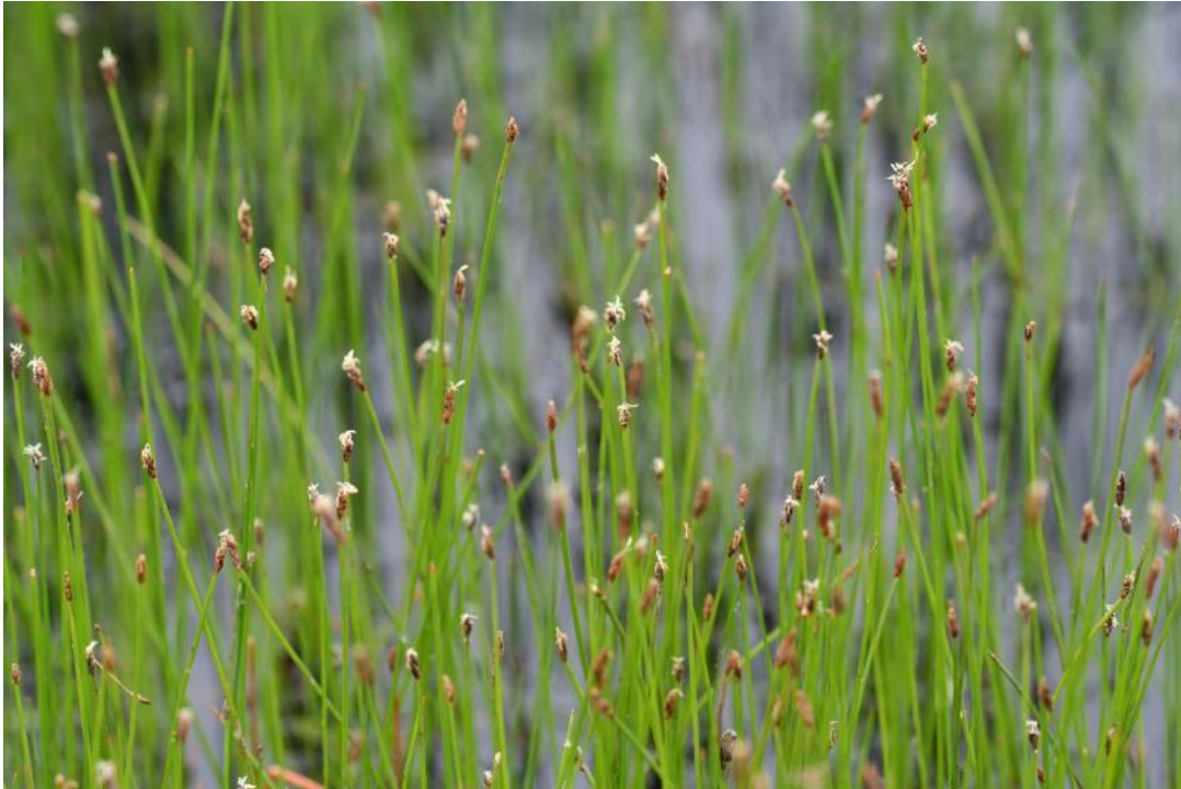
Blue-eyed grass.

Sun. Wet soils. 6-18" tall. Blue flowers Mar-Jul, grass-like foliage. Salt tolerant, deer resistant