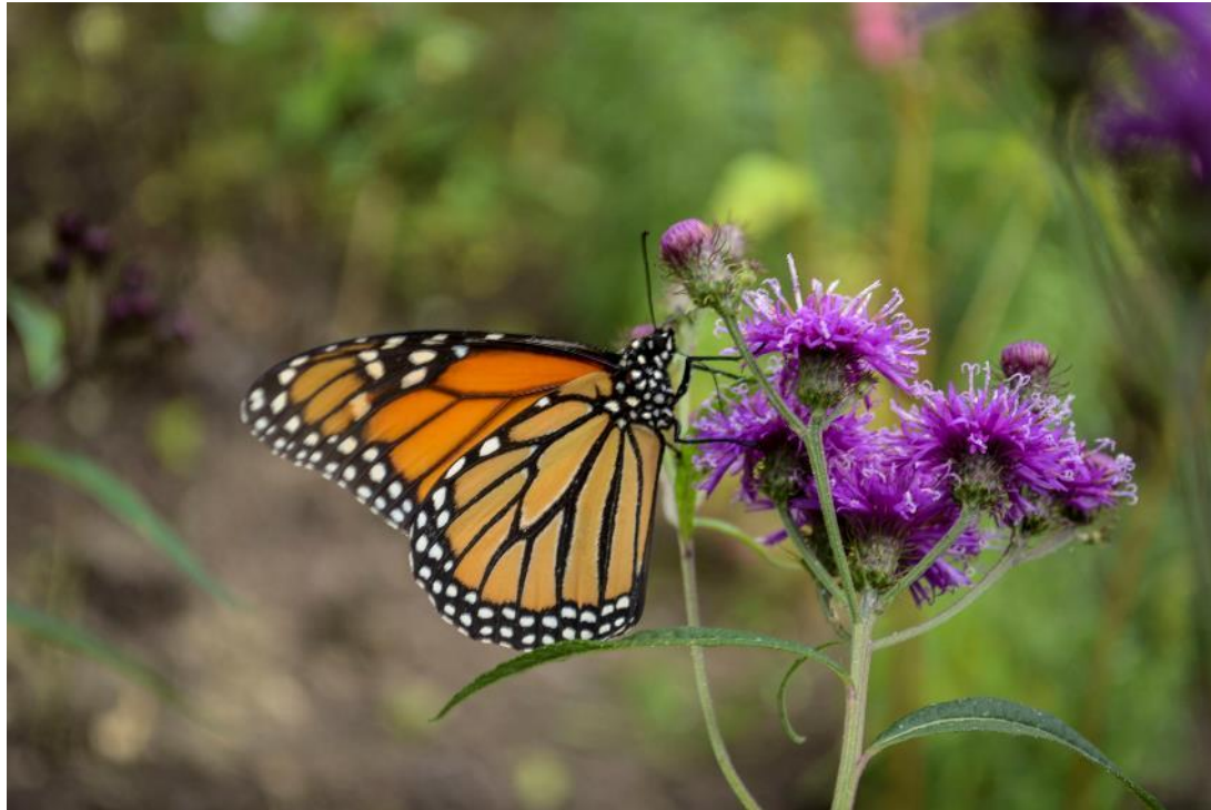
Monarch butterfly.

Sun. Moist soil. 4-7 ft tall. Strong vertical presence. Attracts pollinators.