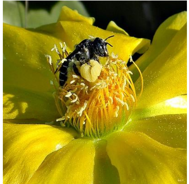
Bee on cactus flower.