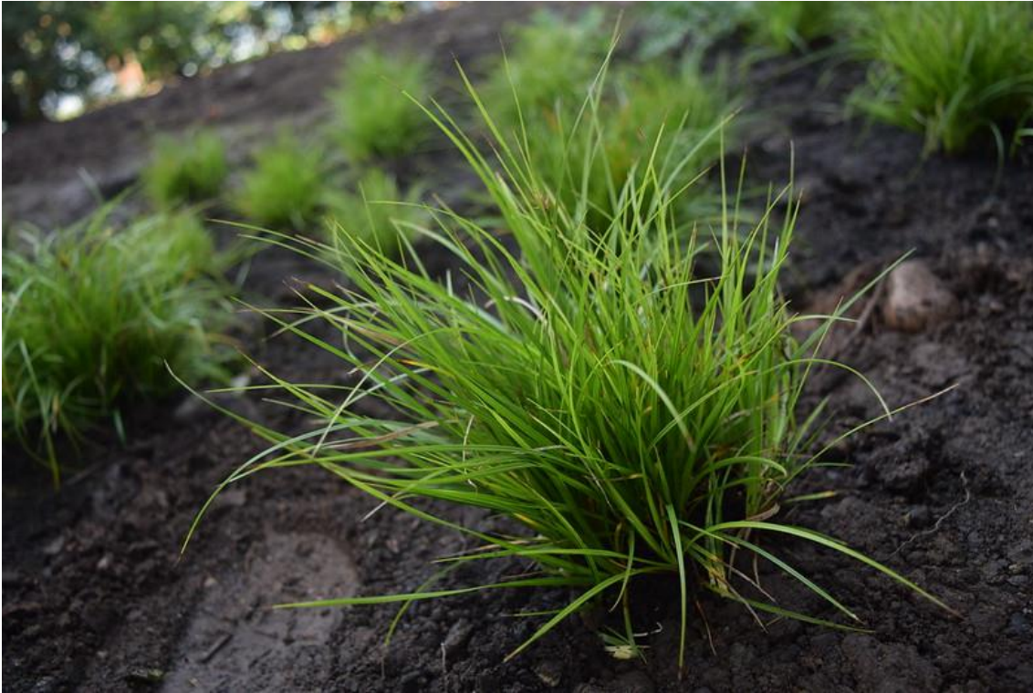
Pennsylvania Sedge.

Sun, part shade, shade. Height: 8", small-large scale groundcover. Deer resistant.