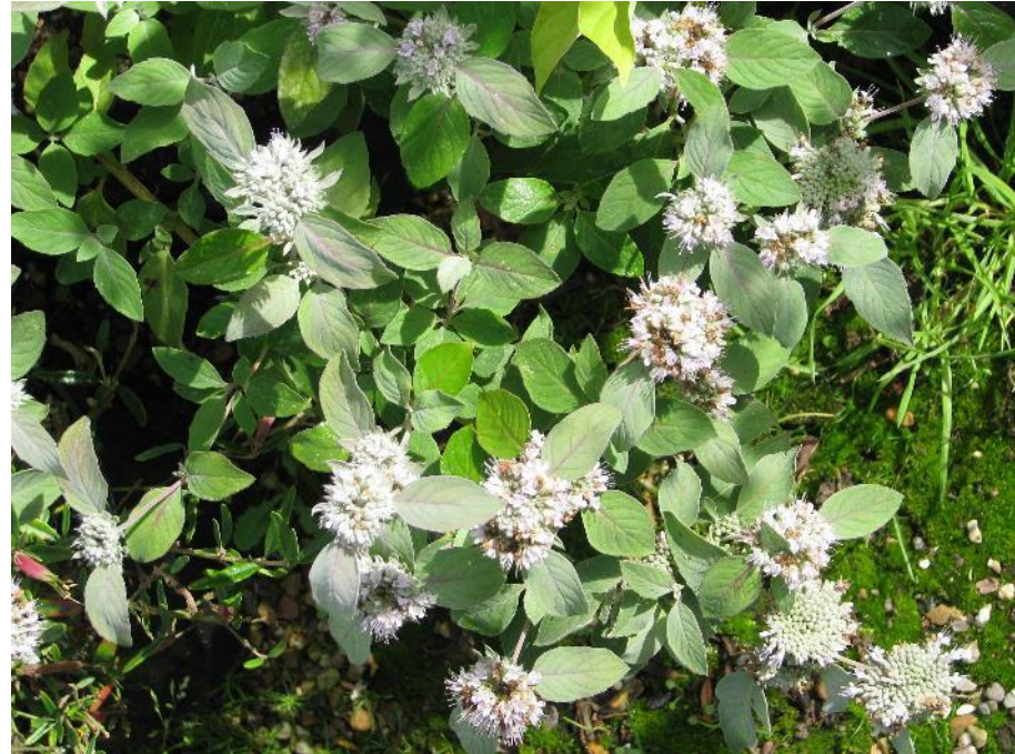
Mountain mint.