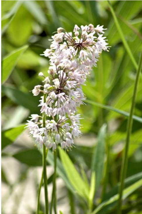
Allium cernuum .

Full sun/part shade, June-Aug. bloom, height: 1-3 ft, attracts butterflies and hummingbirds, called nodding onion because flowers nod down to protect from