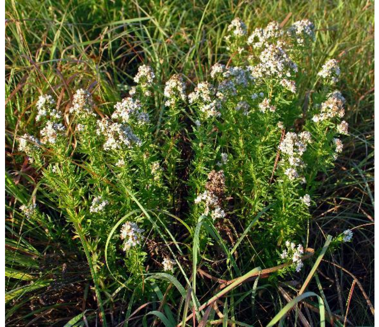
Mountain mint.