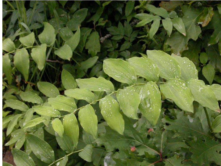
Solomon's seal.