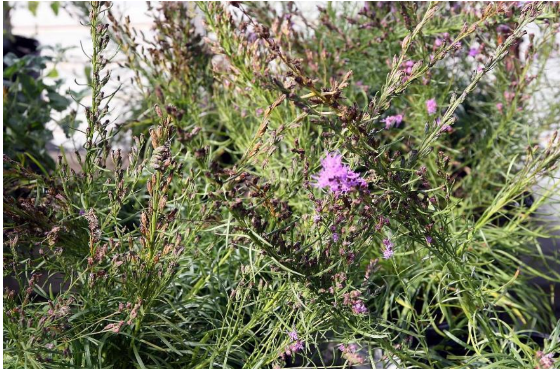
Blazing star.

Full sun, July bloom, height: 1.5-2 ft., water: dry-medium,