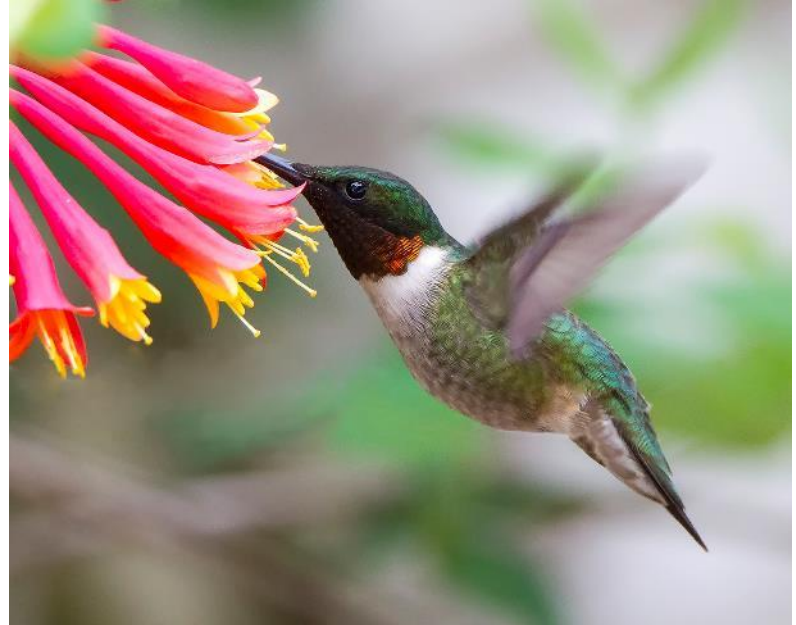
Ruby-throated hummingbird.