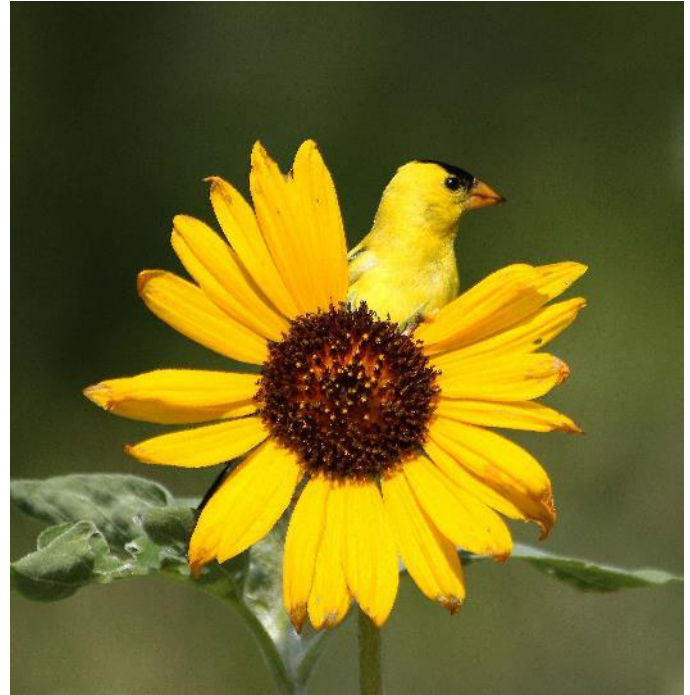
American Goldfinch.