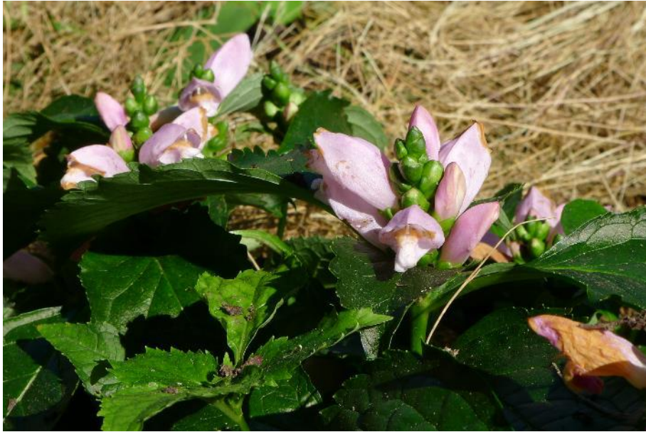
Chelone glabra .

Part shade, best in moist to wet soils. Blooms Aug/Sept/Oct. 2-4 ft height. Interesting shaped, pink flowers atop a long stem, grows in clumps. Attracts pollinators like hummingbirds.