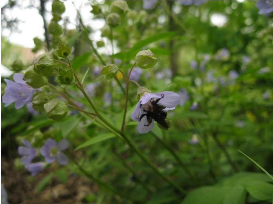
Jacob's Ladder with bee.

Shade. Moist soil. 10-15" stalks. White to cream variegated foliage. Light blue flowers May-Jun. Deer resistant.