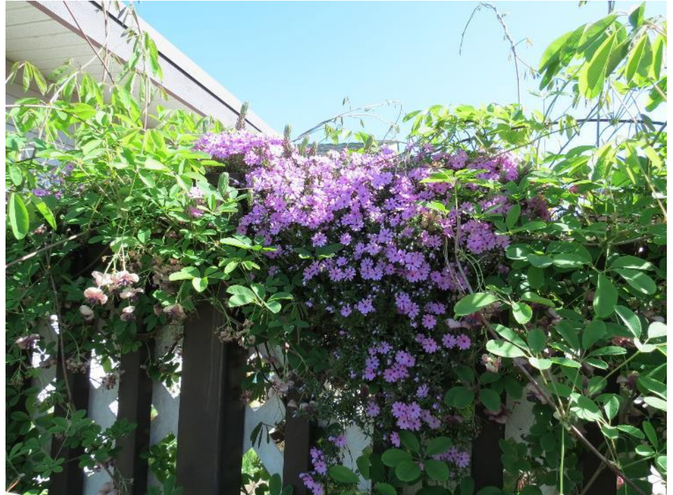
Fort Hill.