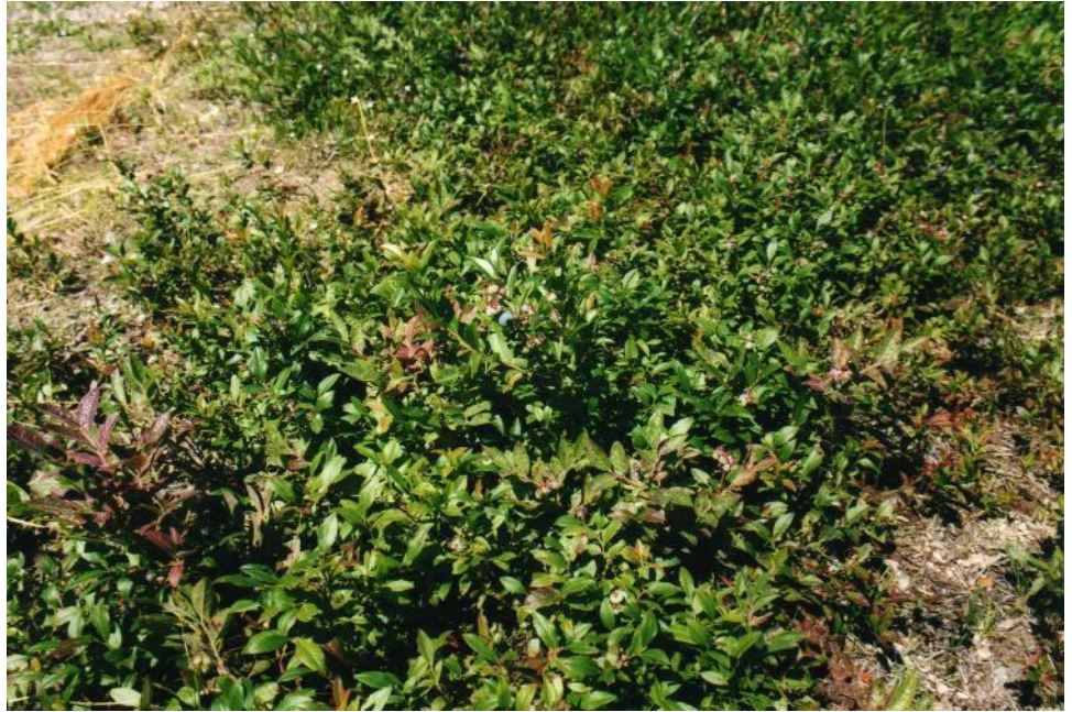
Whole plants.