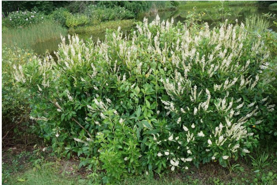
Clethra anifolia .

Full sun/part shade, July-Aug bloom, height: 3-8ft., flower is showy and fragrant, water: medium-wet, attracts birds and butterflies, can be used as a hedge