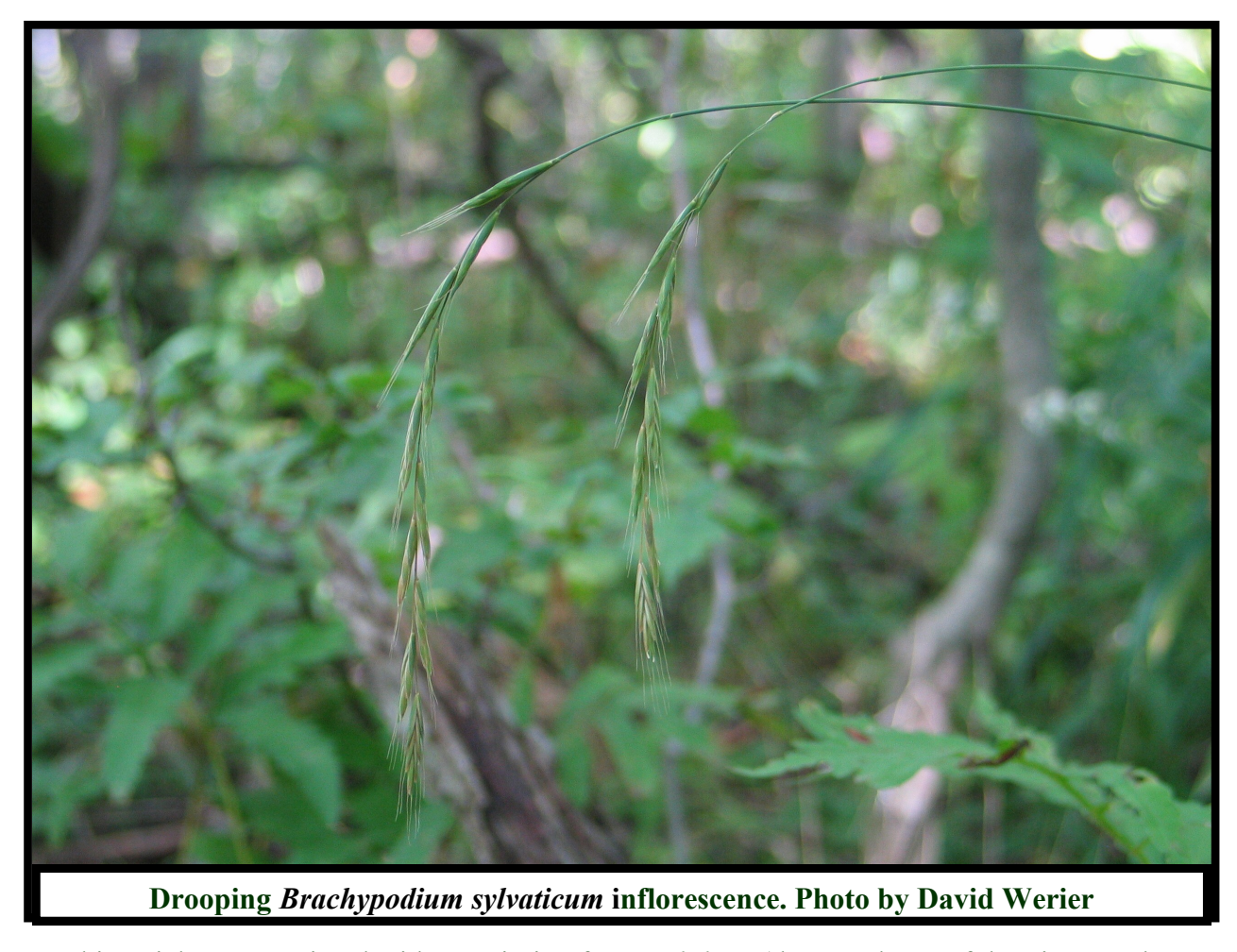
This article was reprinted with permission from Solidago (the newsletter of the Finger Lakes Native Plant Society) 10(3): 1, 12-13.

On December 16, 2009, the Scientific Review Committee of New York that is evaluating nonnative plants for their invasiveness reviewed Brachypodium sylvaticum and ranked it as a Very High invasive species.