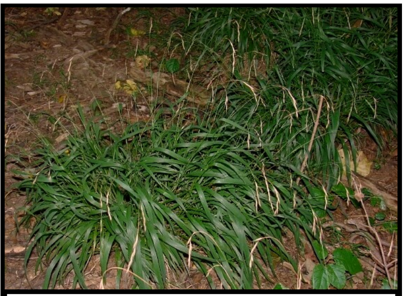
Clumped Brachypodium sylvaticum plants exhibiting drooping leaves and inflorescences.

September early independently found vouchered two populations of false slender brome (Brachypodium sylvaticum ssp. sylvaticum) in New York (Bergen Swamp in Genesee County and Connecticut Hill in Tompkins County [SW of the corner of Tower and Cavutaville Roadsl). population at Bergen Swamp has likely been established for at least a decade. The second author saw slender false brome Bergen in 2004 but never collected a specimen. Jay