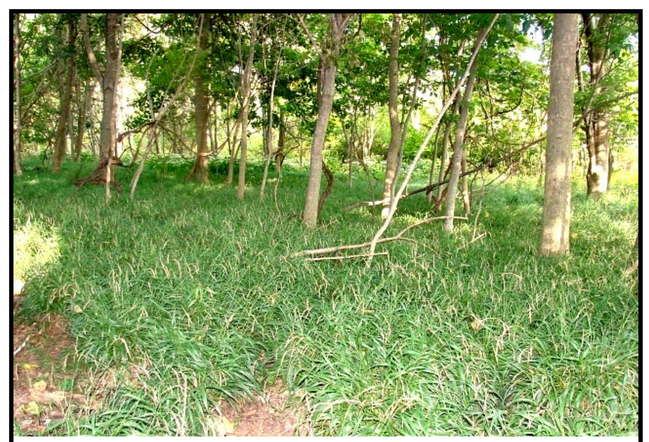
A forest understory invaded by Brachypodium sylvaticum at Bergen swamp.

those of the New York specimens, have a sylvaticum. strong wintergreen aroma. In New York, this species starts to flower in early July and the In its native range slender false brome appears florets persist into October or perhaps later.