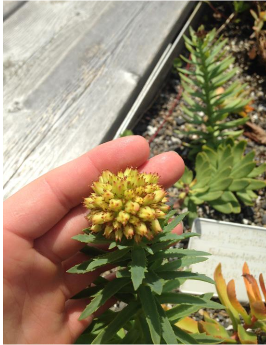
Female Leedy's roseroot flowering on the Gateway Building green roof at SUNY-ESF, Syracuse, NY. These plants were grown from seed collected at Glenora, NY.