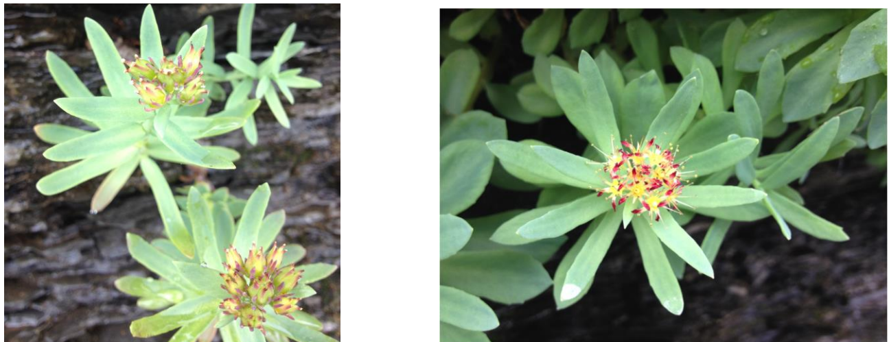
Figure 1. Pistillate (left) and staminate (right) flowers of Leedy's roseroot.

New York State is home to 75% of all identified individuals of the rare glacial relict plant Leedy’s roseroot ( Rhodiola integrifolia subsp. leedyi ) (Olfelt et al. 1998), a subspecies federally listed as threatened and identified as critically imperiled globally and as an S1 plant in New York State. Leedy’s roseroot (Fig 1.) is a unique long-lived dioecious perennial with some noteworthy adaptations for tolerating stresses associated with the cliffs it inhabits. First, like other members of the family Crassulaceae, it has succulent tissues that perform CAM photosynthesis, a water-conservation strategy. Second, its chunky leptomorph rhizomes (Fig. 2), which look similar to ginger ( Zingiber officinale ) rhizomes, are storage organs (Stapleton 1994) and characterize the genus Rhodiola (Ohba 2003). Lastly, marcescent (persistent) flowering stems, another derived trait of Rhodiola expressed by Leedy’s roseroot, are thought to be an adaptation to protect buds from winter exposure (Zhang et al. 2014). These fascinating adaptations and the plant’s restriction to cliffs throughout its range of seven disjunct populations suggest Leedy’s roseroot is highly specialized for its niche, consisting of abiotic and biotic factors. This NYFA-funded project intends to test this hypothesis and is part of my Master’s thesis at SUNY-ESF, working with Dr. Donald Leopold.