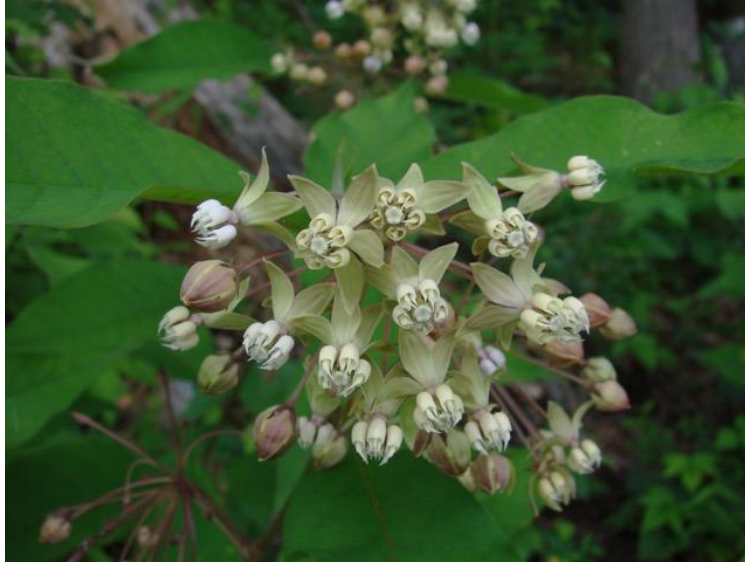
Asclepias exaltata.