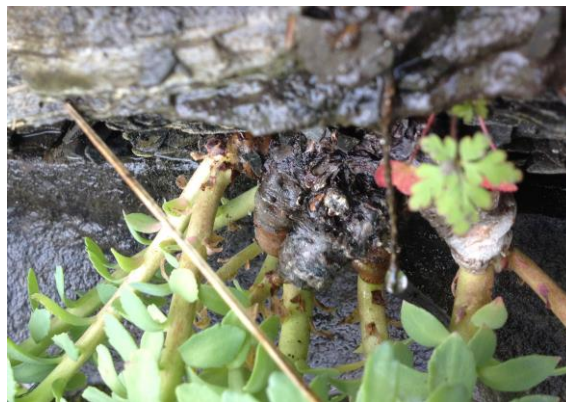
Figure 2. Leedy's roseroot, showing the chunky rhizomes.