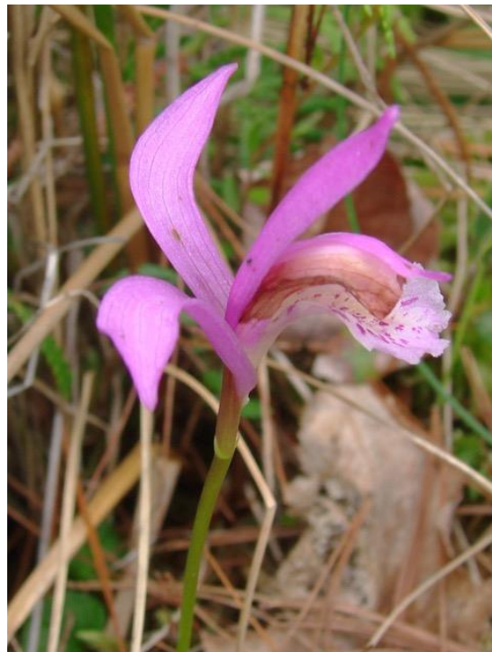
Arethusa bulbosa.