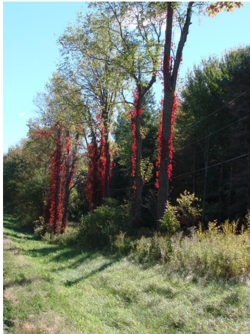
Parthenocissus quinquefolia. Note the high climbing habit.