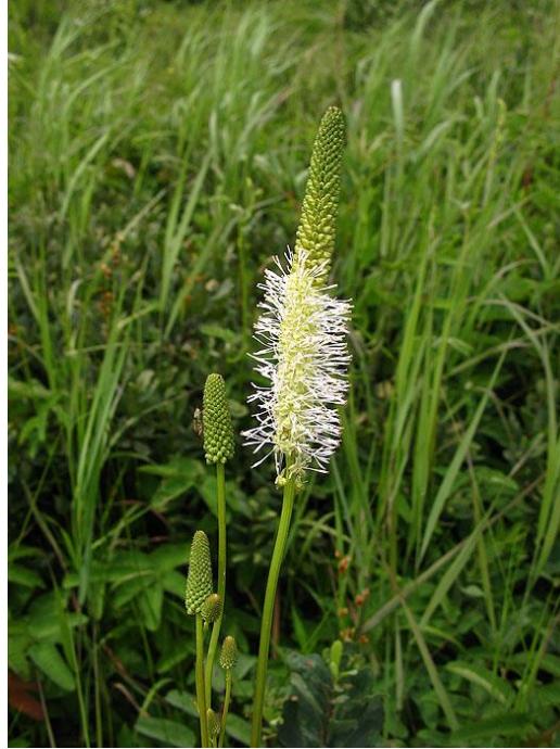
Sanguisorba canadensis.