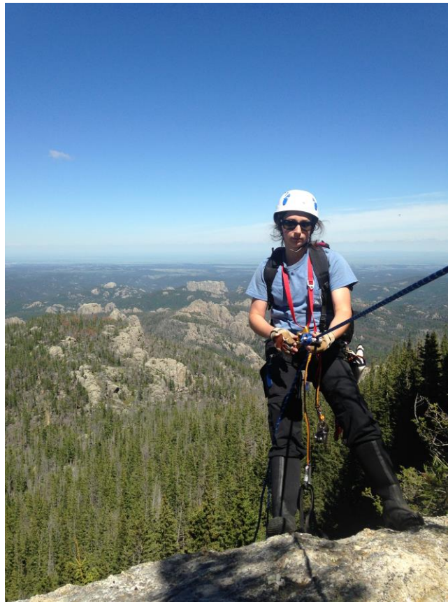
Figure 3. The author using the rappelling equipment to access Leedy's roseroot plants.

In summer 2015, I measured the microsites of Leedy's roseroot on cliffs along Seneca Lake near Glenora, NY. These measurements included: long-term temperature, cliff stability, seep rate, and associated species of Leedy's roseroot. To access plants growing high on cliffs, I used rappelling equipment, which NYFA helped me to purchase (Fig. 3). This was an indispensable aspect of the study, as there would have been no other way to adequately sample Leedy's roseroot's microsites on cliff faces where highly heterogeneous conditions occur (Larson et al. 2000).