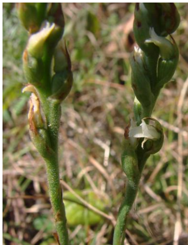
Spiranthes casei flowers.

Spiranthes casei (Case's Ladies' Tresses). A bonus found when surveying the many S. magnicamporum in a field in Massena, this one growing on a dry mound.