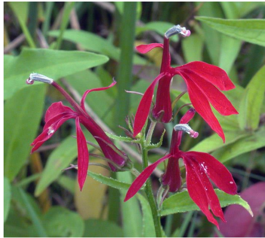
Lobelia cardinalis.