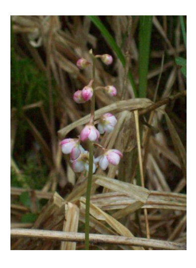
The flowers of pink wintergreen, Fitzgerald Pond.

Right away, after crossing the water filled moat, we were instantly treated to a showy lady's-slipper (Cypripedium reginae) and a pink wintergreen (Pyrola asarifolia) in flower. Other showy and not so showy (but exciting) finds followed (see the accompanying list).