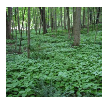
Salvia glutinosa flower, habit, and example of incursion.