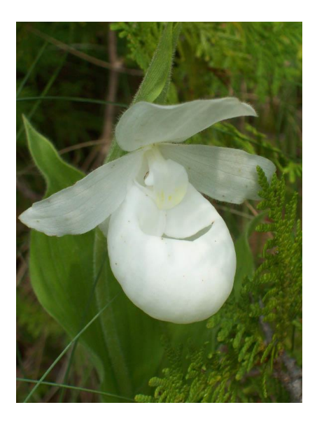
The white showy lady's-slipper at Fitzgerald Pond.

toward the back of the fen, well worth the slog to get there. Who would have thought, since showy lady's-slippers are so, well, showy, that a white lady-slipper would be so striking! But it certainly was.