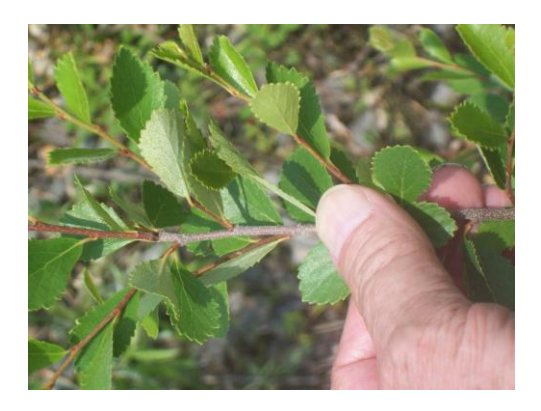
Dwarf Birch at Bonaparte.

After traversing much of the area and eating lunch on the bog mat, we all slowly made our way back up the steep slope and out to the road, after which we had a walk down the railroad tracks at Bonaparte and a quick look into the shrub fen portion to the south of the tracks, where we were able to see much dwarf birch. All in all, the trip was deemed a success despite the heat.