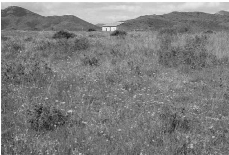
Xerophile pseudo-steppic grassland on calcareous soil. Murcia (SE Spain).

62 Semi-natural dry grasslands and scrubland facies