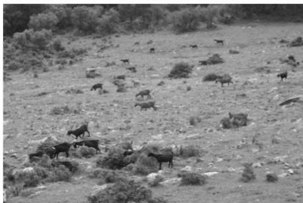
Thermophile Poetalia clay soil community: Plantaginion serrariae (Trifolio subterranei – Plantaginetum serrariae). Browsed shrub-like wild olive trees (Olea europaea subsp. silvestris) are scattered over the sward. Cadiz (southern Spain).

The most characteristic species of this sub-type are: Poa bulbosa , Bellis annua , Parentucellia latifolia , Trifolium subterraneum (oligotrophic soils), Trifolium scabrum , Plantago albicans , annual medics: Medicago sp. (eutrophic soils), Plantago serraria (clay soils).