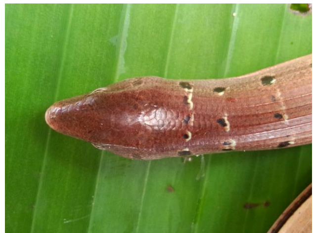
Fig.2. Dopasia gracilis (BM2014-02) from Bach Ma NP, Thua Thien-Hue province.