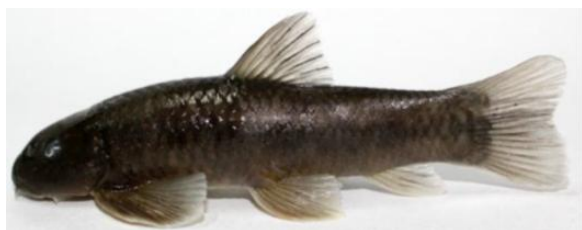
Figure 8 | Garra manipurensis .

Dorsal fin with 3 simple, 8 ½ branched rays, smoky, second branched ray longest and presence of black streak on interradiial membrane. Dorsal-fin origin anterior to pelvic-fin origin. Pectoral fin with 8-9 simple, 10-11 branched rays, smoky, rounded, eight branched ray longest, not extending to pelvic-fin origin with white margin to anterior ray tips. Pelvic fin with 2 simple 8 ½-9 ½ branched rays, smoky, rounded tip, third branched ray longest, not extending to base of anal-fin origin. Anal fin with 3 simple 5 ½ branched rays; short, subacuminate, second branched ray longest and tips extending towards caudal-fin base but not reaching it. Caudal fin with 10+9 principal rays (9+8) branched rays, slightly emarginated, lobe tips slightly rounded, both lobes of equal length. Predorsal region with 19-20 scales. Chest scale deeply embedded in skin. Circumpeduncular scale consisted of 16-18 scales. Lateral line complete with 30-33+2 scales, lateral line scales in transverse row ½ 4/1/3.