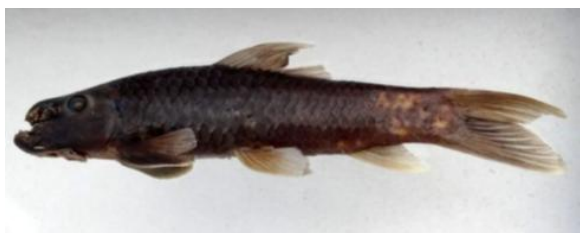
Figure 4 | Garra cf. koladynensis .

Body elongated, compressed laterally till caudal peduncle region. Dorsal profile of body ascending slightly to dorsal-fin origin, ventral profile of body more or less straight to anal-fin origin. Head region moderately depressed and large. Eyes placed in dorsolateral posterior part of head. Barbels occur in two pair, maxillary barbel and rostral barbel. Upper jaw covered by thin rostral cap disc, elliptical, shorter than wide. Dorsal fin with 2-3 simple, 8 ½ branched rays inserted anterior to vertical from pelvic-fin origin, first branch ray longest. Pectoral fin with 1 simple and 14-15 branch rays reaching beyond midway to pelvic-fin origin. Pelvic fin with 1 simple and 7 ½ branch rays, reaching beyond midway to anal fin-origin. Anal fin with 2 simple, 5 ½ branch rays, first branched ray longest, reaching base of caudal-fin base. Caudal fin with 9-10+9 rays, forked, tips pointed lobes of equal length. Lateral line complete with 31-32 + 2-3 scales and the lateral scale in transverse row is ½ 4-4/1/3.