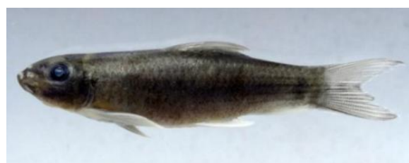
Figure 9 | Garra cf. khawbungii .

convex appearance, from pelvic-fin origin to anal-fin origin remains straight. Head large; interorbital region convex. Snout rounded from dorsal view, shorter, not elongated as proboscis, presence of weak transverse groove with pointed tubercles arranged irregularly as three rows on each side. Two pairs of barbells; maxillary and rostral barbels present. Rostral cap well developed, cover entirely upper jaw region. Central pad elliptical shape with width greater than length. Dorsal fin with 2-3 simple, 8 branched rays; origin slightly anterior to pelvic-fin-origin, first branched dorsal fin ray longest. Pectoral fin with 1 simple, 16 branched ray with slightly pointed posterior margin, fin insertion close to gill opening region, fourth branch ray longest. Pelvic fin with 1 simple, 8 branched ray, posterior margin not reaching anal-fin origin but covers anus region. Anal fin with 2 simple, 5 branched rays; posterior margin not reaching base of caudal fin. Caudal fin with 9+8 branch rays, forked, both upper and lower lobe of equal length. Lateral line complete with 32-33+2 scales. The lateral line scales in transverse row ½ 3-4/1/2. Circumpeduncular scale 16, predorsal scale 9-10.