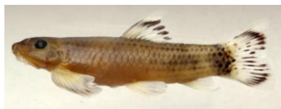
Figure 3 | Garra flavatra .

base of anal fin. Anal fin short, subacuminate with 2 simple 4 ½ branched rays, first branched ray longest, tip extending slightly beyond base of caudal fin. Caudal fin with 10-9+9 rays, emarginated, both lobes of equal length, tip rounded, infra-marginal band along posterior margin, black on lobes, dark grey on middle rays; two vertical rows of irregular black spots across middle of fin. Lateral line scale complete with 28-29+2 scales, lateral transverse scale in transverse rows ½ 3/1/3. Circumpeduncular scale 16.