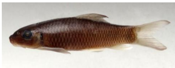
Figure 6 | Garra nigricollis .

short papiliferous fold extending from corner of mouth between exposed lower jaw and upper lip. Dorsal fin inserted anterior to pelvic fin-origin, falcate with 2 simple and 8 ½ branched rays. Pectoral fin with 1 simple, 16 branched rays, sub acuminate, fourth branch ray longest but not extending up to pelvic-fin base. Pelvic fin with 1 simple 7 ½ branched rays, sub acuminate, first branch ray longest, margin not extending beyond anal-fin base. Anal fin with 2 simple, 5 ½ branched rays, short, subacuminate, first branched ray longest, margin extending beyond base of caudal-fin origin. Caudal fin with 9-10+9 rays, deeply emarginated, lobe pointed. Lateral line scale 32-34+3, lateral line scale in transverse rows 4/1/3. Predorsal scale 10-12; circumpeduncular scales 16. Chest scale between pectoral fin deeply embedded in skin. Presence of indistinct dark grey rounded blotch on posterior side of caudal peduncle.