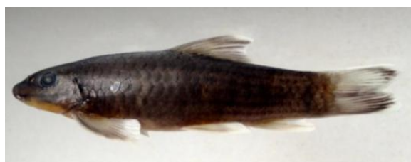
Figure 7 | Garra rakhinica .

ing to margin of rostral cap. Central pad in lower lip slightly wider than long. Dorsal-fin origin anterior to pelvic-fin origin. Dorsal fin falcate, long subacuminate tip with 2 simple and 8 branch fin rays. Anal fin with 2-3 simple, 5 branched rays, short with straight posterior margin, first branched ray longest, extending slightly beyond base of caudal fin. Pectoral fin with 1 simple, 15 branched ray, subacuminate, fourth branched ray longest. Caudal fin with 10+9 rays, emarginated, lobes equal, tips blunt, of a distinct w shaped dark band. Pelvic fin with 1 simple, 8 branched rays. Circumpeduncular scales 16. Lateral line complete with 29+1-2 scales. Lateral transverse scales 3/1/2-3.