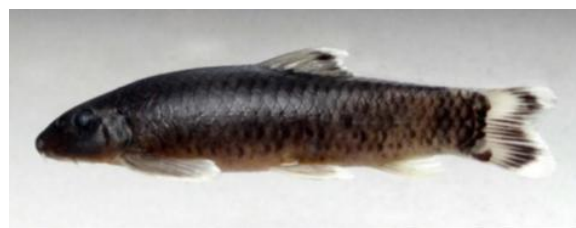
Figure 5 | Garra cf. matensis .

after sloping down towards caudal peduncle. Ventral profile of body almost straight from pectoral fin to pelvic-fin origin. Predorsal region scaled absence of scale on chest and abdominal portion. Dorsal fin with 2 simple, 6 branched rays, presence of dark streak or bar near free margin of dorsal fin. Pectoral fin with 1 simple 14-16 branched rays. Anal fin with 2 simple, 4 ½ branched rays and short. Pelvic fin with 1 simple, 6 ½-7 ½ branched rays. Predorsal scale 13-14. Caudal fin with 10+9 (9+8 branched) rays. Presence of thin, light black W- shaped band on posterior half of caudal fin. Upper and lower lobe of caudal fin of equal length. Lateral line complete with 30-31+2 scales. Lateral line scales in transverse row ½ 3-4/1/3; circumpeduncular scale 16. Presence of 1 pair of barbel.