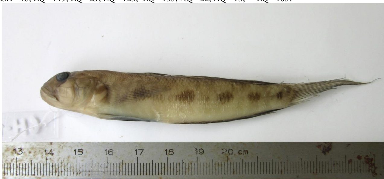
Oxyurichthys tentacularis (Valenciennes, 1837).

Material examined (15 specimens): CH - 07; CH - 10; CH - 09; CH - 20; CH - 35; CH - 40; CH - 17; CH - 18; LQ - 119; LQ - 29; LQ - 123; LQ - 135; NQ - 22; NQ - 13; LQ - 105.