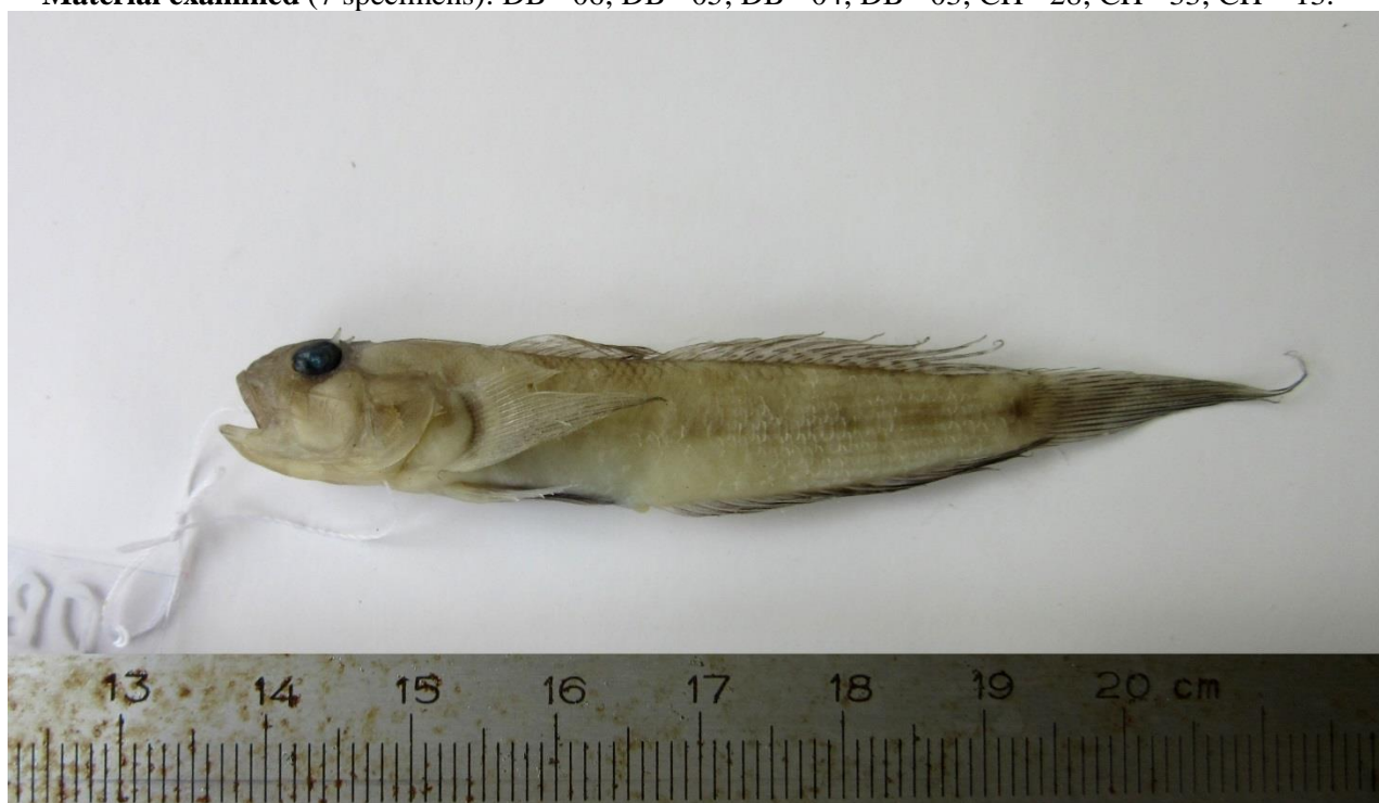
Oxyurichthys ophthalmonema (Bleeker, 1856).

Material examined (7 specimens): DB - 06; DB - 05; DB - 04; DB - 03; CH - 28; CH - 33; CH - 13.