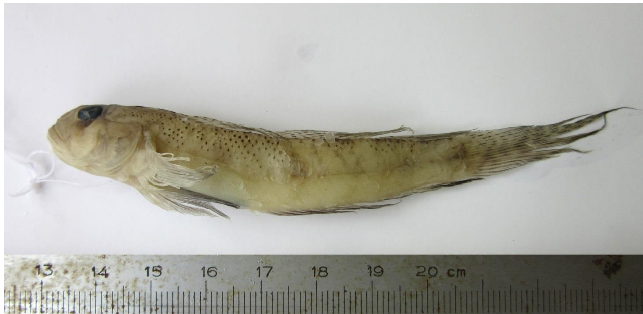
Oxyurichthys visayanus Herre, 1927

Material examined (8 specimens): CH - 08; CH - 12; CH - 45; CH - 32; CH - 28; CH - 23; CH - 01; CH - 16.