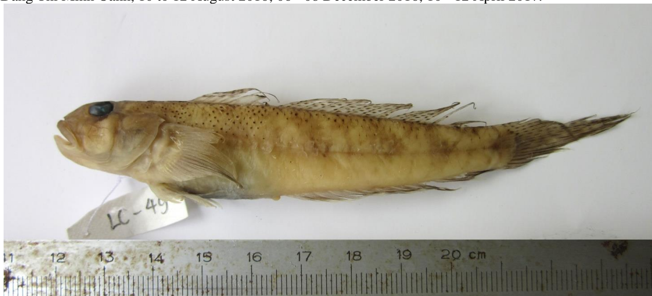
Oxyurichthys microlepis (Bleeker, 1849).