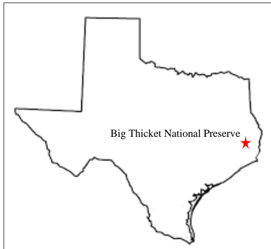
Figure 1: Location of the Big Thicket National Preserve.