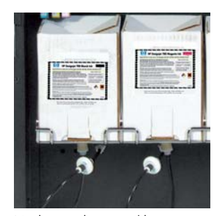
No-drip, quick connect/disconnect HP Designjet 788 inks