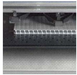
Molded pinch rollers for accurate alignment. No adjustments necessary