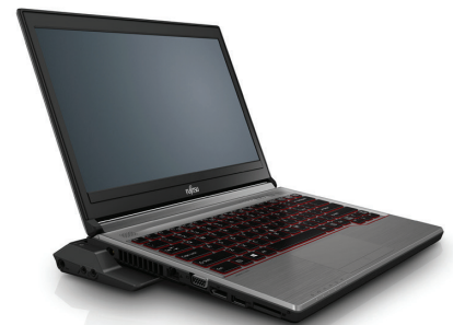
Shown with optional Port Replicator