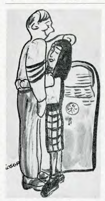
"I do love you, even if you are an Idaho athlete."

There was once a story concerning one of the more violent of these episodes which occurred on a wintry January night. The participants were returning from their secret ceremonies when one of the pledges, in somewhat of a sorry plight, wandered away from the rest. The members, having a few bottles of White Horse still on their persons, did not notice the absence for an hour or so. It was then discovered that the poor fellow was missing and a search was organized. When they found him he was covered by a blanket—a half inch of snow. The lad was a bit stiff and so a special process of rejuvination was employed which