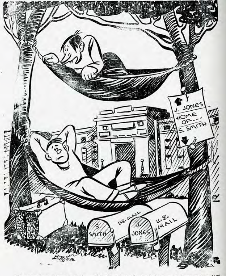
"Remember when we thought that jungle training was impractical?"