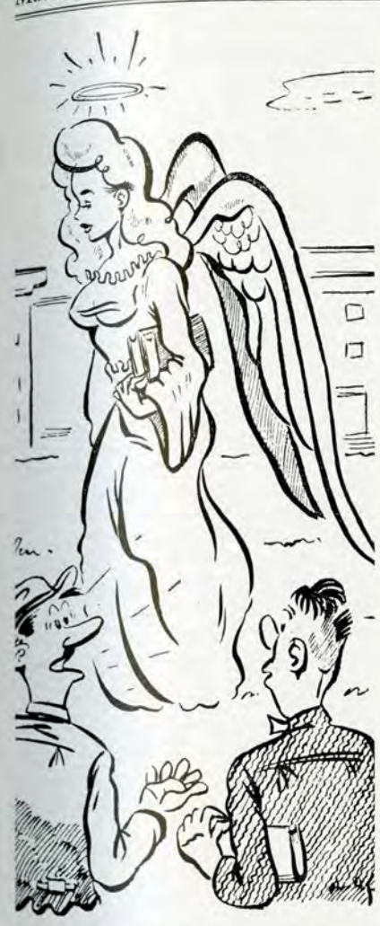
"I understand she's not very popular around the campus."