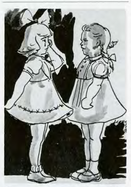
"You meany, my Daddy is Not a B.T.O.!"

My impression of the first scene was that grandmother had seen it somewhere before, but then I knew