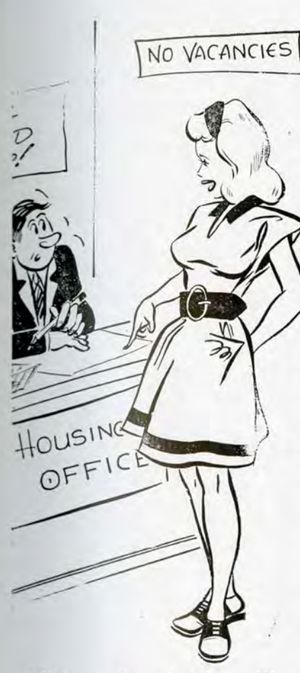
"Not even in a frat house?"

Lee Balderston strolled into a bar and sat down on a stool alongside a cute little lass.