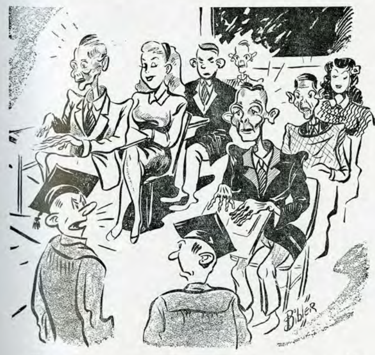
"I wish the government would pay the veterans more promptly"