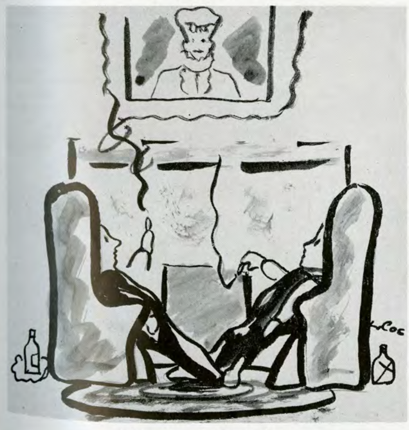
"Sometimes I hate people." "Me, too."