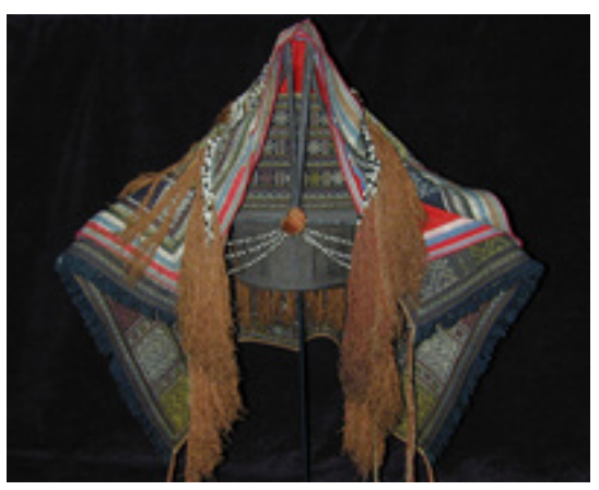
Yao woman's ceremonial hat set hat front closeup Guanxi early-mid 1900s