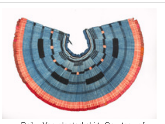
Baiku Yao pleated skirt.

The Yao are unique among the Hill Tribes of Asia because they documented their own history in books throughout the centuries. A selection of these historical scrolls and books will be on view. Additional highlights include antique textiles, clothing, headdresses, silver jewelry, ancestor paintings and priests' and shamans' ritual objects.