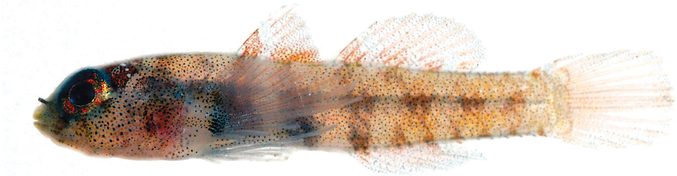
Figure 6. Eviota filamentosa , fresh paratype, OMNH-P 34246.