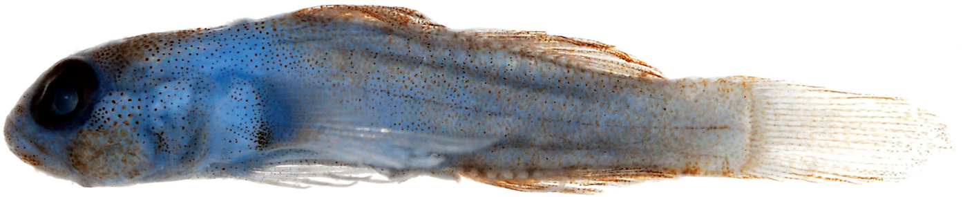
Figure 4. Eviota filamentosa , preserved and stained holotype, KAUM-I. 50855. Photograph by Toshiyuki Suzuki.

and genital papilla not cup-like); E. indica has a caudal peduncle spot that is higher than wide (vs. round); E. latifasciata has a postocular spot, four broad, dark, postanal internal bars, and no markings under the eye (vs. no postocular spot, six postanal bars, and markings under the eye); E. saipanensis has four postanal internal bars and a cup-like genital papilla (vs. six bars and genital papilla not cup-like); and E. zonura has five postanal internal bars and the genital papilla is fimbriate (vs. six bars and genital papilla not fimbriate).