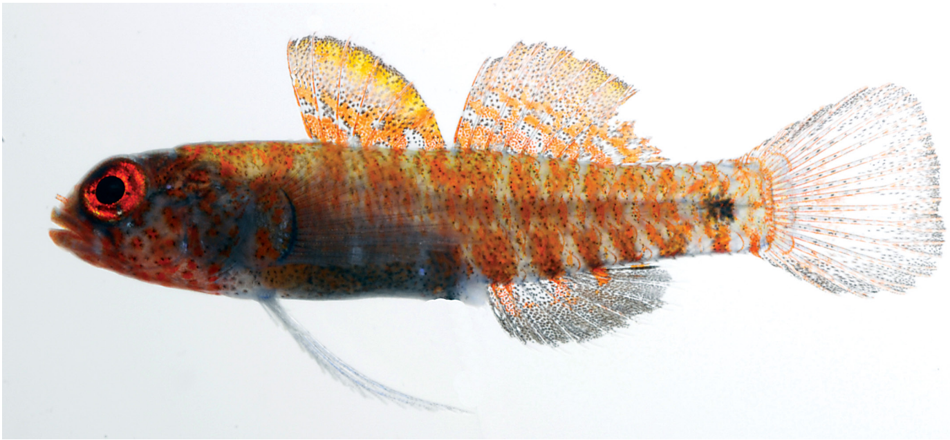
Figure 2. Eviota shibukawai , freshly collected holotype, NSMT-P 114946.

bars; body heavily peppered with dark chromatophores; genital papilla neither fimbriate nor cup-like; no distinct dark spots on the pectoral-fin base; and no postocular spot.