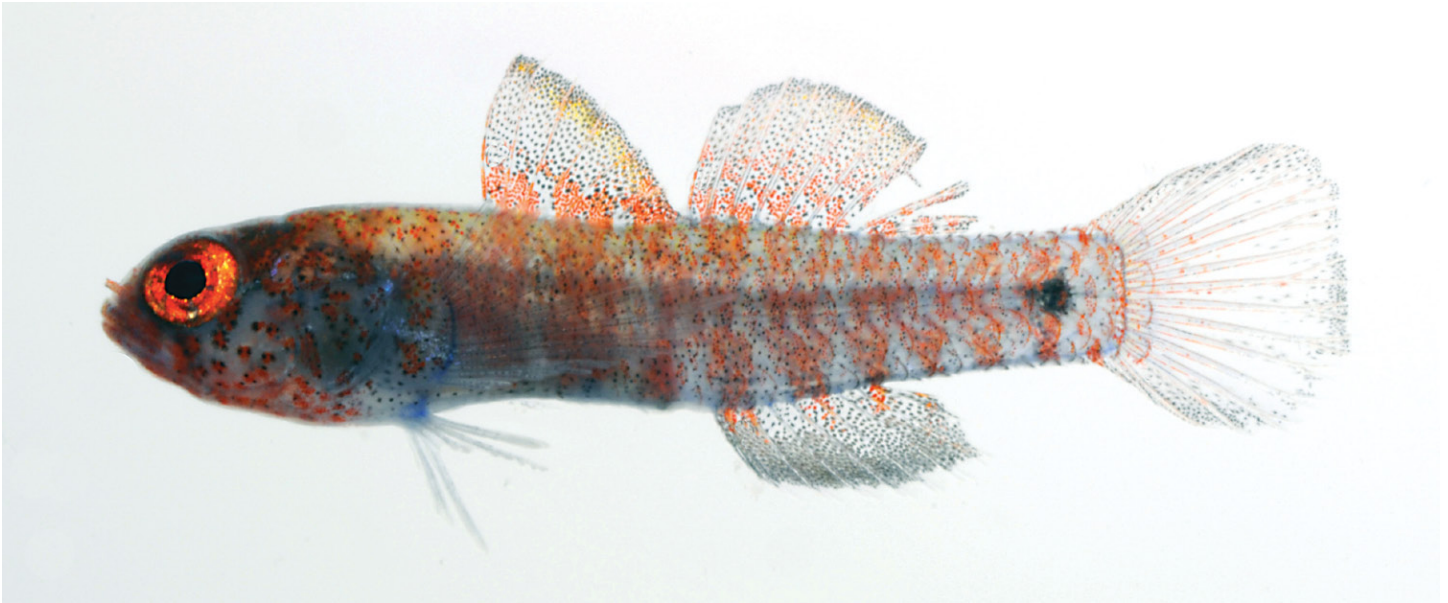
Figure 3. Eviota shibukawai , freshly collected paratype, NSMT-P 114947.

band of chromatophores, lower half lighter with a few scattered larger, dark chromatophores. Distal half of second dorsal fin densely peppered with brown chromatophores, lower half with fewer, larger, brown chromatophores. Dorsal, ventral, and distal margins of caudal fin edged with dark brown chromatophores, center portion with larger dark chromatophores on rays. Pelvic and pectoral fins with dark chromatophores along rays.