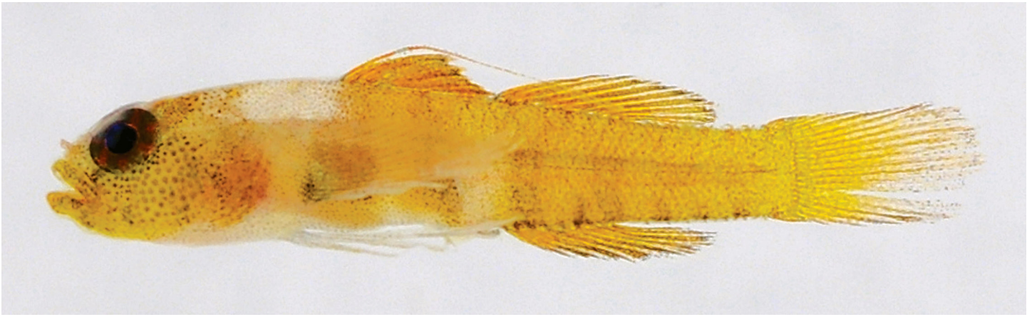
Figure 7. Eviota filamentosa , fresh holotype in breeding color, KAUM-I. 50855.

of dark chromatophores overlaid with orange. Operculum red-orange. Triangular wedge of dark chromatophores behind eye red, with three small white spots dorsally. Pupil of eye black, iris gold with red spokes radiating out from pupil, dorsal portion of iris black. First four spines of first dorsal fin with basal third orange, central third clear, distal third with orange spines and peppering of melanophores, remainder of fin with basal third orange, upper two-thirds with orange spines and a peppering of melanophores. Second dorsal fin with orange extensions of body bars onto base of fin, remainder of fin with orange rays and clear membranes lightly peppered with melanophores. Caudal fin as in preserved holotype but light orange rays. Anal fin with orange extensions of body bars at base, remainder clear with a peppering of melanophores. Pelvic fins dusky. Lower four rays of pectoral fin dusky, remaining rays orange.