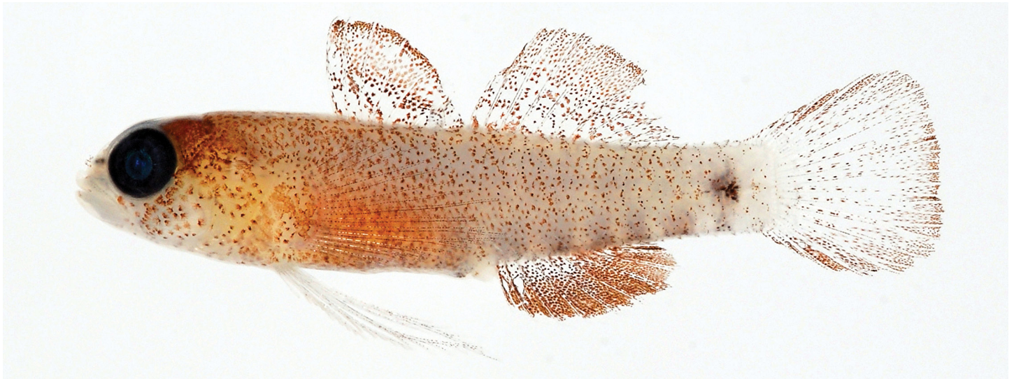
Figure 1. Eviota shibukawai , preserved holotype, NSMT-P 114946.

Measurements were made to the nearest 0.1 mm using an ocular micrometer, and are presented as percentage of Standard Length (SL). Cyanine Blue 5R (acid blue 113) stain was used to make pores more obvious (Akihito et al. 1993, Saruwatari et al. 1997, Akihito et al. 2002), and an airjet was used to observe them. Counts and measurements are presented for the holotype first, followed by the paratype in parentheses, if different. Type materials have been deposited at KAUM (Kagoshima University Museum, Kagoshima, Japan) and NSMT (National Museum of Nature and Science, Tsukuba, Japan).