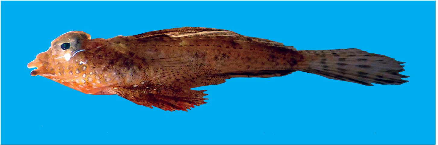
Figure 1. Callionymus madangensis n. sp., NTUM 10146, holotype, male, 19.3 mm SL, Papua New Guinea, Madang, Madang Bay; Photograph taken immediately after collection.