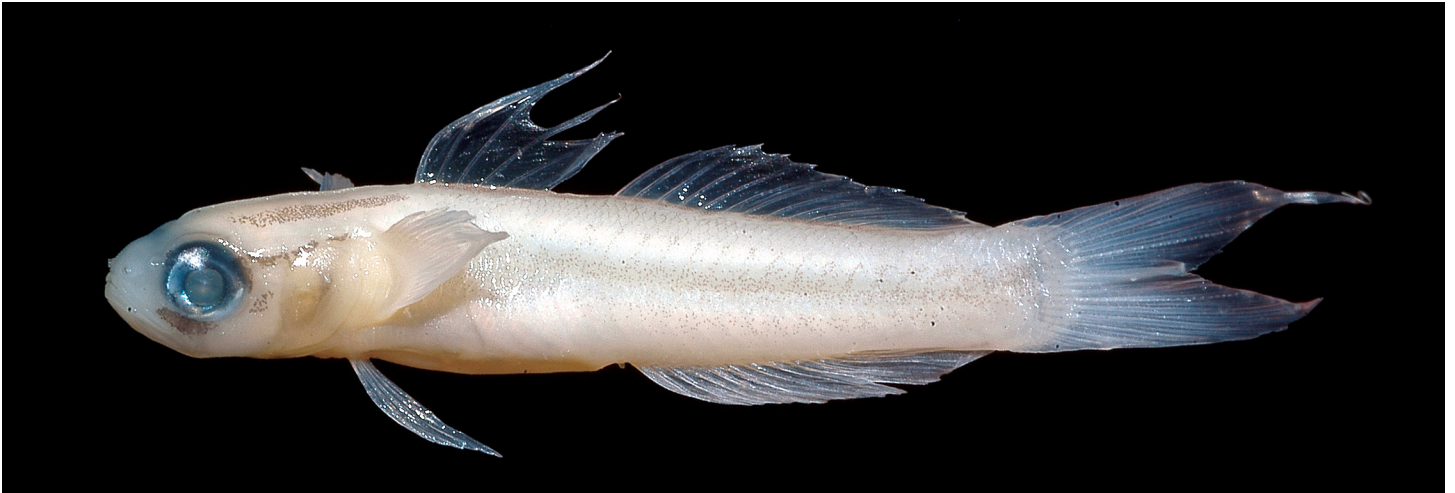
Figure 2. Navigobius vittatus , preserved holotype, WAM P.34032–001, 23.0 mm SL, male, Brunei Darussalam (G.R. Allen).

Description. Dorsal-fin rays VI + I,12 [I,11 (4), I,12 (19), I,13 (1)]; anal-fin rays I,11 [I,10 (1), I,11 (19), I,12 (4)]; dorsal and anal-fin rays branched distally, last branched at base; pectoral-fin rays 18 [(18 (20), 19 (4)], upper two and lower two unbranched; pelvic-fin rays I,4, fourth ray unbranched; segmented caudal-fin rays 17; branched caudal-fin rays 11, only these reaching posterior margin of fin; 3 segmented, unbranched caudal rays on each lobe; upper and lower procurrent caudal rays 7–8; scales in longitudinal series 55 [52 (1), 53 (3), 54 (2), 55 (4), 56 (2), 57 (2), 58 (1)]; scales in transverse series 13 (usually 13, occasionally 12 or 14 in paratypes); gill rakers 4 + 11 (4–5 + 11; 5 paratypes counted); dorsal pterygiophore formula 3-22110; vertebrae 10 + 16 = 26 (holotype and 7 paratypes).