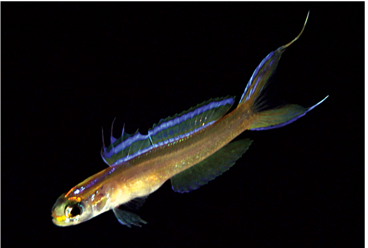
Figure 3. Navigobius vittatus , underwater photograph of male, approx. 22 mm SL, Brunei Darussalam (M.V. Erdmann).

Description. Dorsal-fin rays VI + I,12 [I,11 (4), I,12 (19), I,13 (1)]; anal-fin rays I,11 [I,10 (1), I,11 (19), I,12 (4)]; dorsal and anal-fin rays branched distally, last branched at base; pectoral-fin rays 18 [(18 (20), 19 (4)], upper two and lower two unbranched; pelvic-fin rays I,4, fourth ray unbranched; segmented caudal-fin rays 17; branched caudal-fin rays 11, only these reaching posterior margin of fin; 3 segmented, unbranched caudal rays on each lobe; upper and lower procurrent caudal rays 7–8; scales in longitudinal series 55 [52 (1), 53 (3), 54 (2), 55 (4), 56 (2), 57 (2), 58 (1)]; scales in transverse series 13 (usually 13, occasionally 12 or 14 in paratypes); gill rakers 4 + 11 (4–5 + 11; 5 paratypes counted); dorsal pterygiophore formula 3-22110; vertebrae 10 + 16 = 26 (holotype and 7 paratypes).