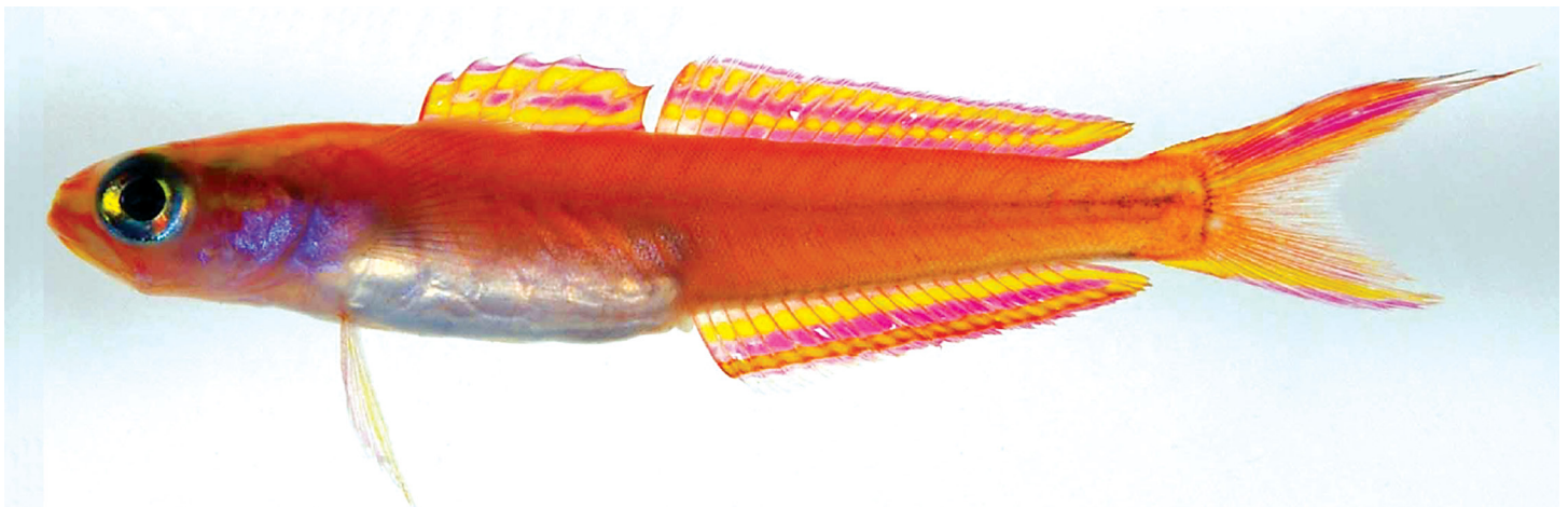
Figure 6. Navigobius dewa , holotype, AMS I.44800–001, 37.5 mm SL, Kagoshima, Japan (from Hoese & Motomura 2009).

The new species is similar to Navigobius dewa (Fig. 6) in general body shape (including a prominently forked caudal fin), possession of ctenoid scales on the posterior body, and in the pattern of cephalic sensory canals and associated pores. However, it differs markedly from N. dewa in having a much reduced number of soft dorsal and anal-fin rays (11–13 and 10–12 versus 19 and 18–19 respectively for N. dewa ). The first dorsal fin of N. vittatus is conspicuously taller than the second dorsal fin due to its filamentous rays compared to N. dewa , which has subequal fins without any prolonged filaments. The new species also has much larger scales, as reflected by the smaller number of longitudinal scales (53–58 versus 97). There are additional marked differences in live coloration (compare Figs. 1 & 3 vs. 6) and maximum size (23 mm SL for N. vittatus vs. at least 45.2 mm SL for N. dewa ). The two taxa exhibit well-separated geographic ranges. Although N. dewa was first described from Kagoshima Bay, Japan (31° 35' 35" N, 130° 35' 25" S), it has also been observed (Hoese & Motomura 2009) off Amami-Oshima Island in the Ryukyu Islands, lying about 200 km to the south. Nevertheless, the two species are separated by a distance of approximately 3,000 km.