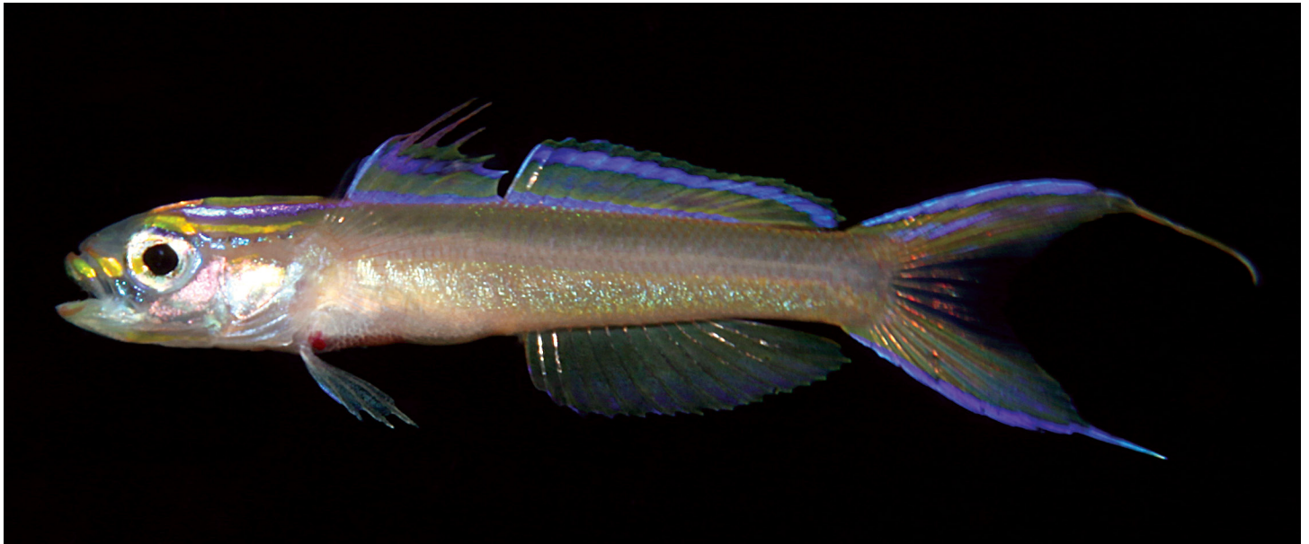
Figure 1. Navigobius vittatus , holotype anaesthetized underwater, WAM P.34032–001, 23.0 mm SL, male, Brunei Darussalam.

As per the recommendation of Chakrabarty (2010), a single 95% ethanol-preserved specimen collected with the type series was sequenced for four commonly-utilized mitochondrial genetic markers (the COI barcode marker, cytochrome b, control region, and 16S rRNA) using the methods described in Allen et al (2015) and these sequences designated the topogenotypes. The topogenotype voucher specimen (MB-0613701) is deposited at Udayana University's Indonesian Biodiversity Research Centre in Bali, Indonesia.